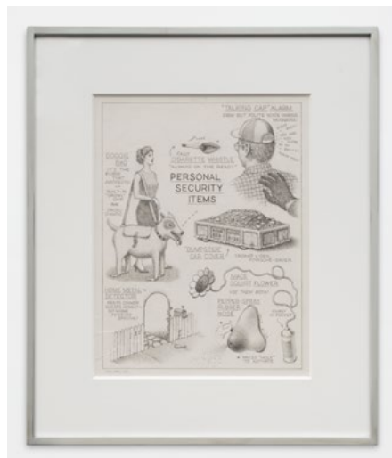
Untitled Pencil on paper 14.50h x 10.75w inches 199X USD 12000