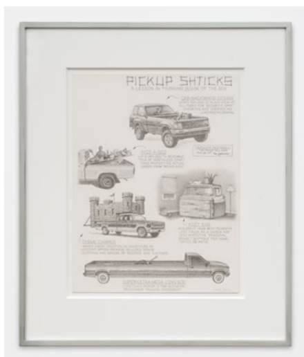
Untitled Pencil on paper 14.50h x 10.75w inches 199X USD 12000