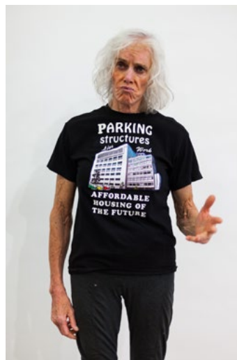
Untitled (Shirtstorm) T-shirt, mixed media printing Dimensions variable 2017 USD 300