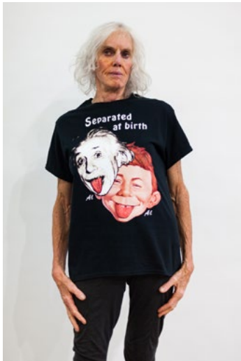
Untitled (Shirtstorm) T-shirt, mixed media printing Dimensions variable 2017 Not for sale