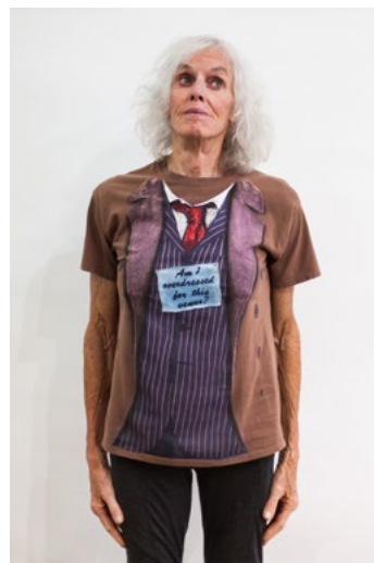
Untitled (Shirtstorm) T-shirt, mixed media printing Dimensions variable 2017 USD 300