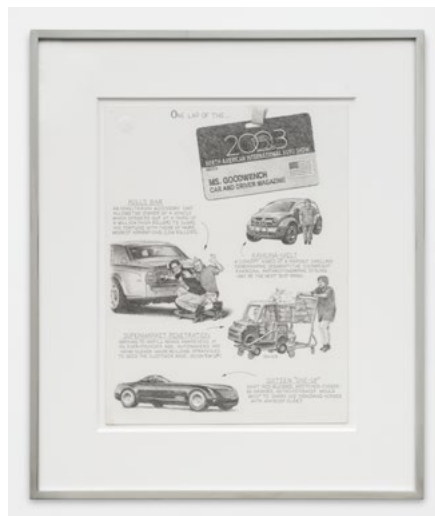
Untitled Pencil on paper 14.50h x 11w inches 199X USD 12000