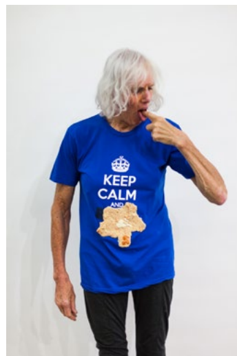
Untitled (Shirtstorm) T-shirt, mixed media printing Dimensions variable 2017 USD 300