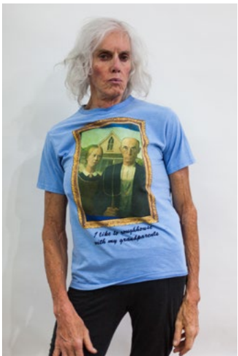
Untitled (Shirtstorm) T-shirt, mixed media printing Dimensions variable 2017 USD 300