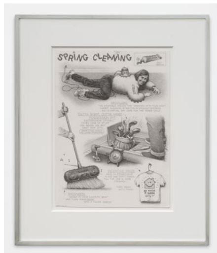
Untitled Pencil on paper 14.50h x 10.75w inches 199X USD 12000