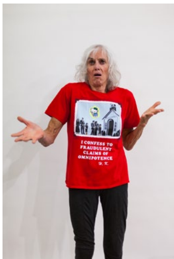
Untitled (Shirtstorm) T-shirt, mixed media printing Dimensions variable 2017 Not for sale