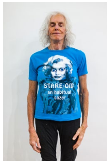
Untitled (Shirtstorm) T-shirt, mixed media printing Dimensions variable 2017 Not for sale