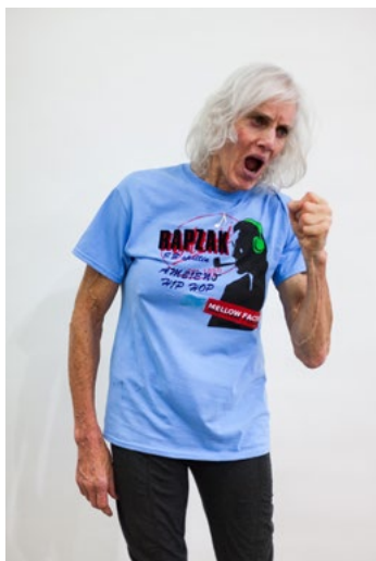
Untitled (Shirtstorm) T-shirt, mixed media printing Dimensions variable 2017 Not for sale