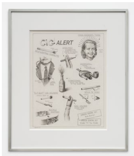
Untitled Pencil on paper 14.50h x 11w inches 199X USD 12000