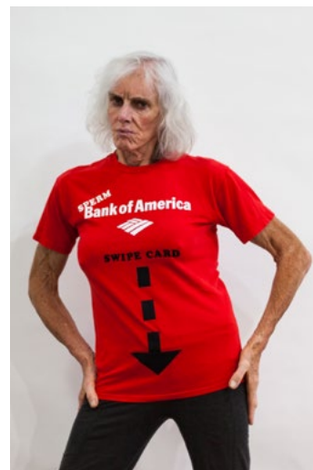
Untitled (Shirtstorm) T-shirt, mixed media printing Dimensions variable 2017 USD 300