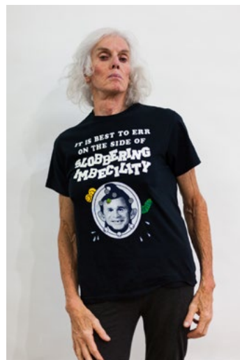
Untitled (Shirtstorm) T-shirt, mixed media printing Dimensions variable 2017 USD 300