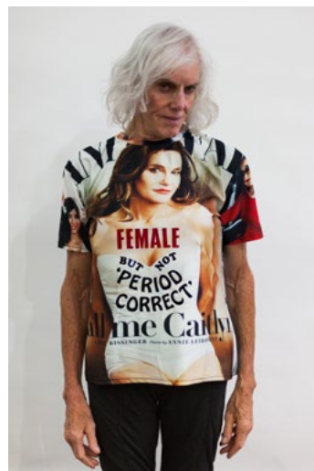
Untitled (Shirtstorm) T-shirt, mixed media printing Dimensions variable 2017 Not for sale