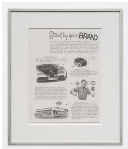
Untitled Pencil on paper 14.50h x 10.75w inches 199X USD 12000