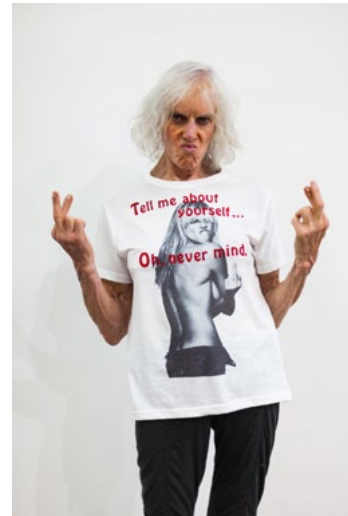
Untitled (Shirtstorm) T-shirt, mixed media printing Dimensions variable 2017 Not for sale