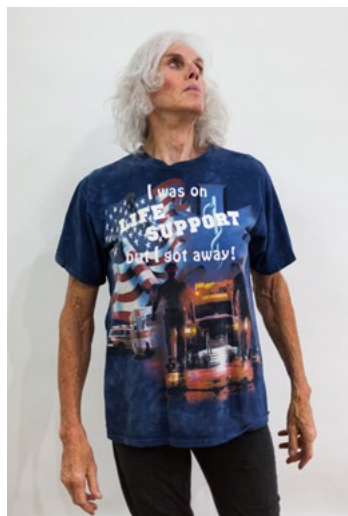
Untitled (Shirtstorm) T-shirt, mixed media printing Dimensions variable 2017 Not for sale