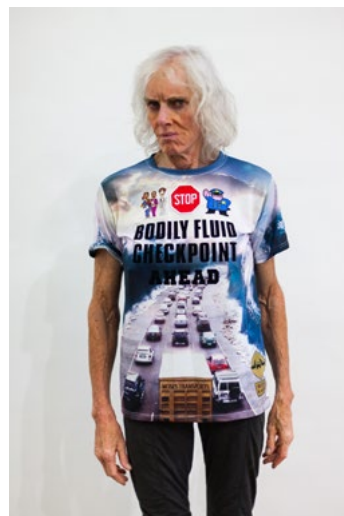
Untitled (Shirtstorm) T-shirt, mixed media printing Dimensions variable 2017 USD 300