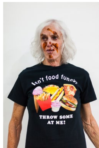
Untitled (Shirtstorm) T-shirt, mixed media printing Dimensions variable 2017 Not for sale