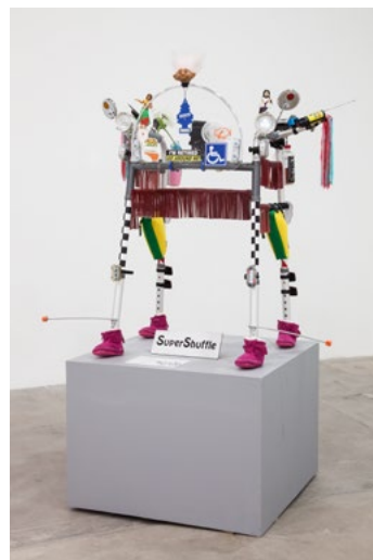
Super Shuffle Mixed media 42h x 42w x 21d inches 2018 USD 8000