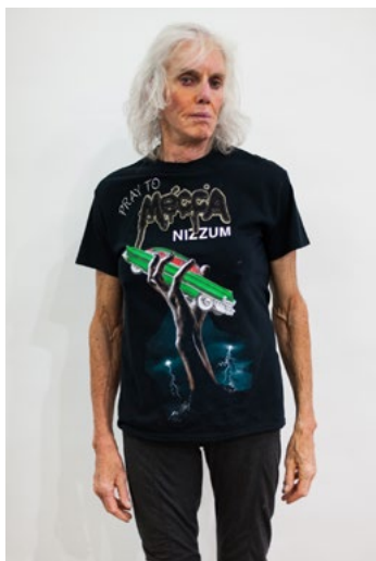
Untitled (Shirtstorm) T-shirt, mixed media printing Dimensions variable 2017 USD 300