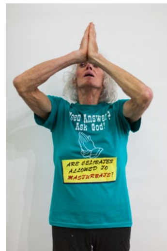
Untitled (Shirtstorm) T-shirt, mixed media printing Dimensions variable 2017 Not for sale