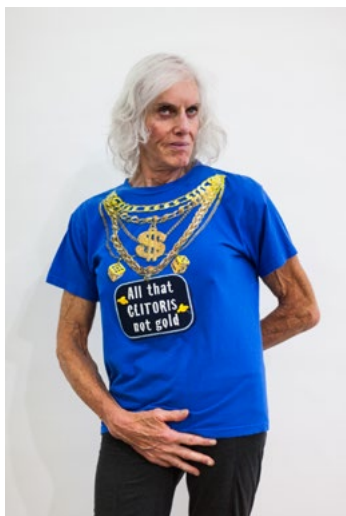
Untitled (Shirtstorm) T-shirt, mixed media printing Dimensions variable 2017 USD 300