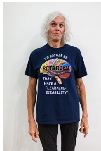
Untitled (Shirtstorm) T-shirt, mixed media printing Dimensions variable 2017 Not for sale