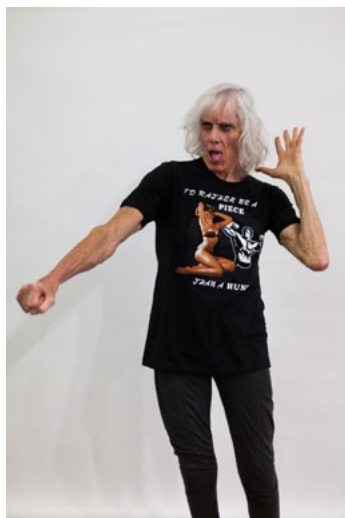
Untitled (Shirtstorm) T-shirt, mixed media printing Dimensions variable 2017 Not for sale