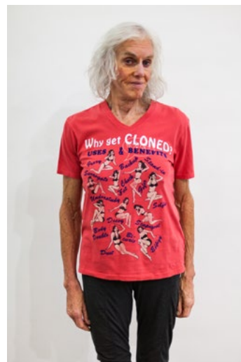
Untitled (Shirtstorm) T-shirt, mixed media printing Dimensions variable 2017 USD 300