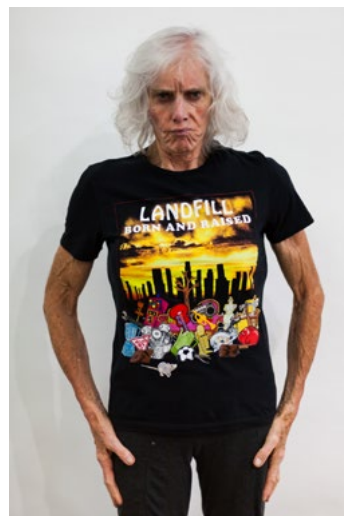
Untitled (Shirtstorm) T-shirt, mixed media printing Dimensions variable 2017 USD 300