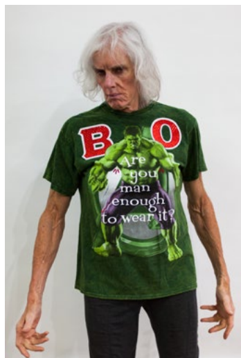
Untitled (Shirtstorm) T-shirt, mixed media printing Dimensions variable 2017 USD 300