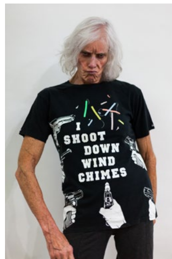
Untitled (Shirtstorm) T-shirt, mixed media printing Dimensions variable 2017 USD 300