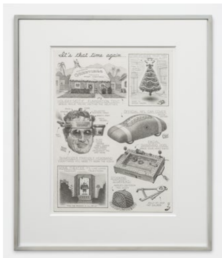
Untitled Pencil on paper 14.50h x 11w inches 199X USD 12000