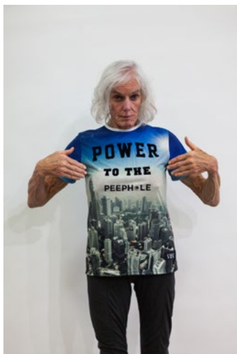
Untitled (Shirtstorm) T-shirt, mixed media printing Dimensions variable 2017 Not for sale