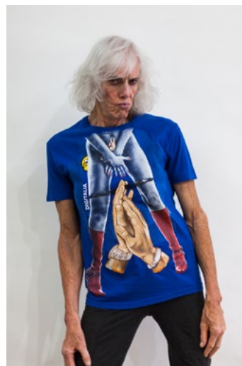
Untitled (Shirtstorm) T-shirt, mixed media printing Dimensions variable 2017 Not for sale