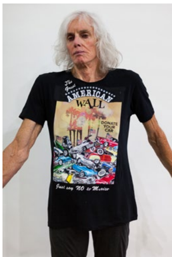
Untitled (Shirtstorm) T-shirt, mixed media printing Dimensions variable 2017 USD 300