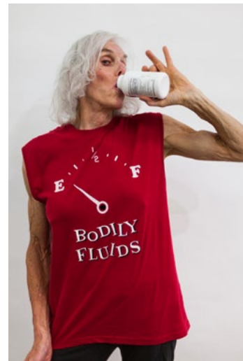
Untitled (Shirtstorm) T-shirt, mixed media printing Dimensions variable 2017 Not for sale