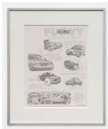
Untitled Pencil on paper 14.50h x 10.75w inches 199X USD 12000