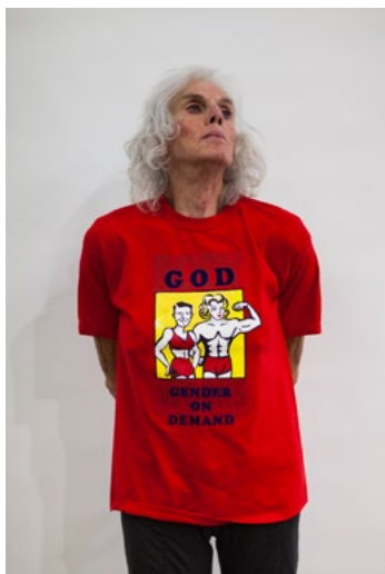
Untitled (Shirtstorm) T-shirt, mixed media printing Dimensions variable 2017 Not for sale