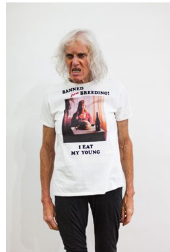
Untitled (Shirtstorm) T-shirt, mixed media printing Dimensions variable 2017 USD 300