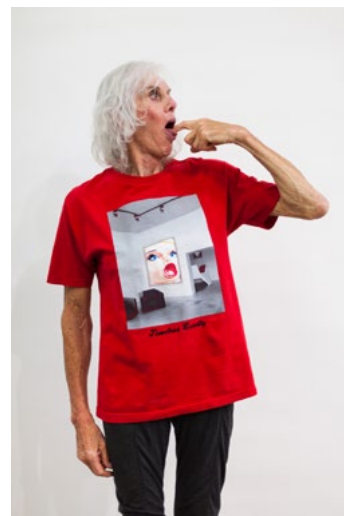
Untitled (Shirtstorm) T-shirt, mixed media printing Dimensions variable 2017 USD 300