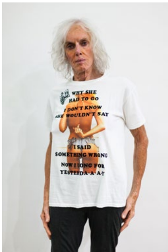
Untitled (Shirtstorm) T-shirt, mixed media printing Dimensions variable 2017 Not for sale