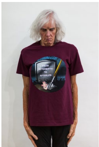
Untitled (Shirtstorm) T-shirt, mixed media printing Dimensions variable 2017 Not for sale