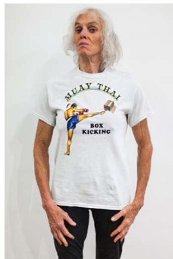
Untitled (Shirtstorm) T-shirt, mixed media printing Dimensions variable 2017 Not for sale