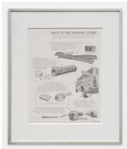
Untitled Pencil on paper 14.50h x 11w inches 199X USD 12000