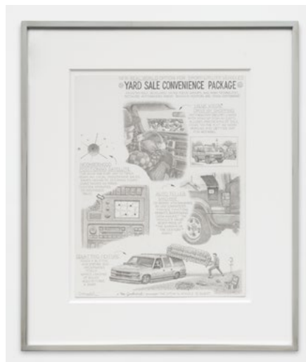
Untitled Pencil on paper 14.50h x 11w inches 199X USD 12000