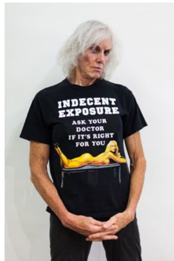
Untitled (Shirtstorm) T-shirt, mixed media printing Dimensions variable 2017 Not for sale