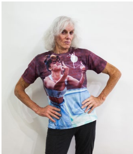
Untitled (Shirtstorm) T-shirt, mixed media printing Dimensions variable 2017 Not for sale