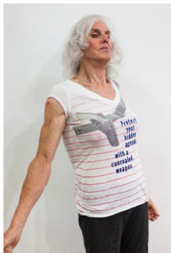
Untitled (Shirtstorm) T-shirt, mixed media printing Dimensions variable 2017 USD 300