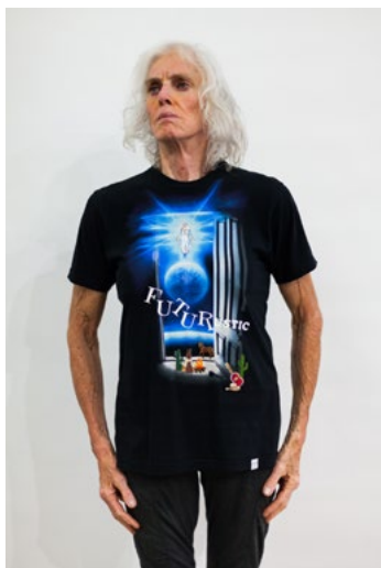
Untitled (Shirtstorm) T-shirt, mixed media printing Dimensions variable 2017 USD 300