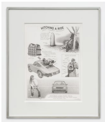
Untitled Pencil on paper 14.50h x 10.75w inches 199X USD 12000