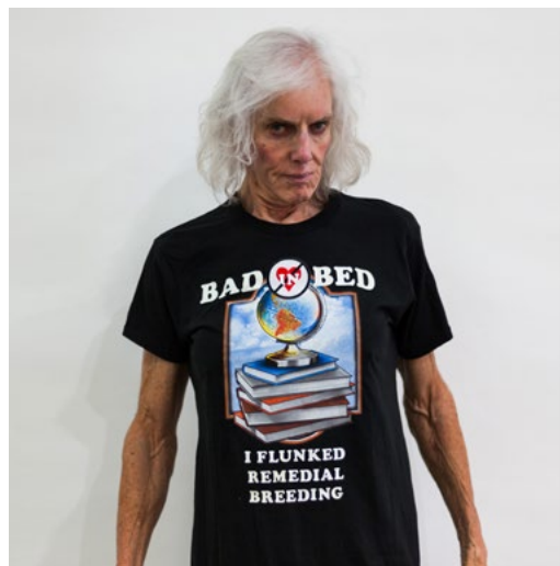
Untitled (Shirtstorm) T-shirt, mixed media printing Dimensions variable 2017 USD 300