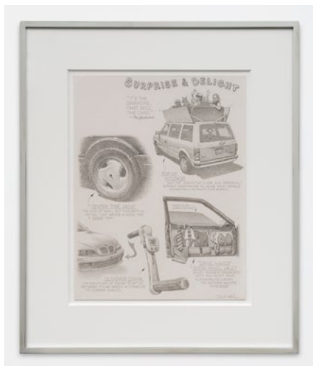
Untitled Pencil on paper 15h x 11.75w inches 199X USD 12000