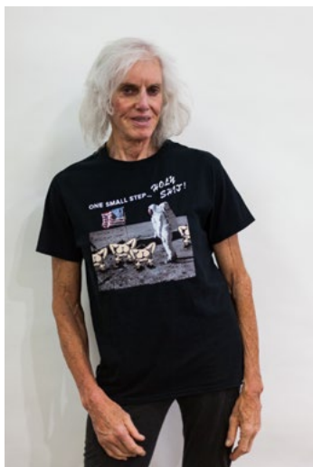
Untitled (Shirtstorm) T-shirt, mixed media printing Dimensions variable 2017 USD 300