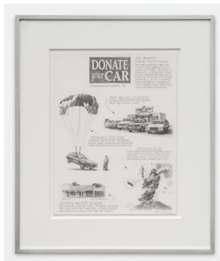
Untitled Pencil on paper 14.50h x 11w inches 199X USD 12000