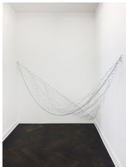
Melvin Edwards "Our thoughts between the lines", 2017 barbed wire, steel chain, screw eyes dimensions variable MED/I 2017/01