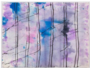
Melvin Edwards “Untitled”, c. 1974 watercolor and ink on paper 46 x 61 cm MED/P 1974/03