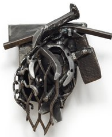
Melvin Edwards "Addis A.", 2007 welded steel 33 x 26 x 19 cm MED/S 2007/01