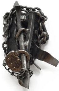
Melvin Edwards "Dan Okay", 2007 welded steel 29 x 25.5 x 16.5 cm MED/S 2007/02