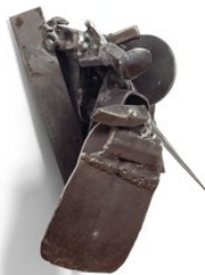
Melvin Edwards "Rule of Thumb", 2002 - 2005 welded steel 29 x 23.5 x 16 cm MED/S 2005/01