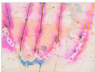
Melvin Edwards “Untitled”, 1974 watercolor and ink on paper 46.5 x 70 cm MED/P 1974/01