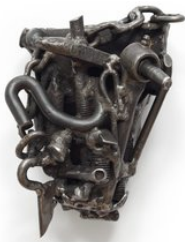
Melvin Edwards “Mojo 192”, 2005 welded steel 24 x 19 x 14 cm MED/S 2005/05