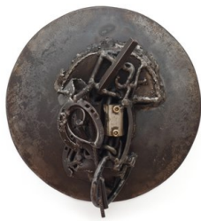
Melvin Edwards “MMOZ”, 2005 welded steel 43 x 43 x 23 cm MED/S 2005/03