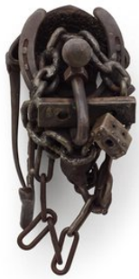
Melvin Edwards "Alteration", 2002 welded steel 25.5 x 15 x 15 cm MED/S 2002/01