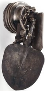
Melvin Edwards "Dig Again", 1999 welded steel 43 x 15 x 17 cm MED/S 1999/01