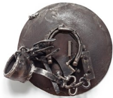
Melvin Edwards “For Emilio Cruz”, 2005 welded steel 36 x 44 x 15 cm MED/S 2005/04