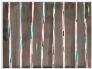
Melvin Edwards “Untitled”, c. 1974 watercolor and ink on paper 46 x 61 cm MED/P 1974/02