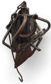
Melvin Edwards "Ekuafu", 1994 welded steel 40 x 27 x 21 cm MED/S 1994/01