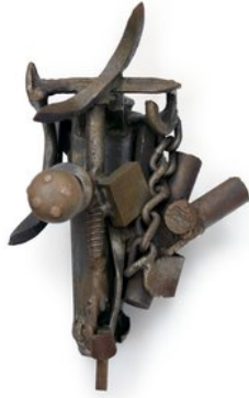
Melvin Edwards "Samora (For Samora Machel)", 1986 welded steel 30 x 20 x 22.5 cm MED/S 1986/01