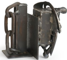
Melvin Edwards "Combination", 2005 welded steel 28 x 20 x 25.5 cm MED/S 2005/02