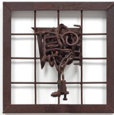
Melvin Edwards "Beyond Cabo Verde", 2006 welded steel 50 x 50 x 17 cm MED/S 2006/01