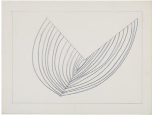
Melvin Edwards “Untitled Barbed Wire Study III”, 1970 grafit on paper 46 x 61 cm MED/P 1970/03