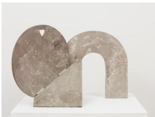
Melvin Edwards "Maquette for Confirmation", 1989 stainless steel 33 x 53 x 24 cm MED/S 1989/01