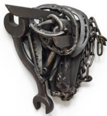
Melvin Edwards "Nite Work", 2012 welded steel 26.5 x 25.5 x 16.5 cm MED/S 2012/01