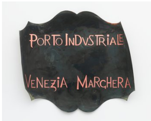
Sam Lewitt “Filler: Porto Industriale, Venezia - Marghera”, 2017 etching on copper-clad plastic, nails 103 x 122 cm SL/W 2017/18