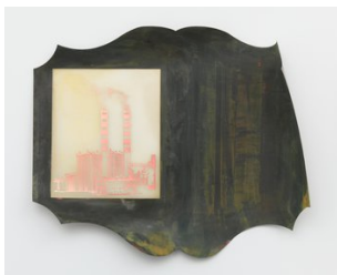
Sam Lewitt “Filler: Cover Page for ENEL - Modulo 2, Protezione Ambientale, Unita' Didattica 12, Emissioni”, 2017 etching on copper-clad plastic, nails 103 x 122 cm SL/W 2017/16