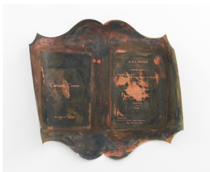
Sam Lewitt “Filler: “Caronia Cruise” Gala Dinner Menu, Excelsior Palace Hotel, Lido - Venice”, 2017 etching on copper-clad plastic, nails 103 x 122 cm SL/W 2017/14