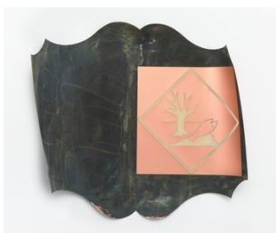
Sam Lewitt “Filler: Pictogram for Marine Pollutant Stipulated by Globally Harmonized System of Classification and Labeling of Chemicals (GHS)”, 2017 etching on copper-clad plastic, nails 103 x 122 cm SL/W 2017/17