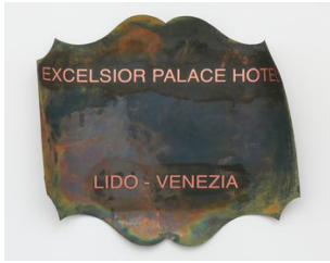
Sam Lewitt “Filler: Excelsior Palace Hotel, Lido - Venezia”, 2017 etching on copper-clad plastic, nails 103 x 122 cm SL/W 2017/15