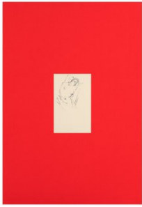
“1139[433 curves][1895-98][page 8]”, 2018 graphite on paper, mounted to book cloth 73.5 x 50.8 cm CT/P 2018/08