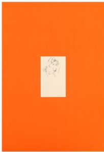
“1138[271 curves][1896-99][page 7]”, 2018 graphite on paper, mounted to book cloth 73.5 x 50.8 cm CT/P 2018/07