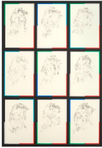
“Toolpaths for Bellona [page 38]”, 2018 graphite on paper, mounted to book cloth 73.5 x 50.8 cm CT/P 2018/12