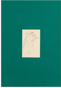
“490[888 curves][1879-82][page 3]”, 2018 graphite on paper, mounted to book cloth 73.5 x 50.8 cm CT/P 2018/03