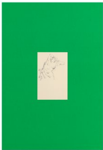
“598[620 curves][1883-86][page 4]”, 2018 graphite on paper, mounted to book cloth 73.5 x 50.8 cm CT/P 2018/04