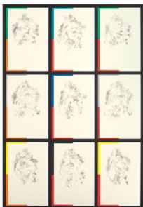
“Toolpaths for Bellona [page 119]”, 2018 graphite on paper, mounted to book cloth 73.5 x 50.8 cm CT/P 2018/15