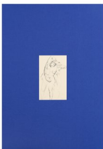
“489bis[1712 curves][1879-82][page 2]”, 2018 graphite on paper, mounted to book cloth 73.5 x 50.8 cm CT/P 2018/02