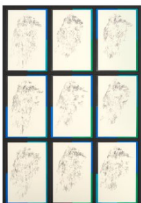
“Toolpaths for Bellona [page 11]”, 2018 graphite on paper, mounted to book cloth 73.5 x 50.8 cm CT/P 2018/11