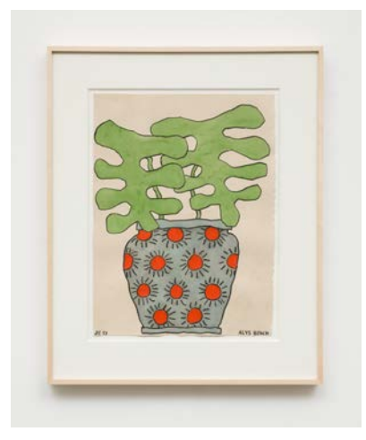
Alys Beach 2017