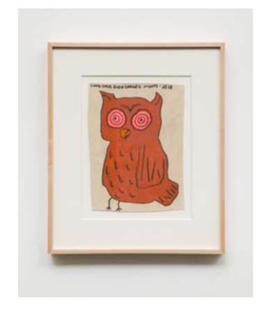
Long Days Even Longer Nights, Red Pink 2018