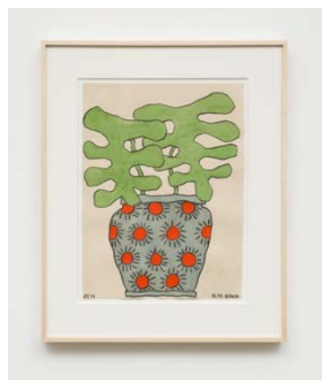
Alys Beach 2017