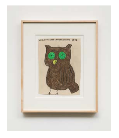
Long Days Even Longer Nights, Blue Green 2017