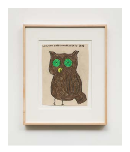
Long Days Even Longer Nights, Blue Green 2017