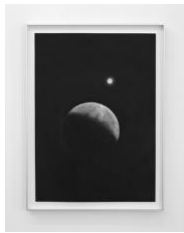
Juan Antonio Olivares Trappist 2 , 2019 Graphite on paper, framed 77.4 x 57 cm 30 1/2 x 22 1/2 in