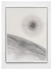
Juan Antonio Olivares untitled ( trappist scan 1 ), 2021 Graphite on paper 122 x 91 cm 48 1/8 x 35 7/8 in