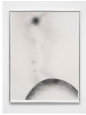
Juan Antonio Olivares untitled ( trappist scan 2 ), 2021 Graphite on paper 122 x 91 cm 48 1/8 x 35 7/8 in