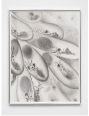
Juan Antonio Olivares untitled ( octopus eggs ), 2021 Graphite on paper 122 x 91 cm 48 1/8 x 35 7/8 in