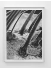
Juan Antonio Olivares Eyelashes , 2019 Graphite on paper, framed 77.4 x 57 cm 30 1/2 x 22 1/2 in