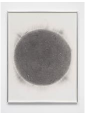
Juan Antonio Olivares untitled ( sun scan ), 2021 Graphite on paper 122 x 91 cm 48 1/8 x 35 7/8 in