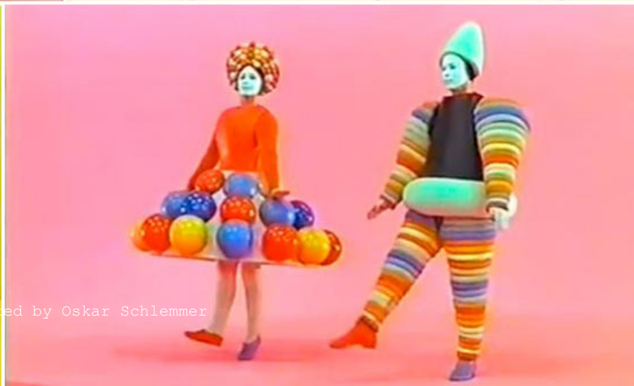
Still from "The Triadic Ballet", 1922, directed by Oskar Schlemmer