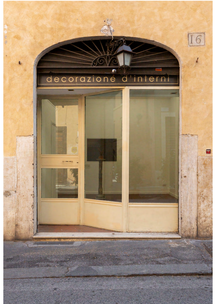
Darius Mikšys Empire Dissolves Into Its Subjects , 2021 Exhibition view, ERMES ERMES, Rome