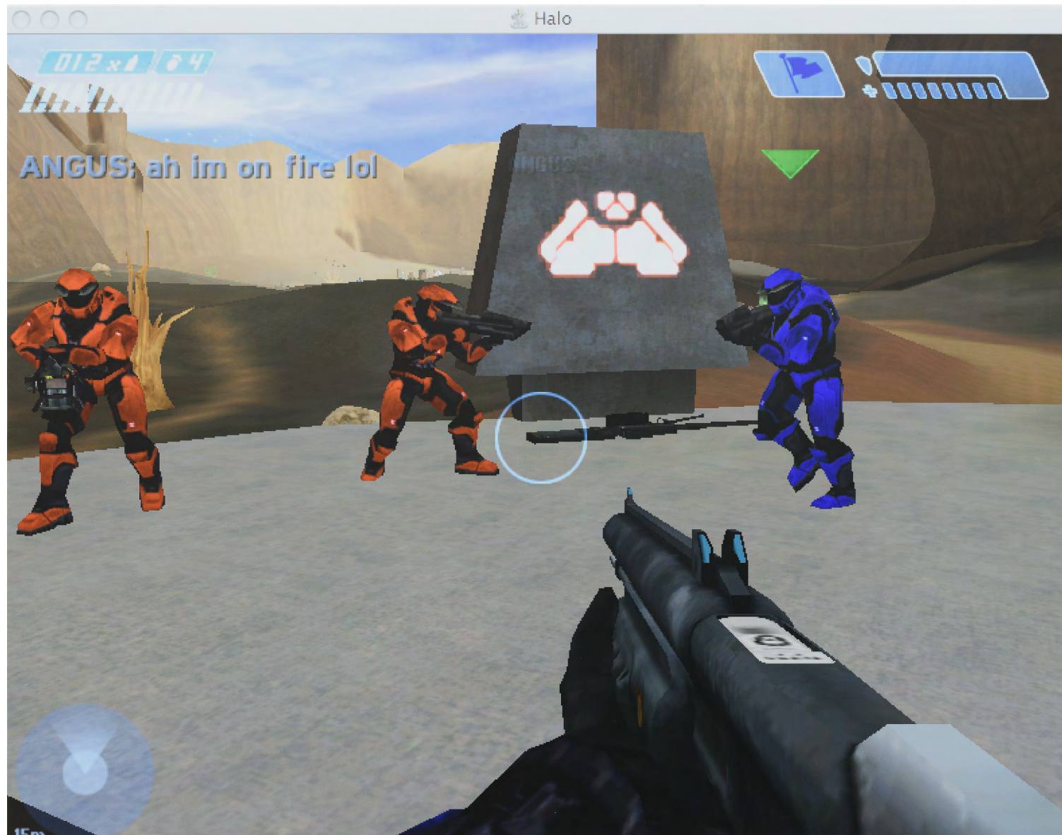
A Piece of a Peace, 2006. Halo online game performance documented with 28 Powerbook G4 screen prints. 18 images are organized into narratives numbering them from 001 to 0018. 10 images left as they were at the moment of performance. Images N. 003, 004, and 0017 represented in the show printed on ND Satin photo paper, laminated.