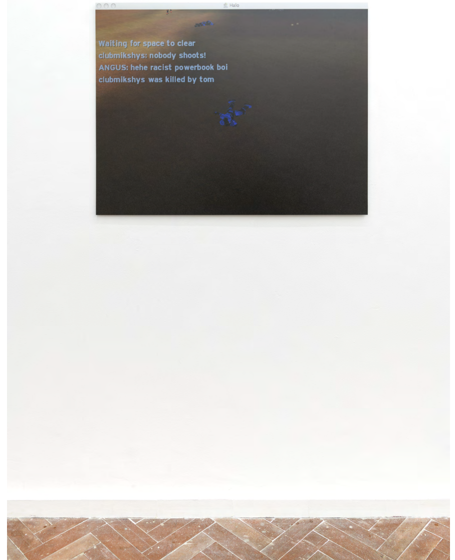
Darius Mikšys Empire Dissolves Into Its Subjects , 2021 Exhibition view, ERMES ERMES, Rome