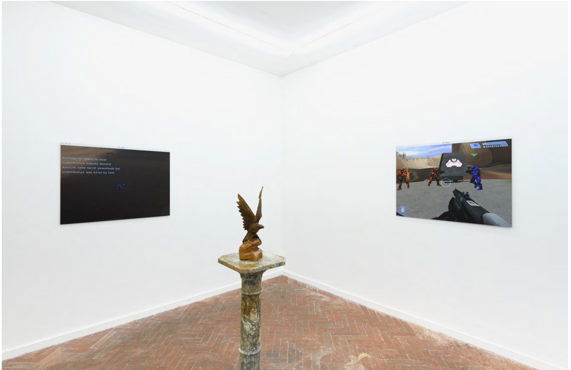
Darius Mikšys, Empire Dissolves Into Its Subjects , 2021, exhibition view, ERMES ERMES, Rome