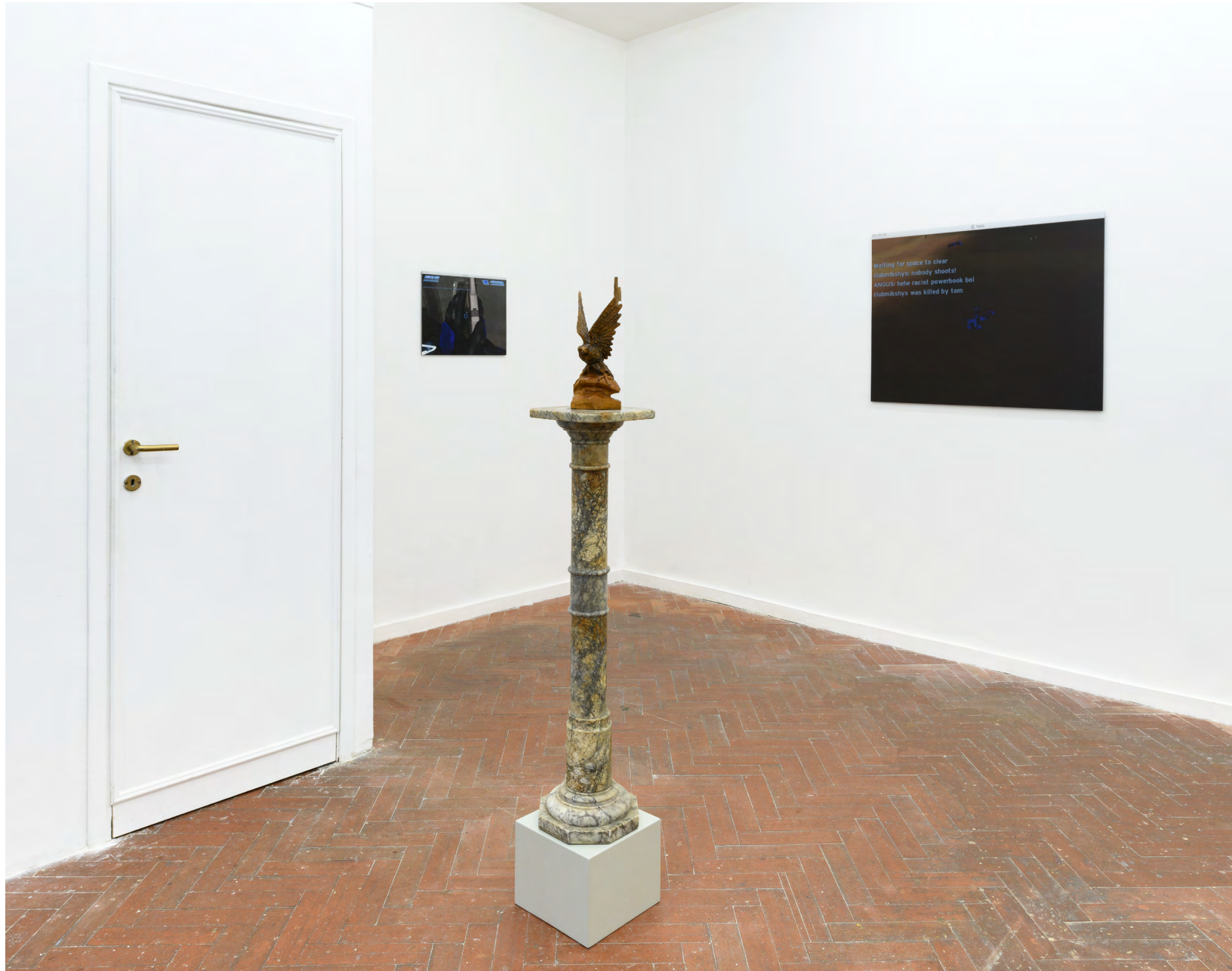
Darius Mikšys, Empire Dissolves Into Its Subjects , 2021, exhibition view, ERMES ERMES, Rome