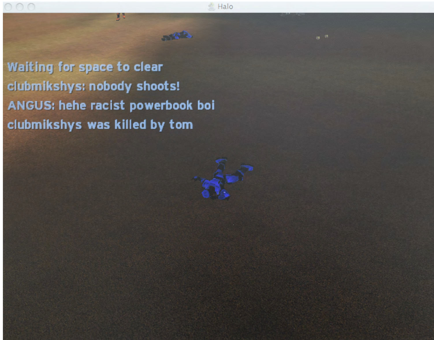
A Piece of a Peace, 2006. Halo online game performance documented with 28 Powerbook G4 screen prints. 18 images are organized into narratives numbering them from 001 to 0018. 10 images left as they were at the moment of performance. Images N. 003, 004, and 0017 represented in the show printed on ND Satin photo paper, laminated.