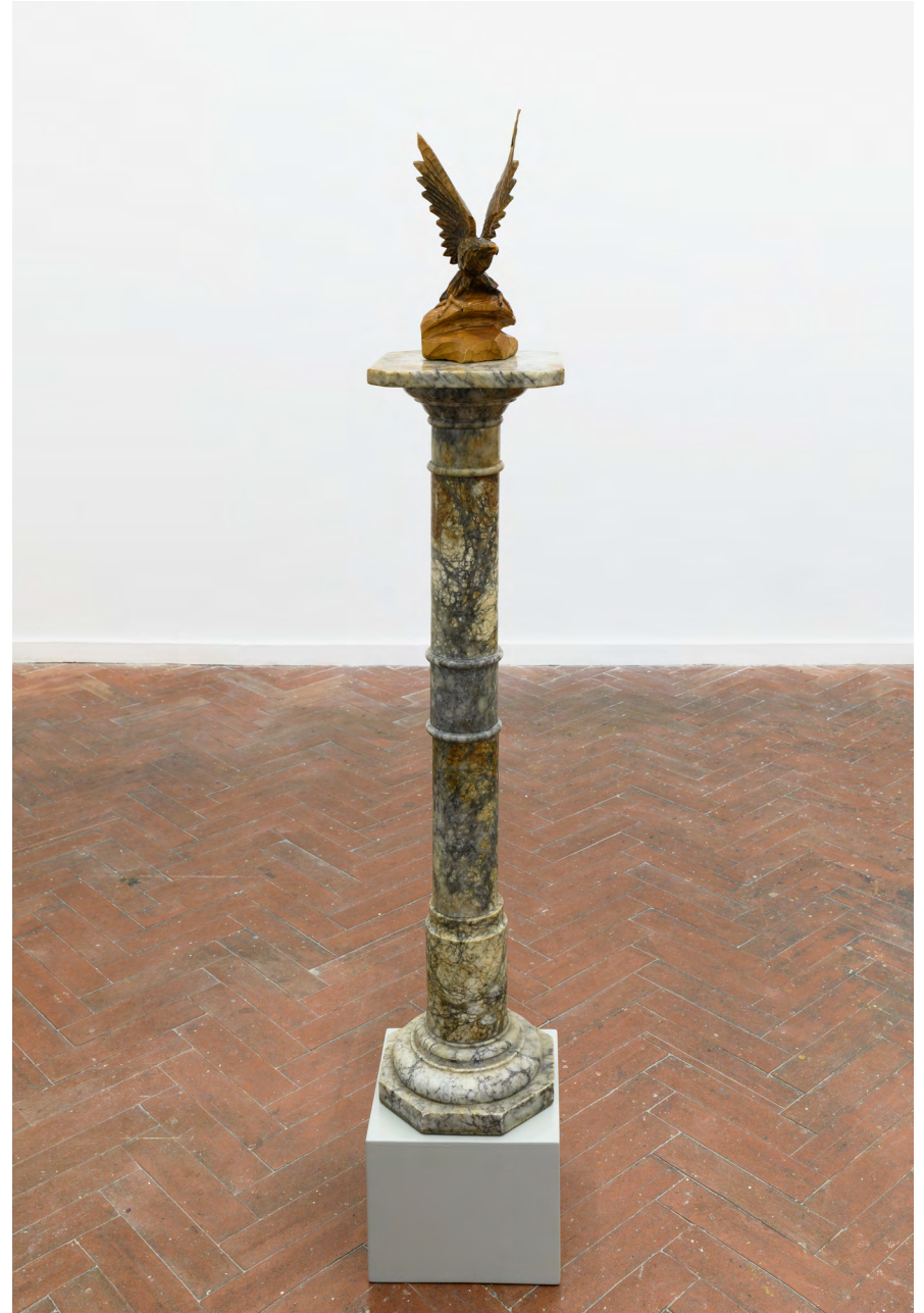
Darius Mikšys Empire Dissolves Into Its Subjects, 2021 Exhibition view, ERMES ERMES, Rome