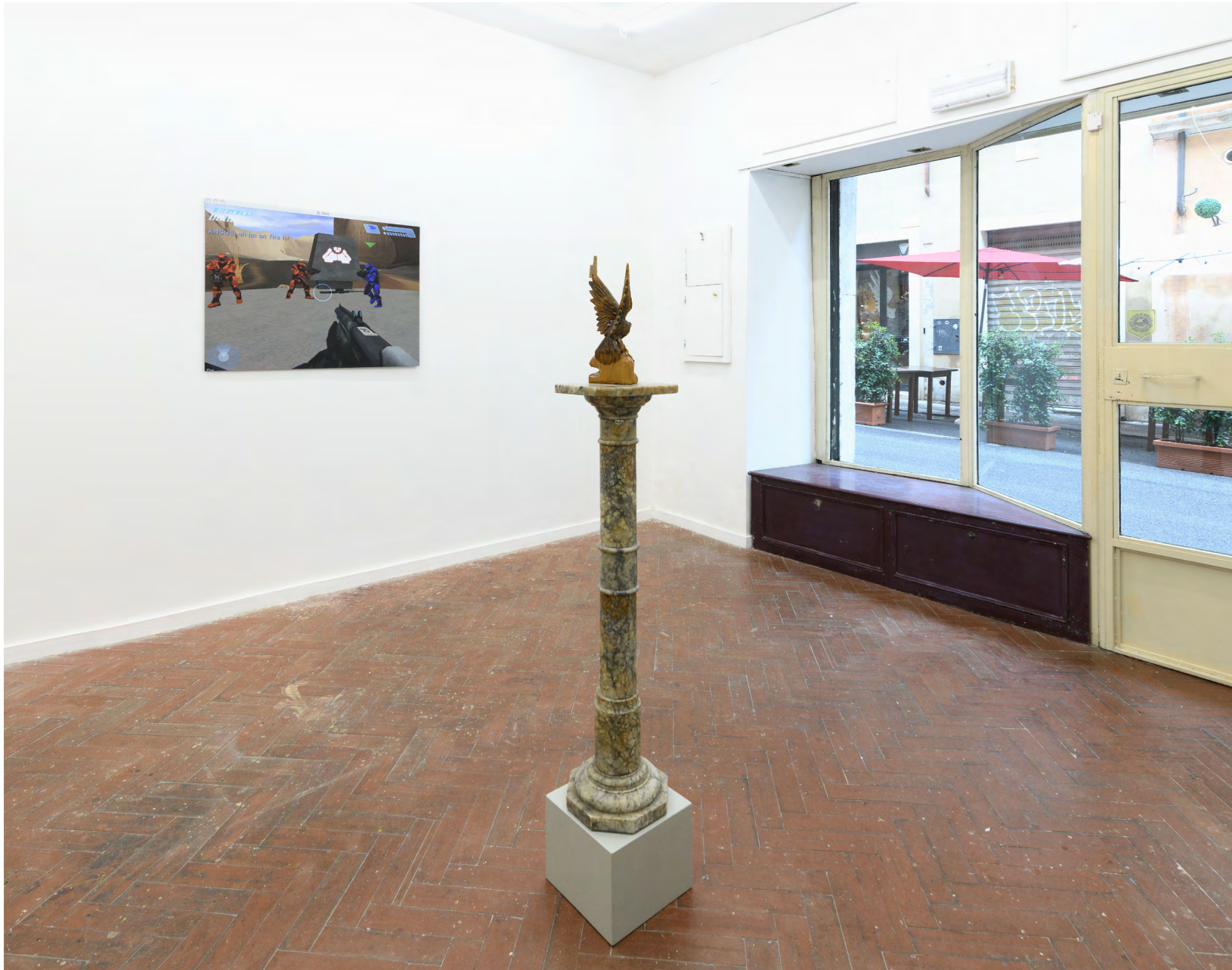
Darius Mikšys, Empire Dissolves Into Its Subjects , 2021, exhibition view, ERMES ERMES, Rome