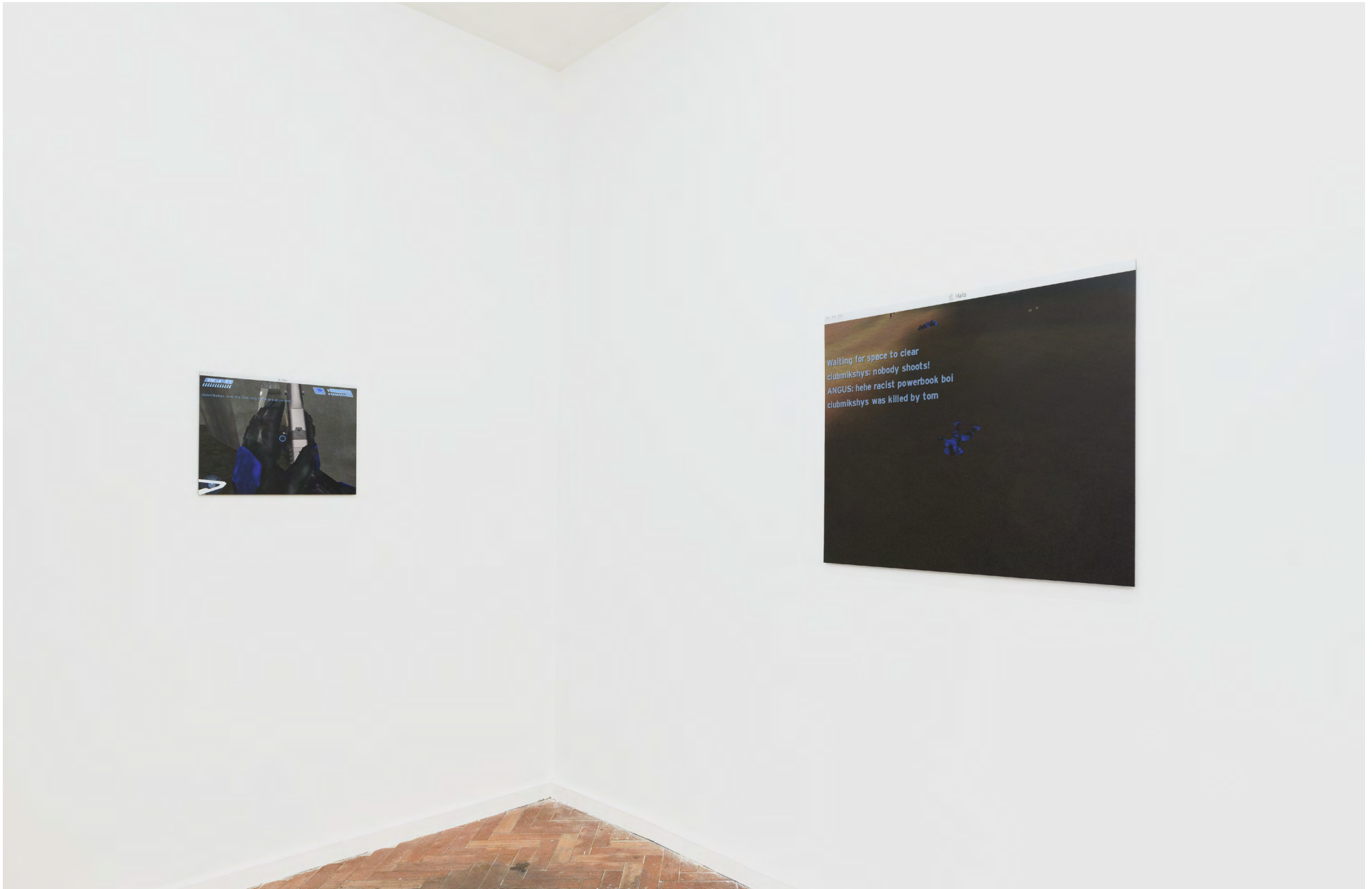
Darius Mikšys, Empire Dissolves Into Its Subjects , 2021, exhibition view, ERMES ERMES, Rome