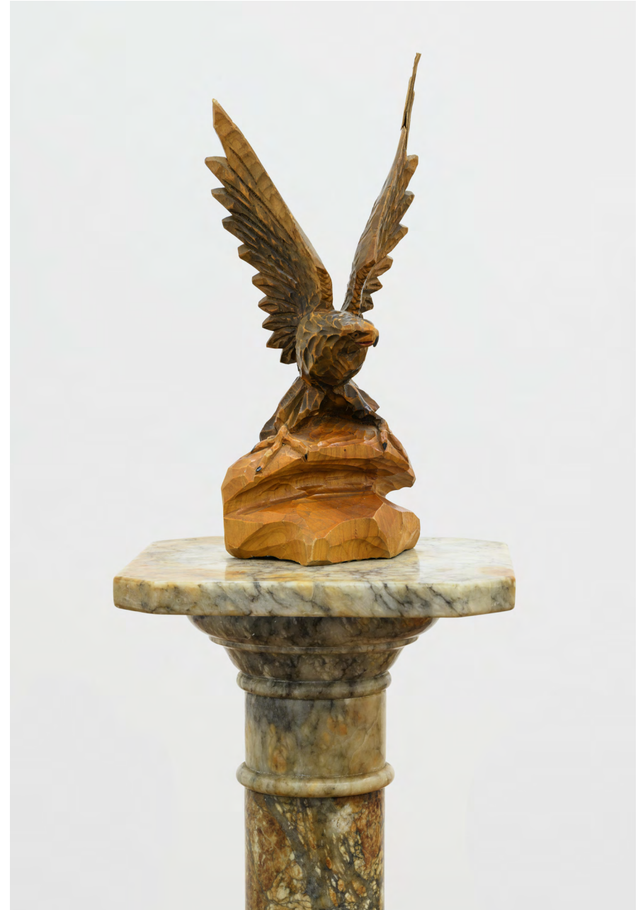
The Extension , 2018 Ready made and mass produced wooden sculpture Wood, glue, lacquer 31 cm