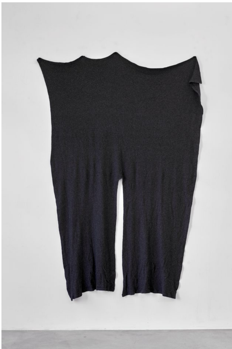
fig. 610 Simon Lässig Untitled, 2021 Wool ca. 200 × 140 cm (78.740 × 58.118 in)