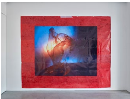
fig. 613 Vera Lutz Untitled, 2021 Digital print on paper, tape 260 × 330 cm (102.362 × 129.921 in)