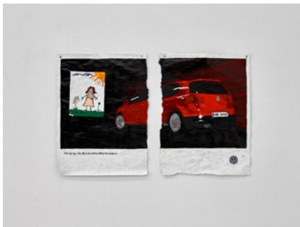
fig. 611 Milena Büsch Untitled, 2021 Oil on paper, 2 parts ca. 28,5 × 45 cm (11.220 × 17.717 in)