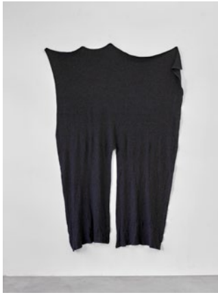
fig. 610 Simon Lässig Untitled, 2021 Wool ca. 200 × 140 cm (78.740 × 58.118 in)