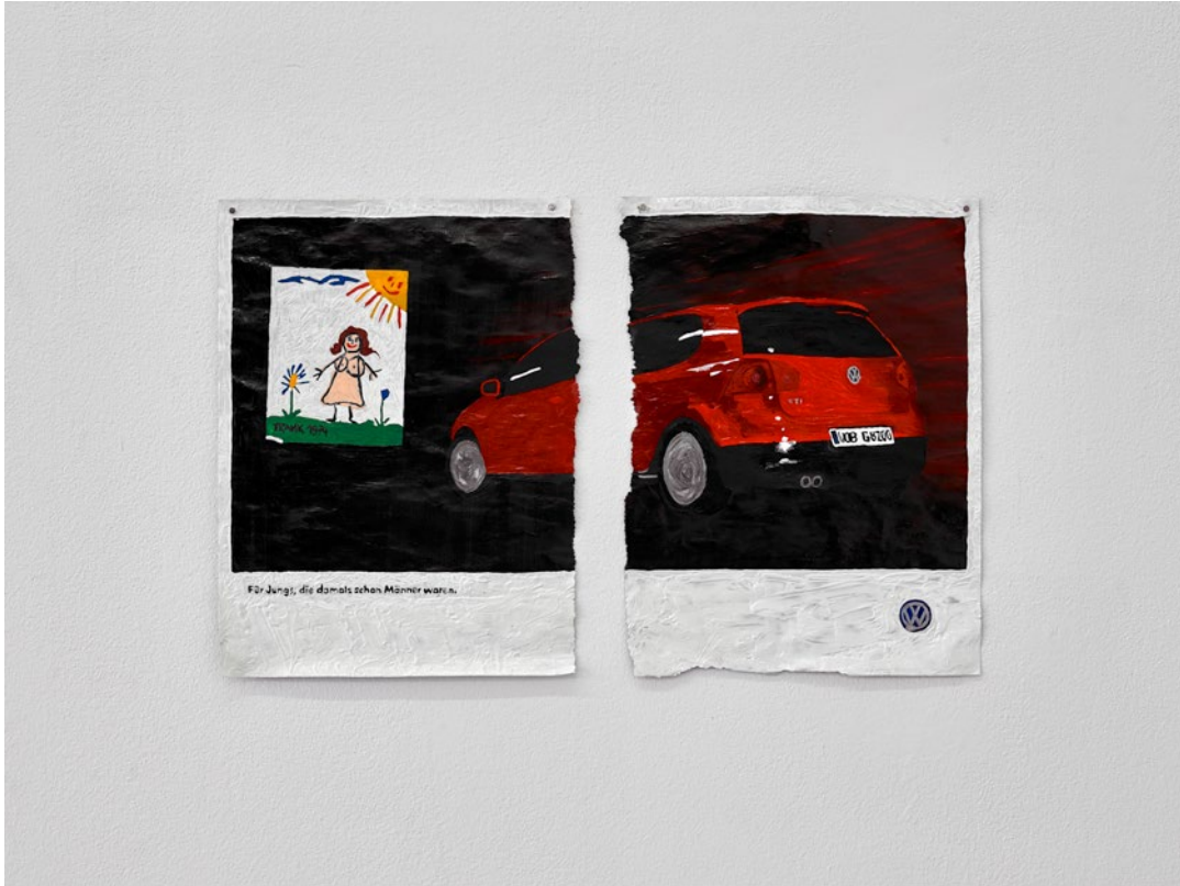
fig. 611 Milena Büsch Untitled , 2021 Oil on paper, 2 parts ca. 28,5 × 45 cm (11.220 × 17.717 in)