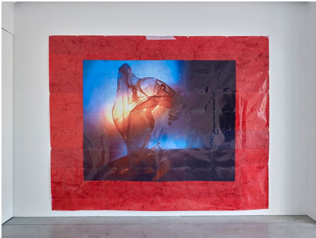
fig. 613 Vera Lutz Untitled, 2021 Digital print on paper, tape 260 × 330 cm (102.362 × 129.921 in)