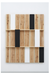
KS-S-20-15 菅木志雄 Kishio Suga 原帯 Fields and Zones 2020 wood, acrylic h.180.0 x w.144.3 x d.15.7 cm