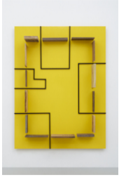
KS-S-20-16 菅木志雄 Kishio Suga 景潜果 Scene of Latent Effects 2020 wood, acrylic h.182.0 x w.136.5 x d.28.5 cm