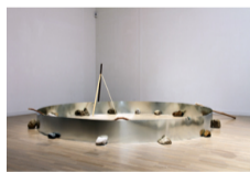
KS-S-85-08 菅木志雄 Kishio Suga 支空 Supporting a Void 1985/2020 galvanized iron plate, wood, stone, bamboo dimension variable (h.206.0 x 705.0 x 595.0 cm at The National Art Center. Tokyo)