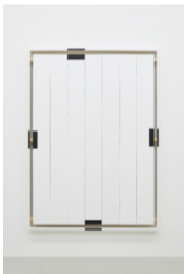
KS-S-18-31 菅木志雄 Kishio Suga 連依性 Continuous Dependency 2018 wood, acrylic h.186.8 x w.134.8 x d.9.5 cm