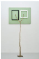
KS-S-19-01 菅木志雄 Kishio Suga 空越 Spatial Transcendence 2019 wood, acrylic, stone h.250.6 x w.125.4 x d.86.8 cm