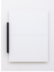
KS-S-21-01 菅木志雄 Kishio Suga 原支 Origin of Support 2021 wood, acrylic h.121.6 xw. 95.5 x d.11.0 cm