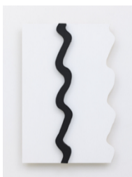
KS-S-20-30 菅木志雄 Kishio Suga 止曲 Halted Distortion 2020 wood, acrylic h.91.1 x w.62.0 x d.8.2 cm