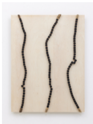
KS-S-21-04 菅木志雄 Kishio Suga 因景 Cause of Scenery 2021 wood, acrylic h.120.1 x w.91.1 x d.8.5 cm