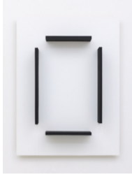
KS-S-21-02 菅木志雄 Kishio Suga 集素因 Accumulated Elemental Causes 2021 wood, acrylic h.122.0 xw. 91.1 x d.19.3 cm