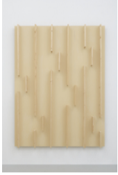
KS-S-20-17 菅木志雄 Kishio Suga 測空縁 Measured Spatial Edges 2020 wood, acrylic h.182.0 x w.136.5 x d.14.2 cm