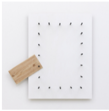
KS-S-20-21 菅木志雄 Kishio Suga 場集 Site of Accumulation 2020 wood, acrylic h.120.3 x w.118.6 x d.22.2 cm