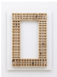
KS-S-20-28 菅木志雄 Kishio Suga 依空性 Dependency of Void 2020 wood, acrylic h.119.5 x w.90.0 x d.21.4 cm