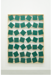
KS-S-18-29 菅木志雄 Kishio Suga 通揺 Passage of Oscillation 2018 wood, acrylic h.187.0 x w.140.1 x d.11.9 cm