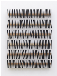
KS-S-20-26 菅木志雄 Kishio Suga 場潜 Site of Latency 2020 wood, acrylic h.123.0 x w.92.4 x d.10.7 cm