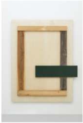
KS-S-18-30 菅木志雄 Kishio Suga 因潜化 Causal Latency in Formation 2018 wood, acrylic h.182.0 x w.146.4 x d.9.7 cm