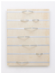
KS-S-21-03 菅木志雄 Kishio Suga 空傾 Voids of Inclination 2021 wood, aluminum, ink h.121.9 x w. 91.1 x d.17.3 cm