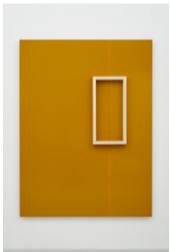
KS-S-18-37 菅木志雄 Kishio Suga 超向 Beyond Orientation 2018 wood, acrylic, ink h.180.0 x w.135.1 x d.11.7 cm