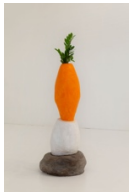
Vase (Orange, White and Black) , 2021. Papier-mâché and plants, 118×46 ø cm (sizes without the plants). Courtesy of the artist, APALAZZO Gallery, Brescia (Italy) and Emalin, London. Photo: Eyal Agivayev.