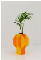
Vase (Orange and Yellow) , 2021. Plexiglass and plants, 70×50×50 cm (sizes without the plants). Courtesy of the artist, APALAZZO Gallery, Brescia (Italy) and Emalin, London. Photo: Eyal Agivayev.