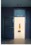
"Augustas Serapinas: Diana," 2021. View of the exhibition at CCA – Center for Contemporary Art Tel Aviv.