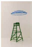
Chair for the Invigilator (Green) , 2021. Mixed media, 296×160×160 cm. Courtesy of the artist, APALAZZO Gallery, Brescia (Italy) and Emalin, London. Photo: Eyal Agivayev.