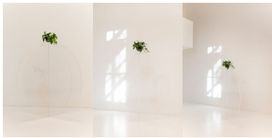
Vase (Transparent) , 2021. Plexiglass and plants, 191×200×200 cm (sizes without the plants). Courtesy of the artist, APALAZZO Gallery, Brescia (Italy) and Emalin, London. Photo: Eyal Agivayev.