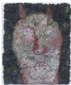
Nicole Eisenman Devil , 2007 Skum og olje på plate Foam and oil on board 124 x 104 x 10 cm

Beth Rudin DeWoodys samling Collection of Beth Rudin DeWoody