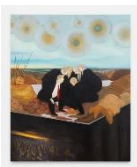
Nicole Eisenman Huddle , 2018 Olje på lerret Oil on canvas 323 x 266 cm