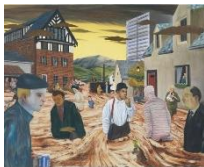
Nicole Eisenman Coping , 2008 Olje på lerret Oil on canvas 165 x 208 cm