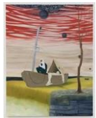
Nicole Eisenman T.B.T. (Headed Down River...) , 2018 Olje og collage på lerret Oil and collage on canvas 208 x 165 cm

Aishti Foundation-samlingen, Beirut, Libanon Collection of Aishti Foundation, Beirut, Lebanon