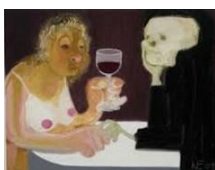
Nicole Eisenman Death and the Maiden , 2009 Olje på lerret Oil on canvas 37 x 46 cm