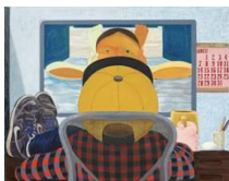
Nicole Eisenman Long Distance , 2015 Olje på lerret Oil on canvas 165 x 208 cm