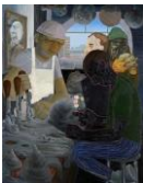
Nicole Eisenman Achilles Heel , 2014 Olje på lerret Oil on canvas 208 x 166 cm