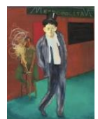
Nicole Eisenman The Fag End II , 2009 Olje på lerret Oil on canvas 46 x 37 cm