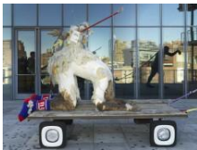
Nicole Eisenman Museum Piece con Gas , 2019 Gips, ull, bivoks, epoxy, harpiks, røykmaskin og blandet teknikk Plaster, wool, beeswax, epoxy, resin, fog machine and mixed media 243 x 304 x 182 cm