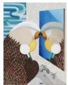
Nicole Eisenman Morning Affirmations , 2018 Olje på lin Oil on linen 142 x 109 cm

Nachson Mimrans samling Nachson Mimran Collection