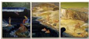
Nicole Eisenman Team Shredder , 2006 Olje på panel Oil on panel 124 x 100 cm

Jeffrey Bhaskers samling Collection of Jeffrey Bhasker