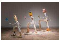
Nicole Eisenman Three Walkers , 2019 Sement, gips, epoxy harpiks, uretanharpiks, vannharpiks, MSA-lakk, trelakk, menneskehår, voks, papirmasse, jøggesko, fluesmekker, akryl, glassfiber, mahogny, kryssfinér, mais, pigmenter, lær, bomullstrøye, jute, isopor og polymerleire

Courtesy of the artist, Vielmetter Los Angeles and Anton Kern Gallery, New York Med tillatelse fra kunstneren, Vielmetter Los Angeles og Anton Kern Gallery, New York