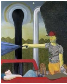
Nicole Eisenman Dark Light , 2017 Olje på lerret Oil on canvas 325 x 264 cm