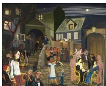
Nicole Eisenman Beasley Street , 2007 Olje på lerret Oil on canvas 165 x 208 cm

Ringier-samlingen, Sveits Ringier Collection, Switzerland