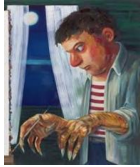
Nicole Eisenman Were-Artist , 2007 Olje på lerret Oil on canvas 155 x 127 cm