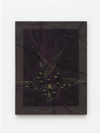
Leda Bourgogne, Seraphim , 2020 Sewing thread, silicon, transparent varnish on mesh, 51 x 39 x 2 cm