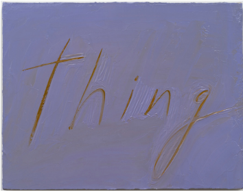
Mira Schor, Purple Thing, NY #12 , 2014 Oil on linen, 35.6 x 45.7 cm