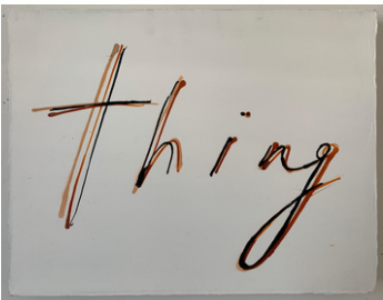
Mira Schor, Thing , 2017 Oil on linen, 14 x 18 in / 35.6 x 45.7 cm