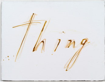
Mira Schor, Thing #8 , 2014 Oil on linen, 35.6 x 45.7 cm