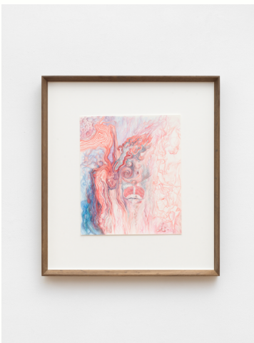
Leda Bourgogne, Who by fire , 2020 Colored pencil on paper 30 x 25,5 cm, sheet size / 50 x 44,5 x 4 cm, framed