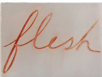
Mira Schor, Flesh , 2015 Oil on linen, 12 x 16 inches / 30.5 x 40.6 cm