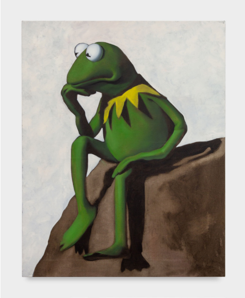
Melancholia 2021 40" H x 32" W Oil on linen