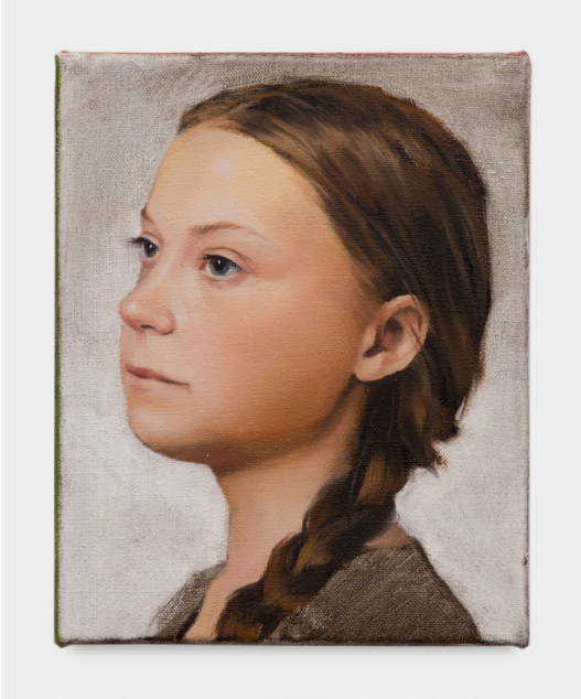
Greta 2021 10" H x 8" W Oil on linen