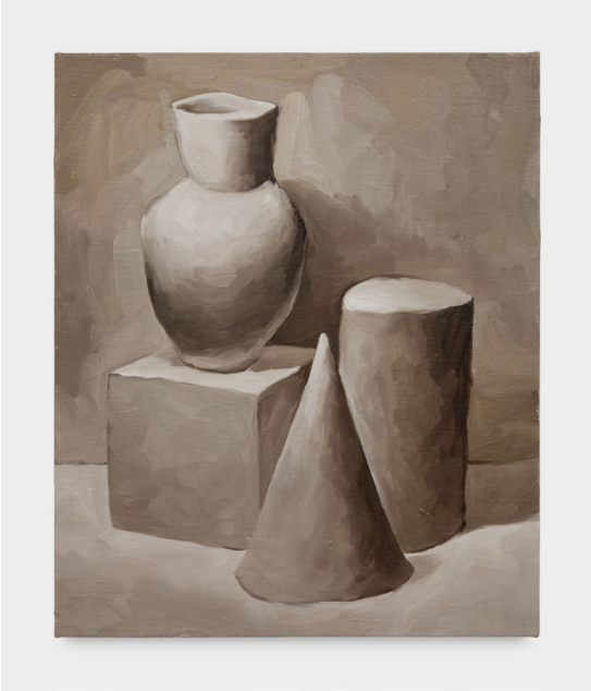
Left-Hand Painting Exercise