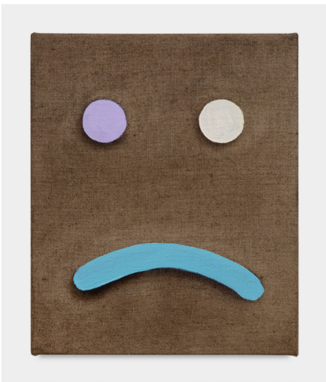
Feeling Study 5 (Blue)