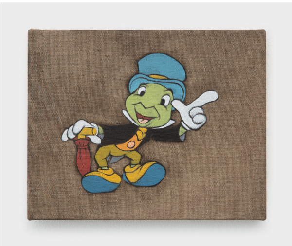
Painting in Good Conscience 2021 8" H x 10" W Oil on linen