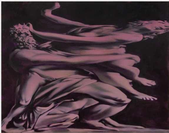
Purple Painting 2021 38" H x 48" W Oil on linen