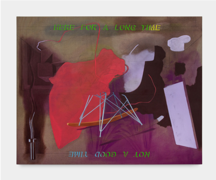
Here for a Long Time