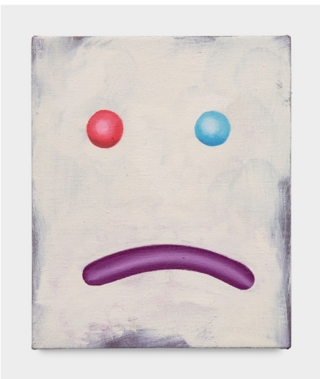
Feeling Study 1 (Birthday)