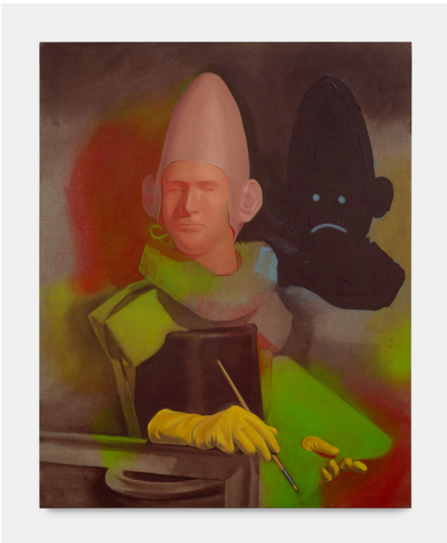
Shadow Self 2021 40" H x 32" W Oil on linen