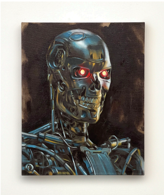
Terminator 2021 20" H x 16" W Oil on canvas