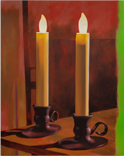
Against Nature 2021 50" H x 40" W Oil on linen