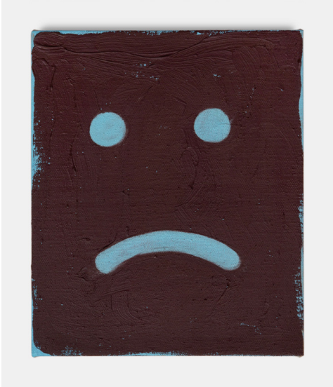
Feeling Study 2 (Lexapro)