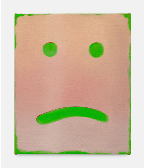
Feeling Study 4 (Zorn Palette)