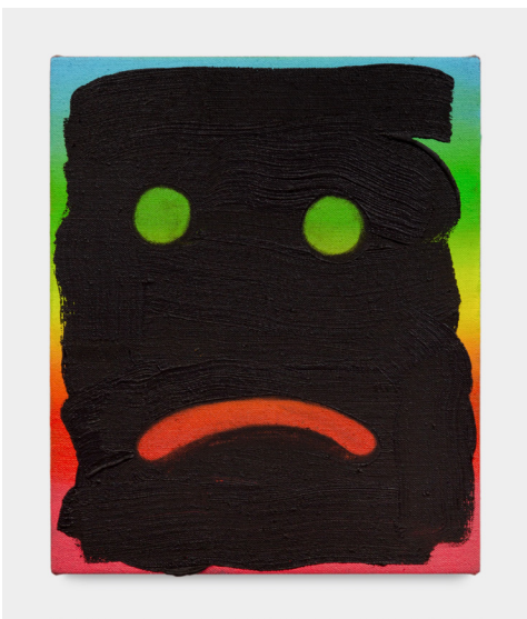
Feeling Study 3 (Sunrise)