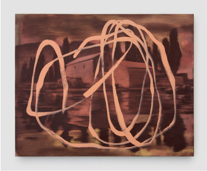
Happy Place 2021 24" H x 30" W Oil on linen