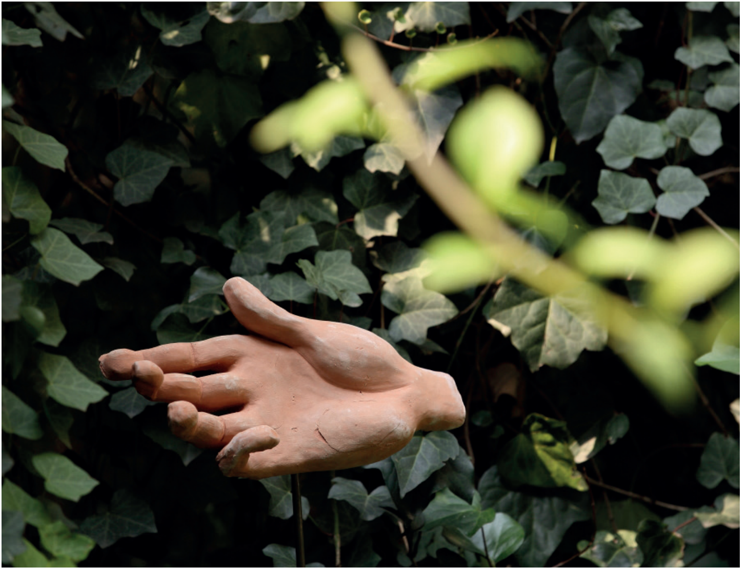
Jorge Satorre, Formal Encuentro in the Garden (detail), 2016. Fired clay.