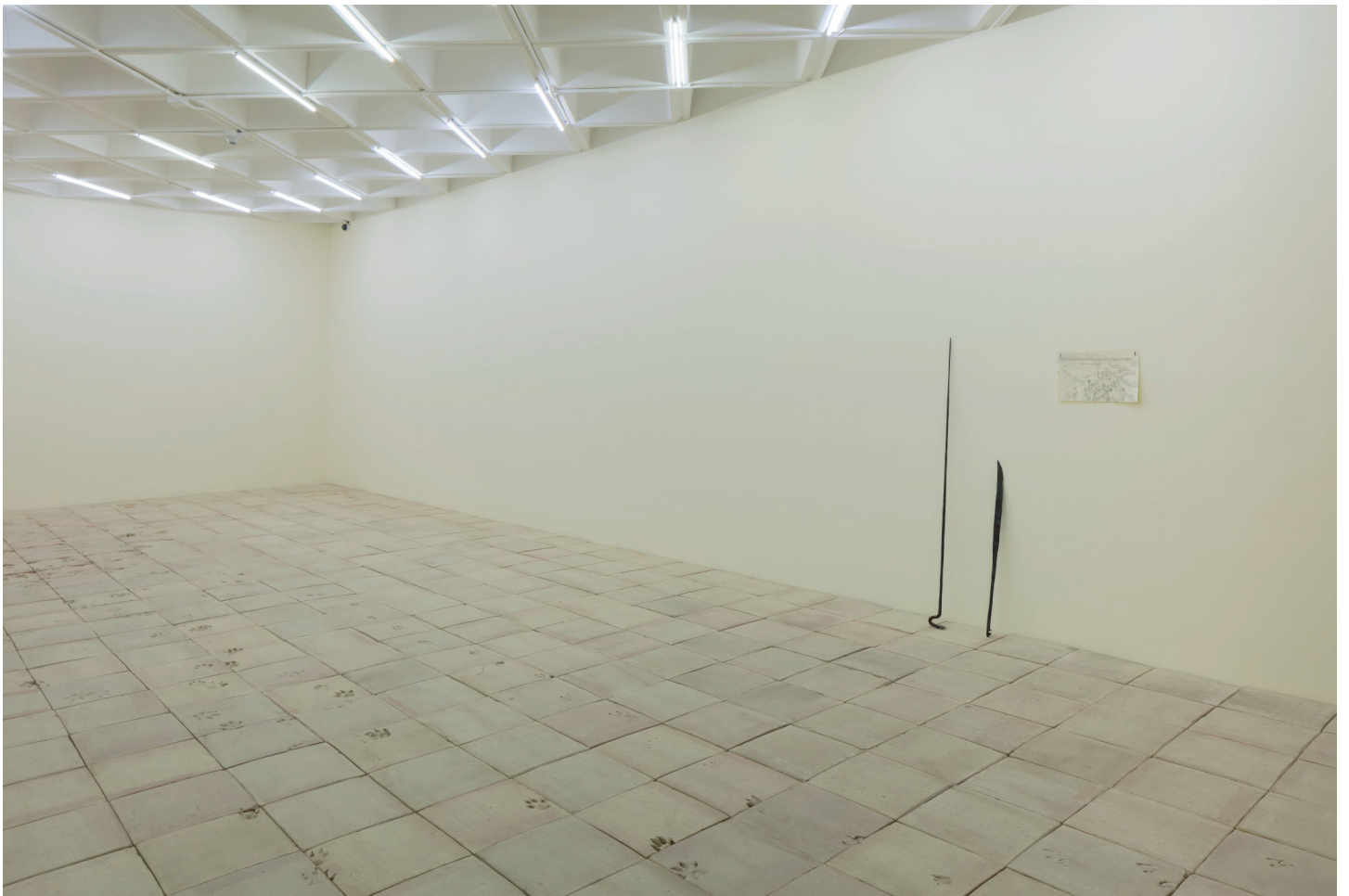
Jorge Satorre, The Dead Animal , 2017. Installation view, Museo Tamayo.