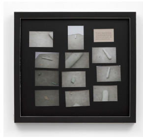
Brad Kronz The new rockstar for sane people , 2021 Mat Board, photos, brass fasteners 70 x 78 x 6 cm