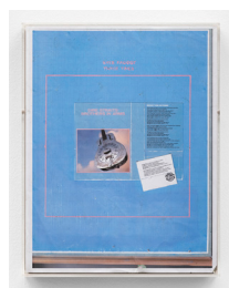
Brad Kronz Brothers in Arms II , 2021 Xerox, acrylic glass, chipboard, contact paper 29 x 22,5 x 3 cm