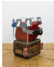
Brad Kronz Treated Very Unfairly , 2021 Acrylic glass, fabric, Plastic, ribbon, stuffing, wire, wood, brackets, screws 28 x 25 x 25 cm