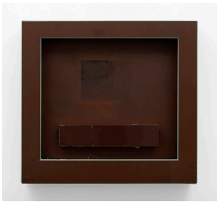
Brad Kronz The corner , 2021 Acrylic paint, chipboard, insulation foam, aluminum box, brass fasteners, zip ties 90 x 97 x 14 cm