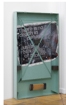
Brad Kronz Death in Nature , 2021 Acrylic glass, acrylic on canvas, chipboard, wood, felt, brass fasteners 106 x 60 x 9,5 cm