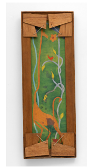
Brad Kronz Giraffe , 2021 Oil on canvas, wood, string, sinkers 102 x 37 x 4 cm