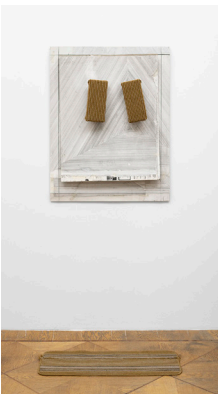
Brad Kronz Bumper , 2021 Pencil on paper, carpet, wood, masking tape 100 x 78 x 13 cm 80 x 31,5 cm