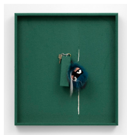
Brad Kronz Key Deposit Saga , 2021 Key, keychain, felted paper, marker, wood 80 x 74 x 7 cm