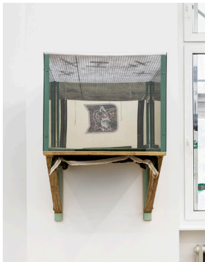
Brad Kronz Big Box , 2021 Acrylic glass, decal, wood, string, fabric, chipboard, felt 120 x 83 x 83 cm