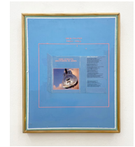
Brad Kronz Brothers in Arms III , 2021 Acrylic paint, chipboard, photo collage, wooden stretcher bars 29 x 22,5 x 3 cm