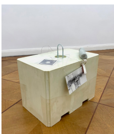
Brad Kronz A Platform , 2021 Plaster, shellac, custom keychain, graphite on paper, photo collage, steel hardware 40 x 56,5 x 36,5 cm