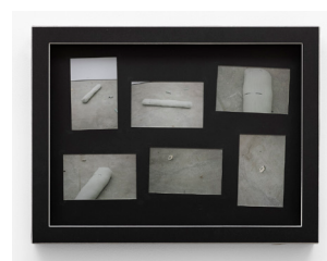
Brad Kronz The new rockstar for sane people II , 2021 Mat Board, photos, brass fasteners 55 x 42,5 x 5 cm