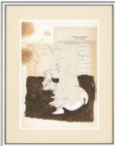
Lukas Duwenhögger "Tainted Love", 1982 collage on paper in artist's frame 58 x 45,5 cm LD/P 1982/02