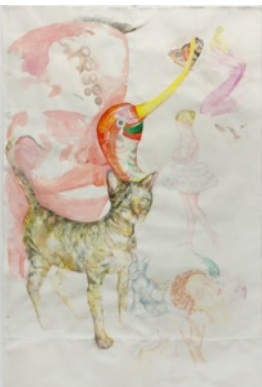
Katharina Wulff "Einige Geschöpfe", 2021 coloured pencil and gouache on paper 210 x 139 cm KW/P 2021/03