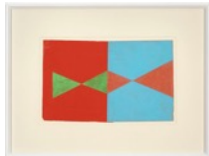
Lukas Duwenhögger "Diamond Shapes in Advance", 1977 gouache and oil pastel on paper in artist's frame 56 x 73,5 cm LD/P 1977/02