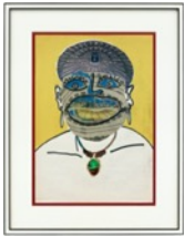
Lukas Duwenhögger "The Empress", 1979 collage and lacquer on paper in artist's frame 57,5 x 45 cm LD/C 1979/01