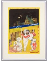
Lukas Duwenhögger "A Controversial Bus Ride", 1979 collage and lacquer on paper in artist's frame 58 x 44 cm LD/C 1982/06