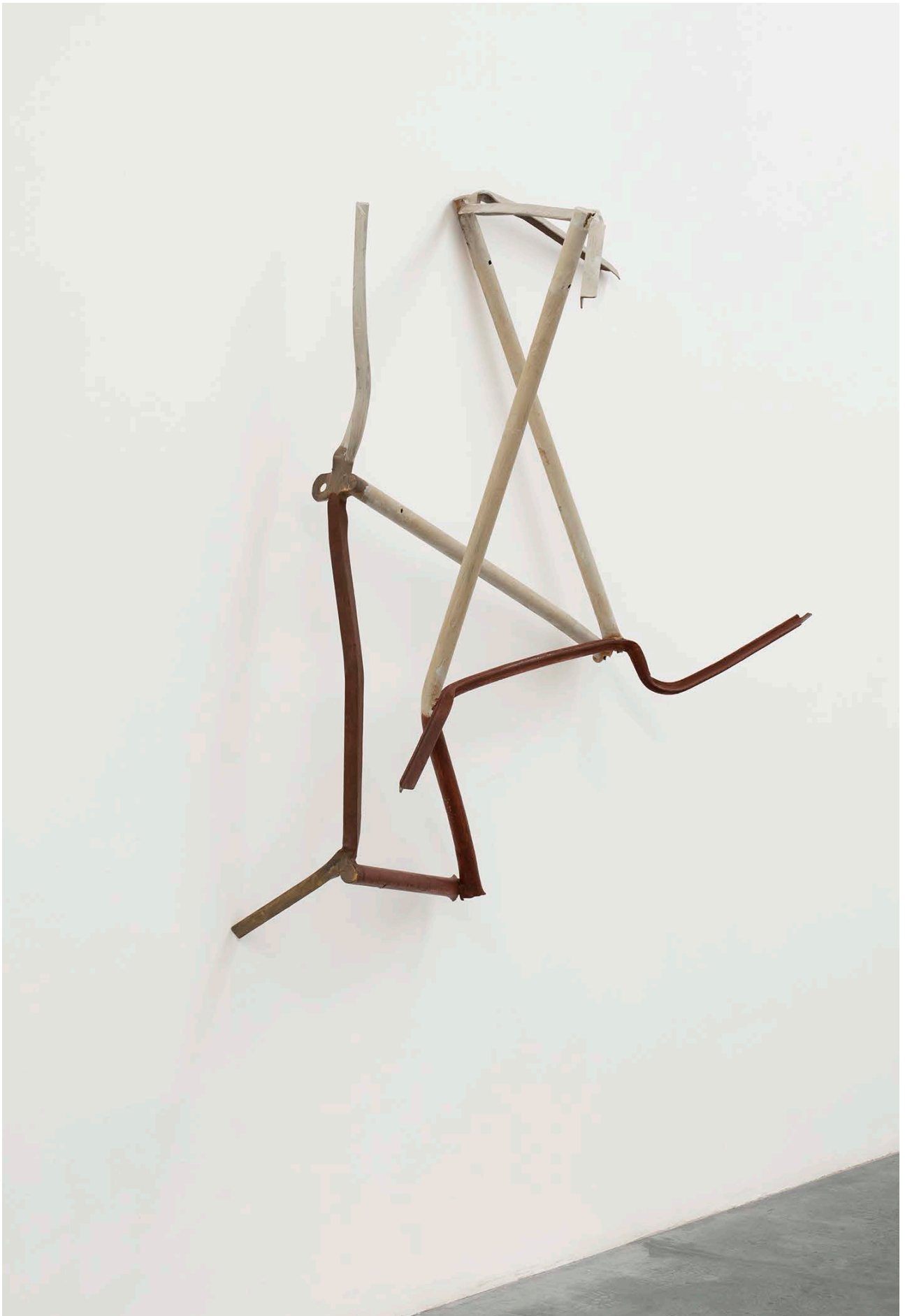
Untitled 2020 Steel and oil paint 135 x 140 x 72 cm | 53 1/4 x 55 x 28 1/3 in