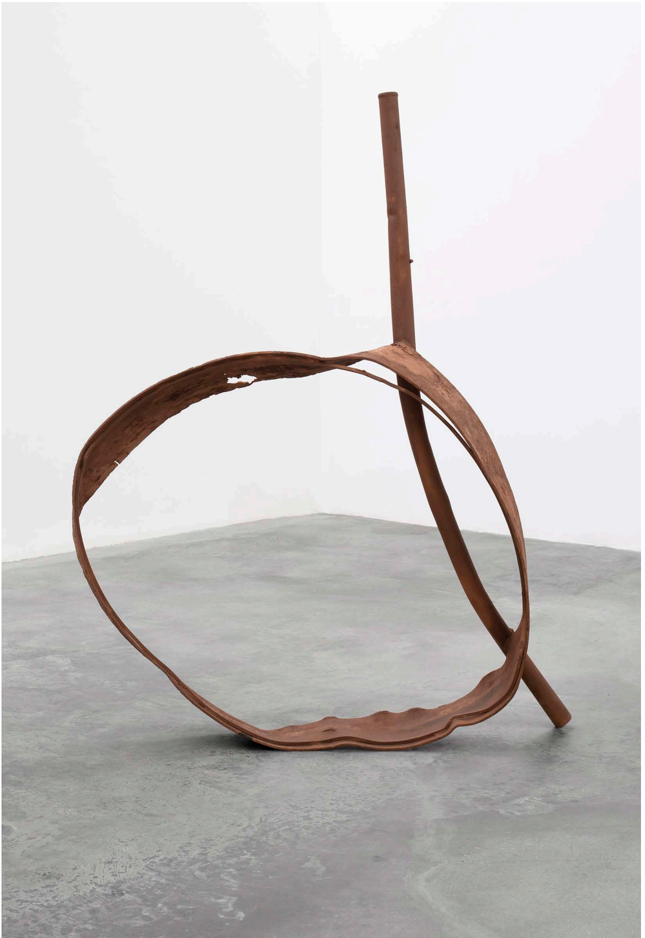
Pi mal Daumen (Rule of thumb) (A ojo de buen cubero) 2020 Steel and oil paint 191 x 150 x 50 cm | 75 1/4 x 59 x 19 2/3 in