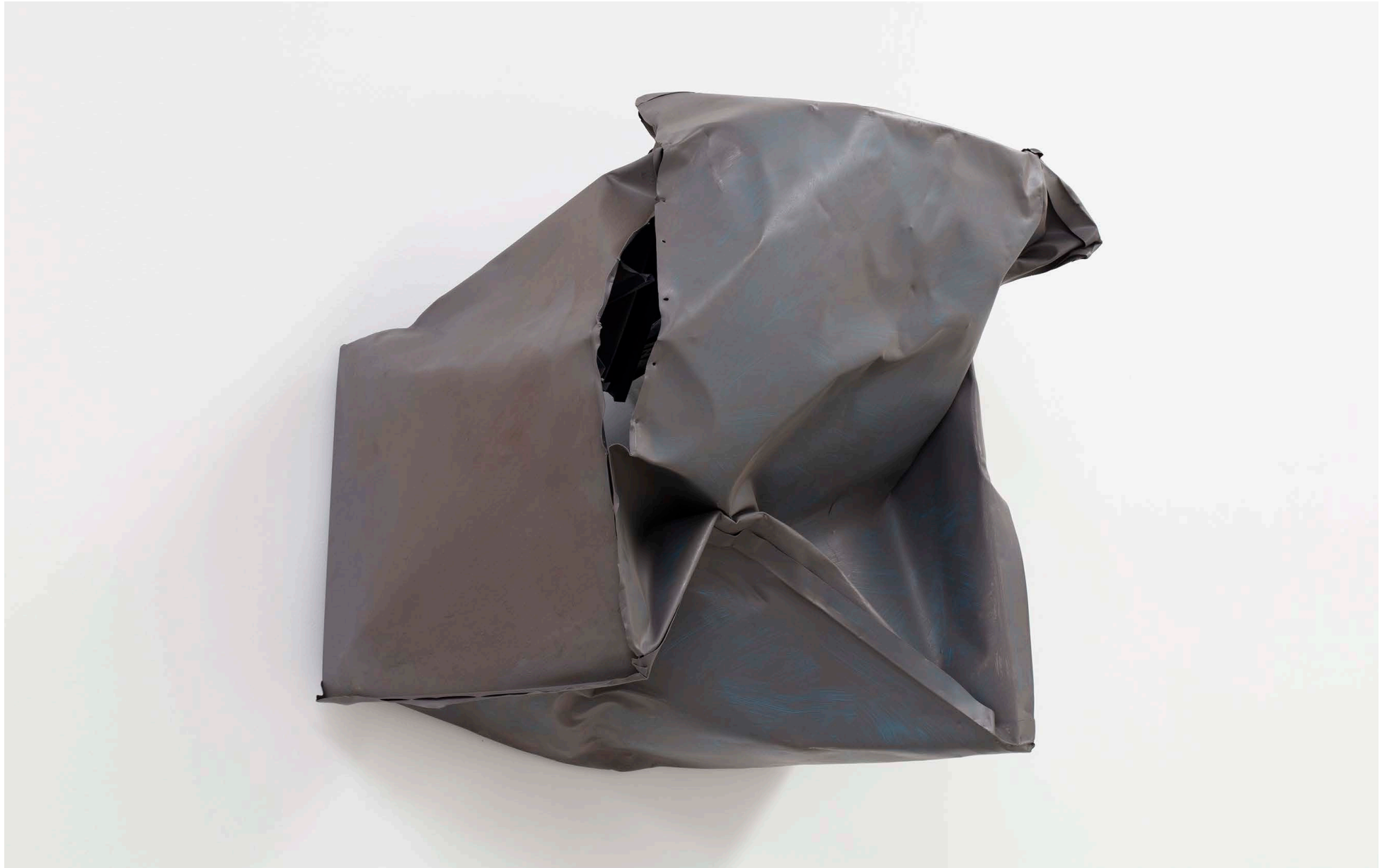
Untitled 2020 Steel and oil paint 100 x 110 x 58 cm | 39 1/3 x 43 1/3 x 22 3/4 in