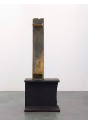
Untitled 2020 Steel and oil paint 160 x 58 x 40 cm | 63 x 22 3/4 x 15 3/4 in ME/S 32