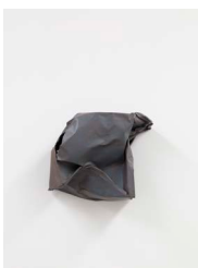
Untitled 2020 Steel and oil paint 100 x 110 x 58 cm | 39 1/3 x 43 1/3 x 22 3/4 in ME/WO 77