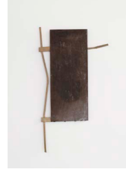
Untitled 2020 Steel and oil paint 110 x 62 x 12 cm | 43 1/3 x 24 1/2 x 4 3/4 in ME/WO 82