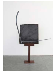
Manneken Pis (Little Pissing Man) (Hombrecito que orina) 2021 Steel and oil paint 118 x 145 x 65 cm | 46 1/2 x 57 x 25 2/3 in ME/S 30