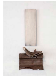
Untitled 2020 Steel and oil paint 40 x 42 x 19 cm + 62 x 20 x 3 cm ME/WO 84