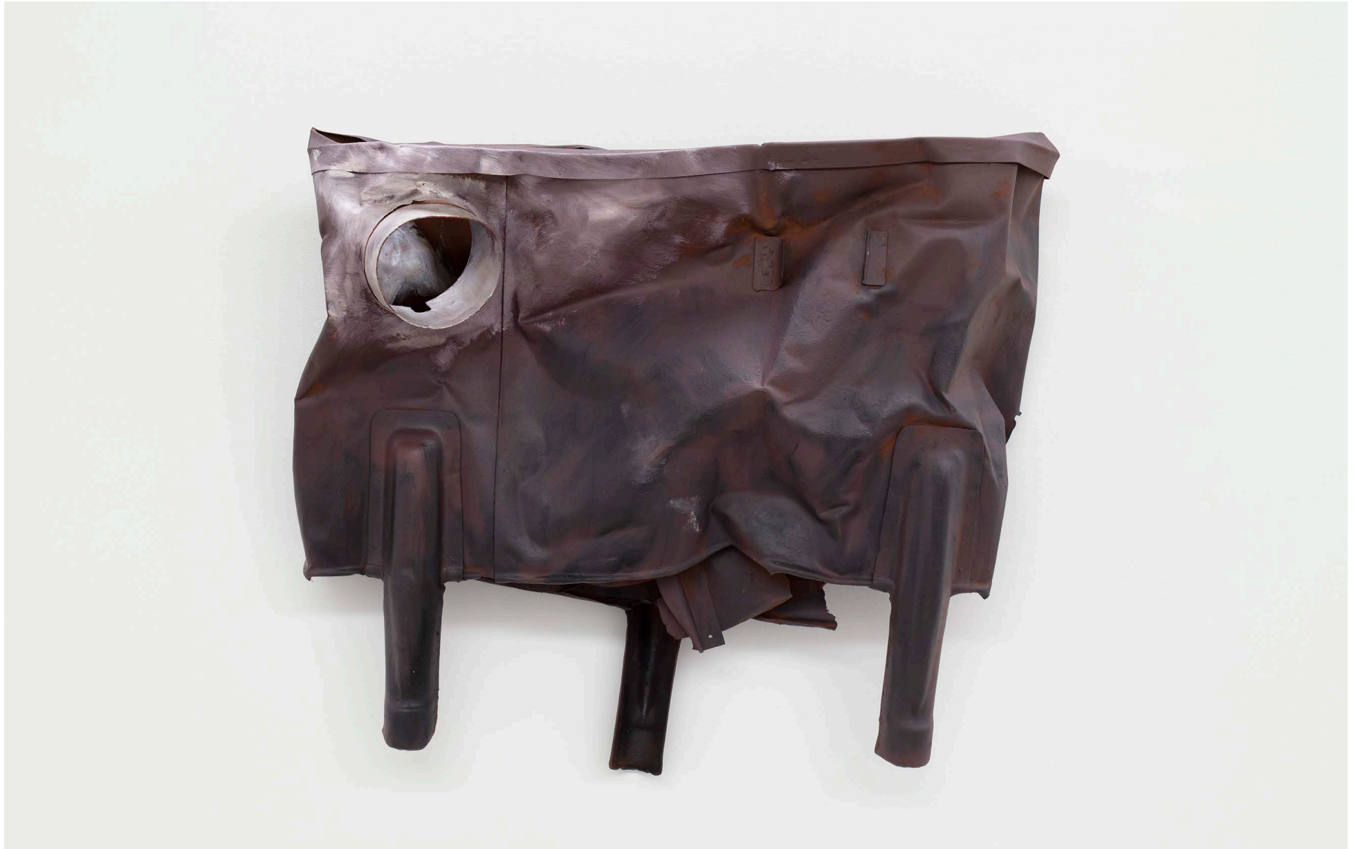
Untitled 2020 Steel and oil paint 75 x 80 x 27 cm | 29 1/2 x 31 1/2 x 10 2/3 in