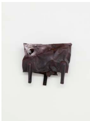
Untitled 2020 Steel and oil paint 75 x 80 x 27 cm | 29 1/2 x 31 1/2 x 10 2/3 in ME/WO 76