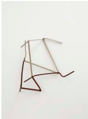
Untitled 2020 Steel and oil paint 135 x 140 x 72 cm | 53 1/4 x 55 x 28 1/3 in ME/WO 78