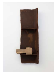
Untitled 2020 Steel and oil paint 105 x 34 x 21 cm | 41 1/3 x 13 1/2 x 8 1/4 in ME/WO 83