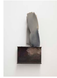
Untitled 2020 Steel and oil paint 92 x 44 x 32 cm | 36 1/4 x 17 1/3 x 12 2/3 in ME/WO 81