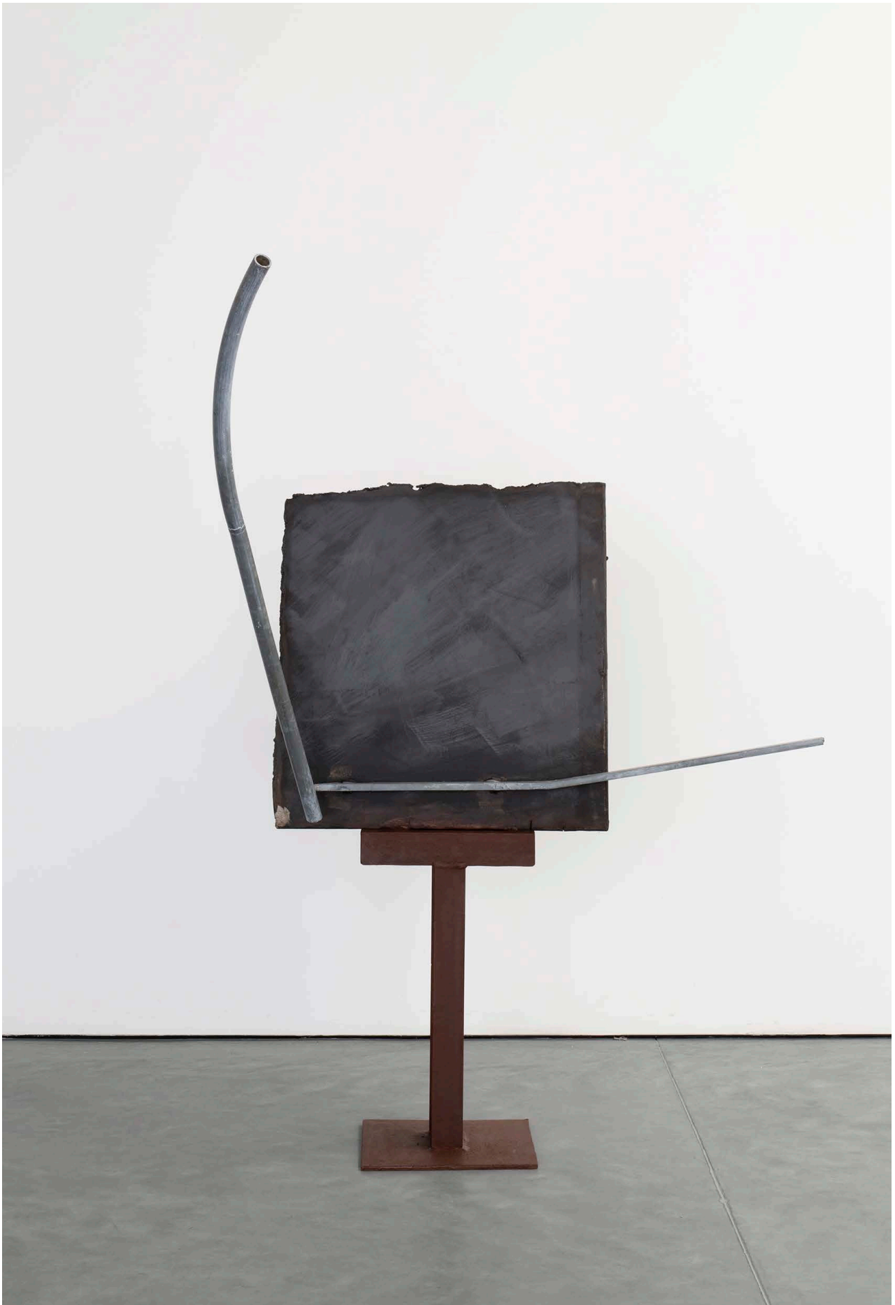
Manneken Pis (Little Pissing Man) (Hombrecito que orina) 2021 Steel and oil paint 118 x 145 x 65 cm | 46 1/2 x 57 x 25 2/3 in