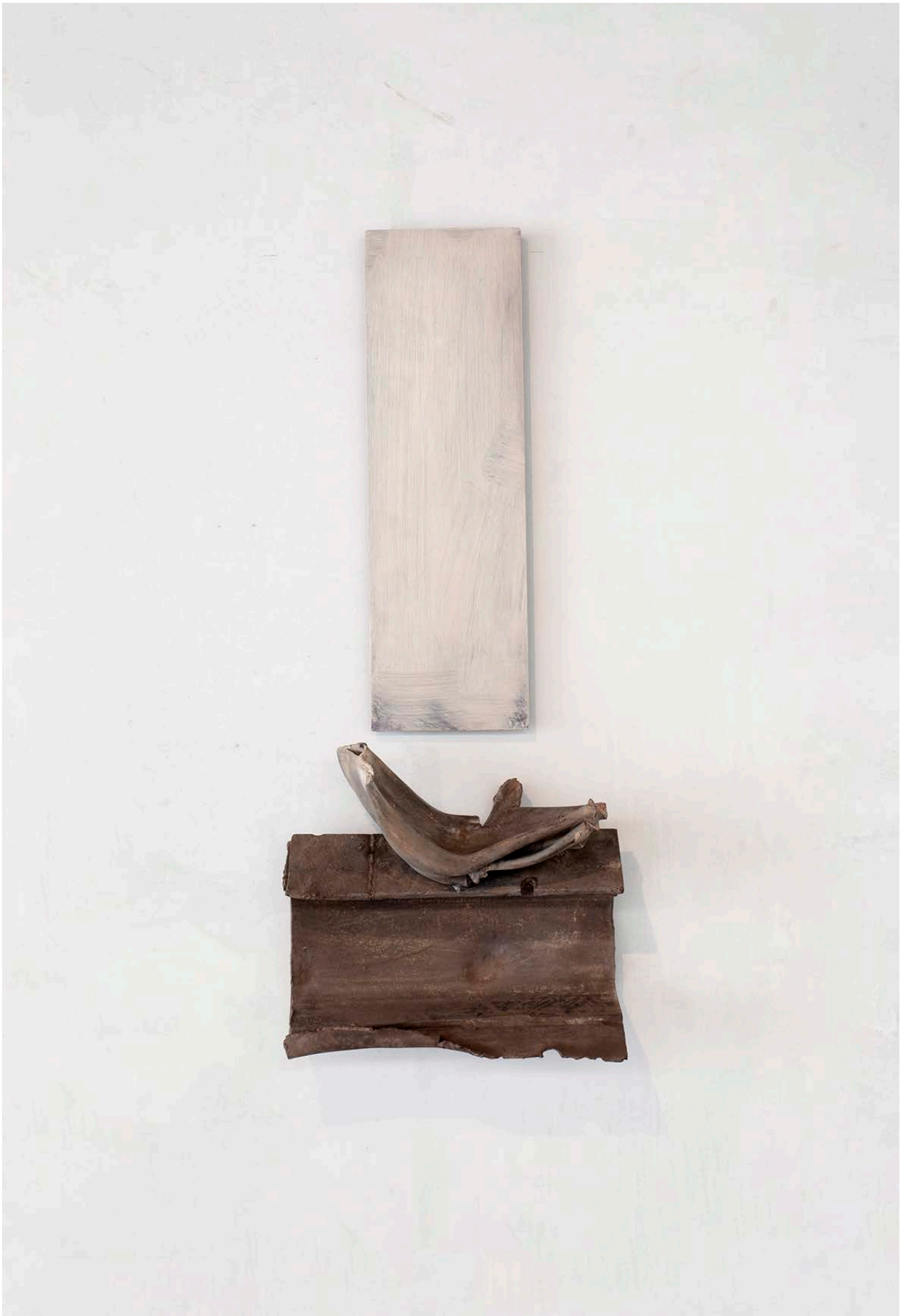
Untitled 2020 Steel and oil paint 40 x 42 x 19 cm + 62 x 20 x 3 cm