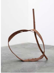
Pi mal Daumen (Rule of thumb) (A ojo de buen cubero) 2020 Steel and oil paint 191 x 150 x 50 cm | 75 1/4 x 59 x 19 2/3 in ME/S 31