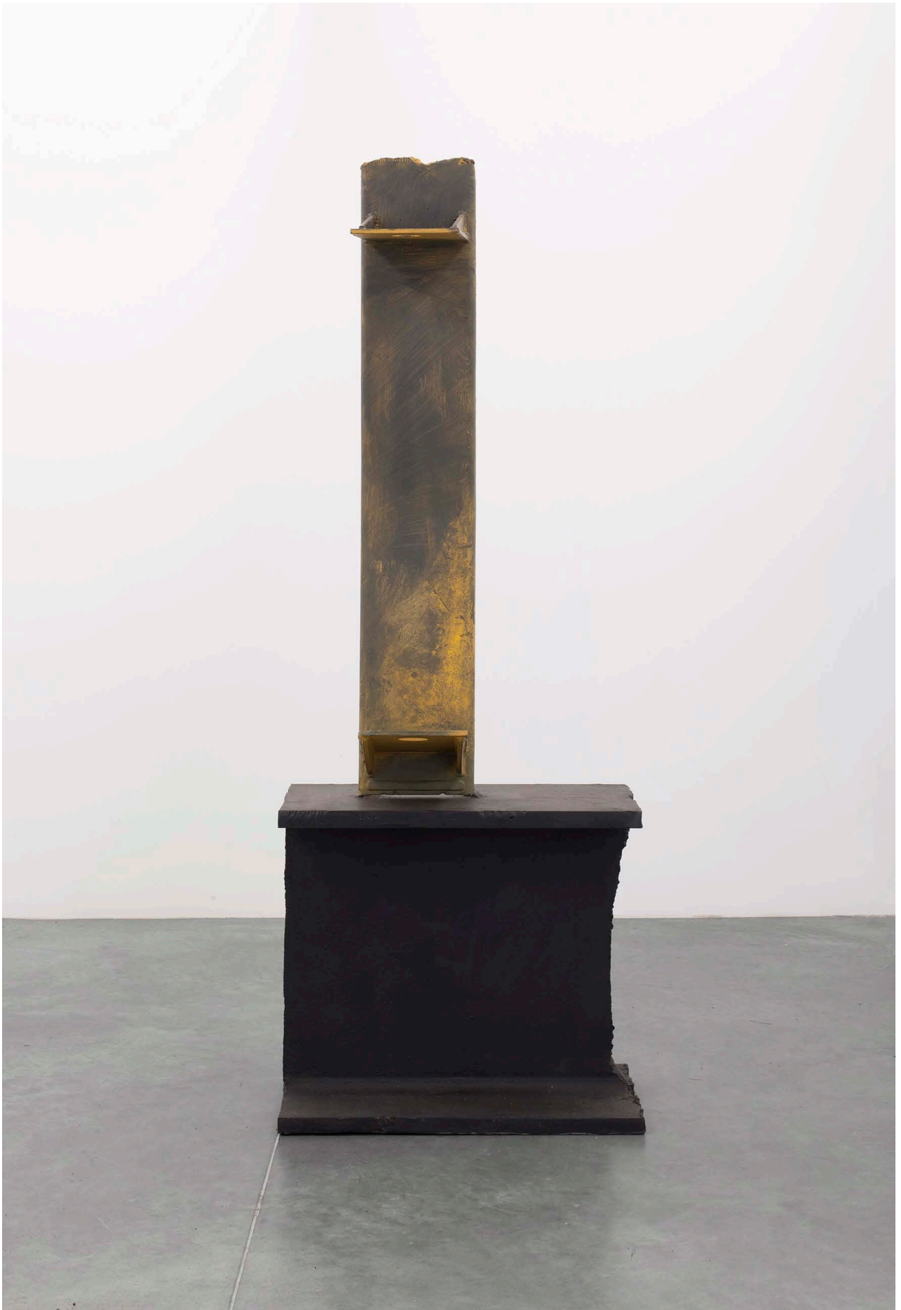
Untitled 2020 Steel and oil paint 160 x 58 x 40 cm | 63 x 22 3/4 x 15 3/4 in