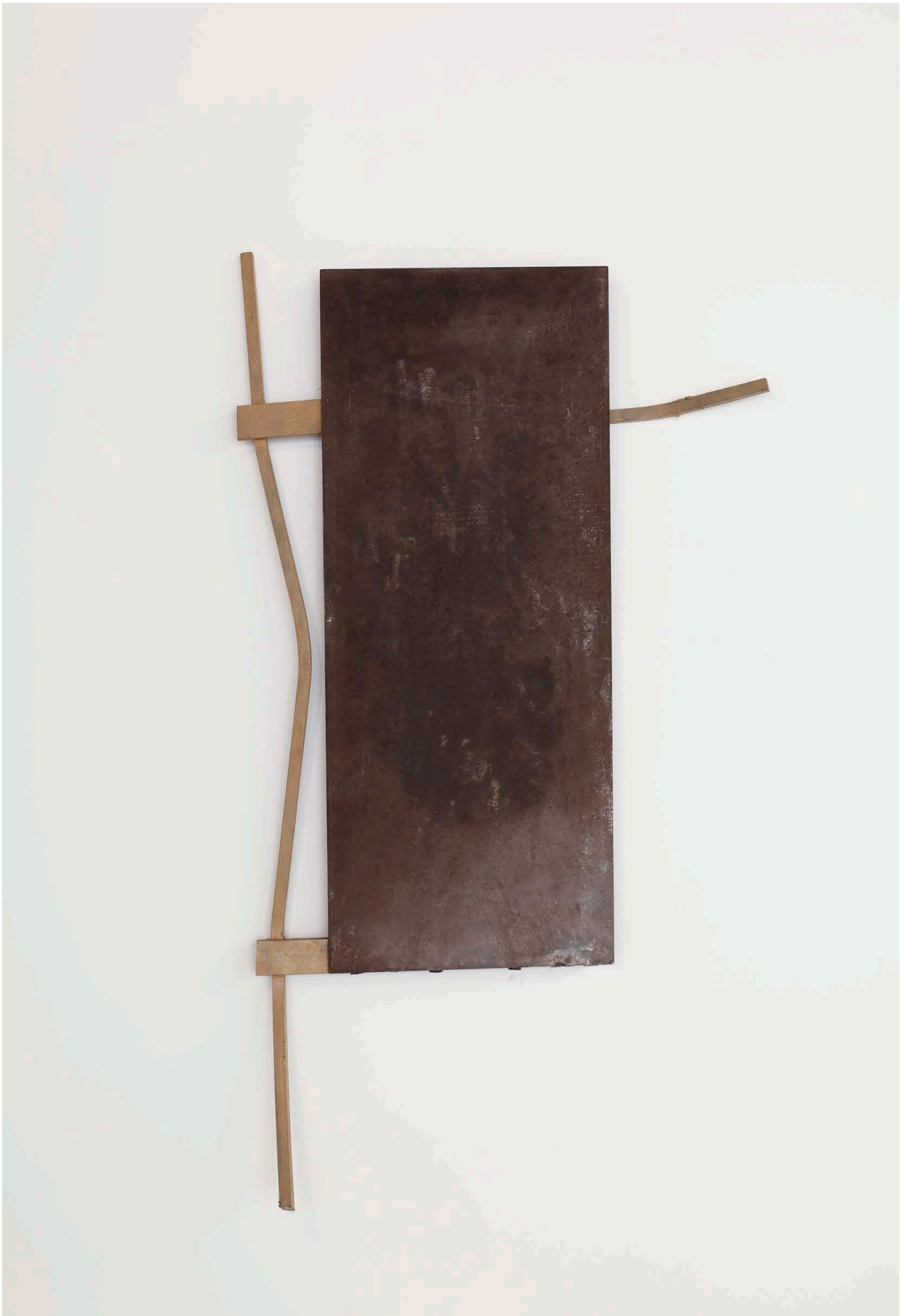
Untitled 2020 Steel and oil paint 110 x 62 x 12 cm | 43 1/3 x 24 1/2 x 4 3/4 in