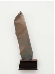
Untitled 2020 Steel and oil paint 150 x 62 x 44 cm | 59.05 x 24.4 x 17.32 in ME/WO 79