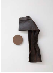
Untitled 2020 Steel and oil paint 120 x 54 x 30 cm + ø 26 x 8 cm | 120 x 54 x 30 cm + ø 26 x 8 cm ME/WO 80