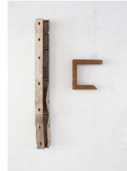
Untitled 2020 Steel and oil paint 125 x 14 x 14 cm + 30 x 30 x 9 cm ME/WO 85