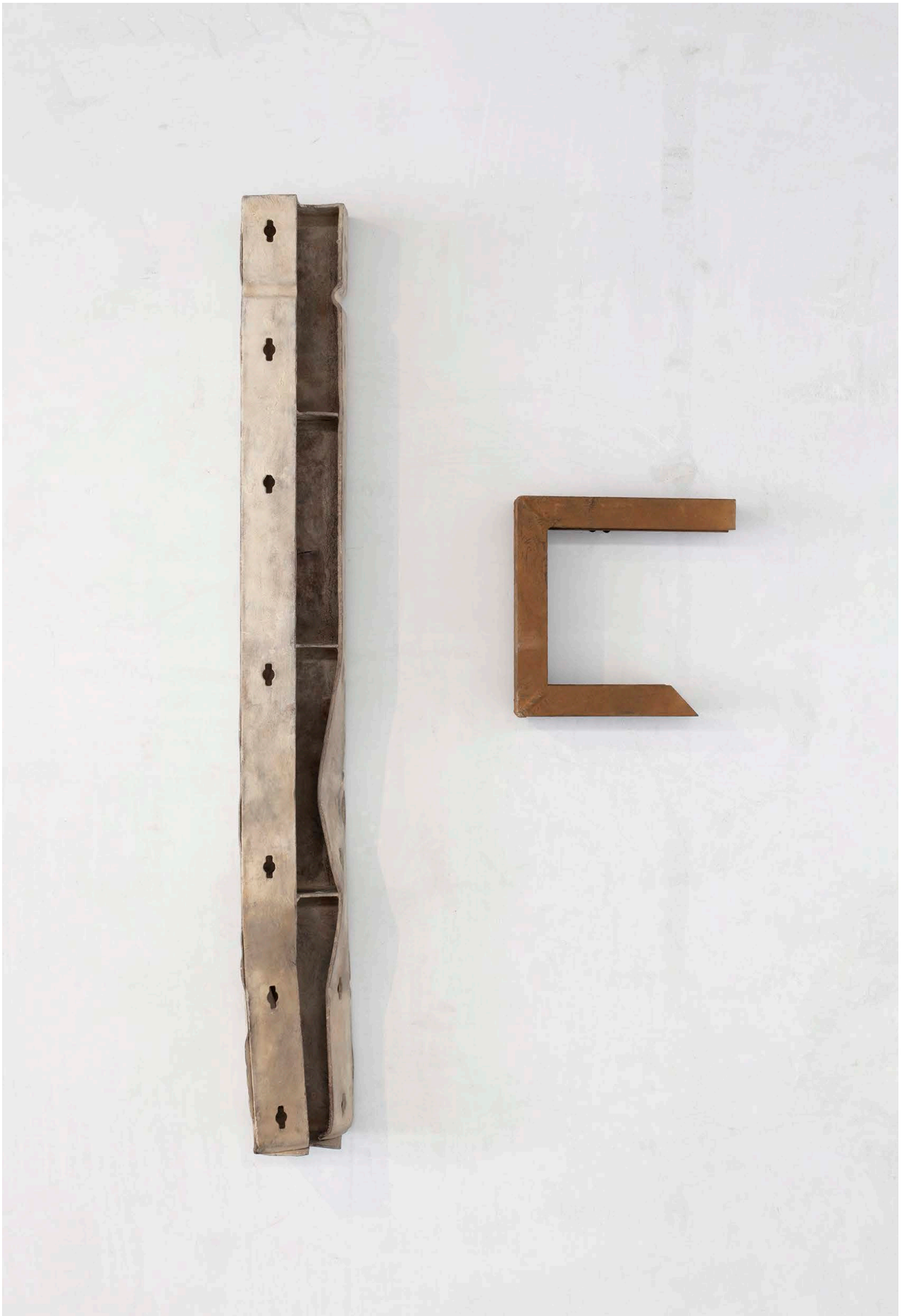
Untitled 2020 Steel and oil paint 125 x 14 x 14 cm + 30 x 30 x 9 cm