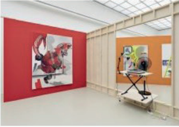
Pieter Schoolwerth »Your Vacuum Sucks« (Detail), 2015

Filminstallation Installation view Kunstverein Hannover