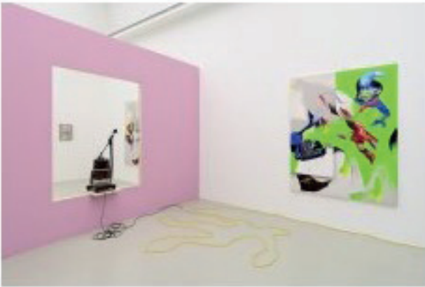
Pieter Schoolwerth »Your Vacuum Sucks« (Detail), 2015

Filminstallation Installation view Kunstverein Hannover