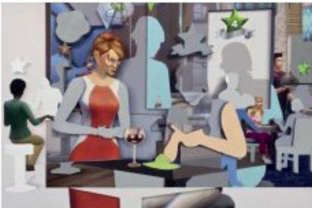
Pieter Schoolwerth »Shifted Sims #4 (Dine Out Expansion Pack)«, 2020 Courtesy of the artist, Kraupa-Tuskany Zeidler und Capitain Petzel, Berlin, and Petzel Gallery, New York