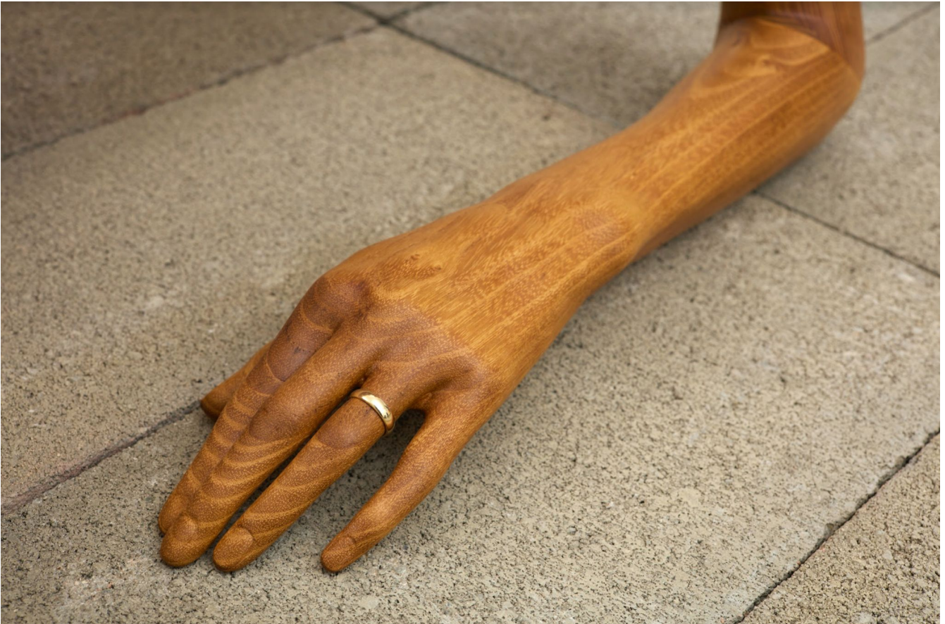
Orgy For Ten People In One Body: 7 (detail), 2021.