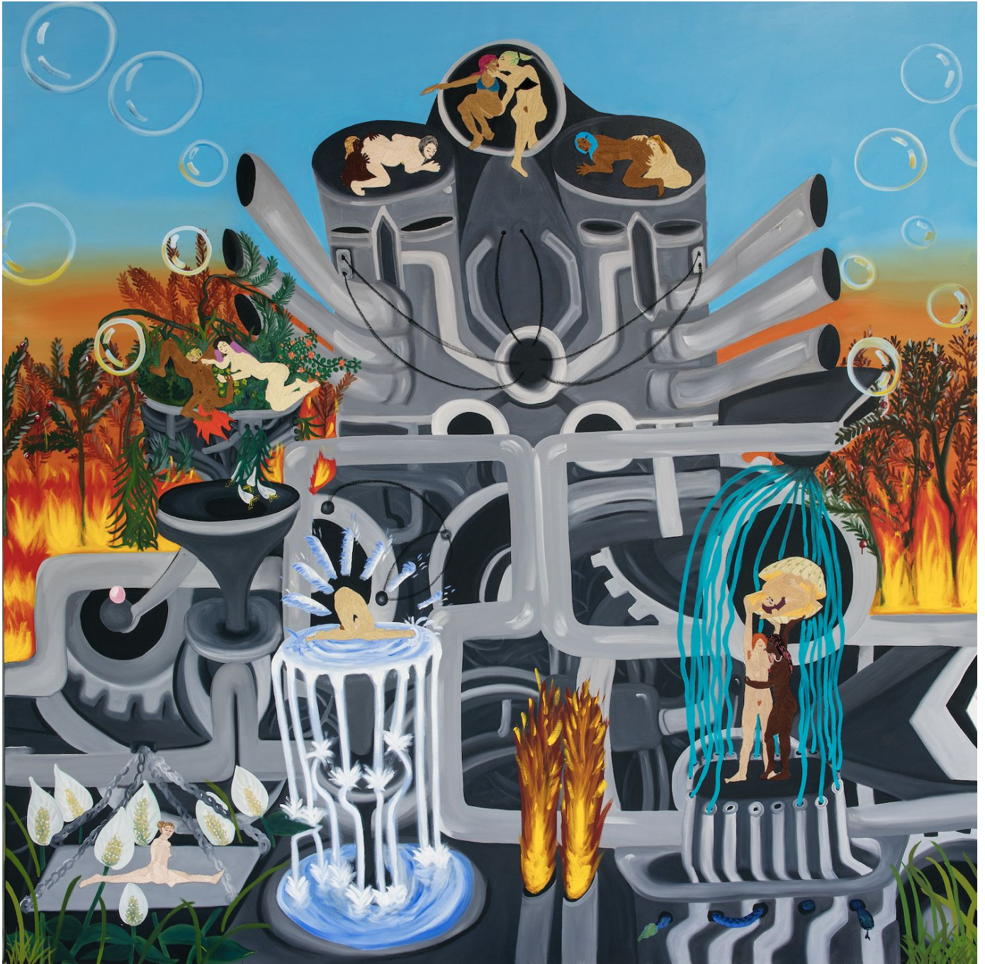
Times Come to an End (middle panel), 2021.