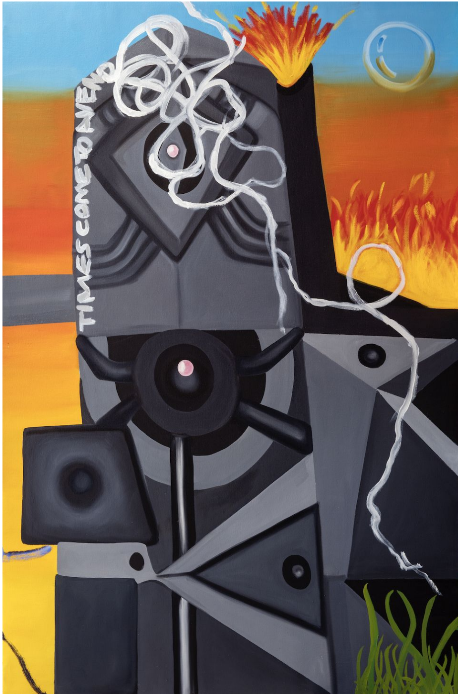
Times Come to an End (left panel), 2021.