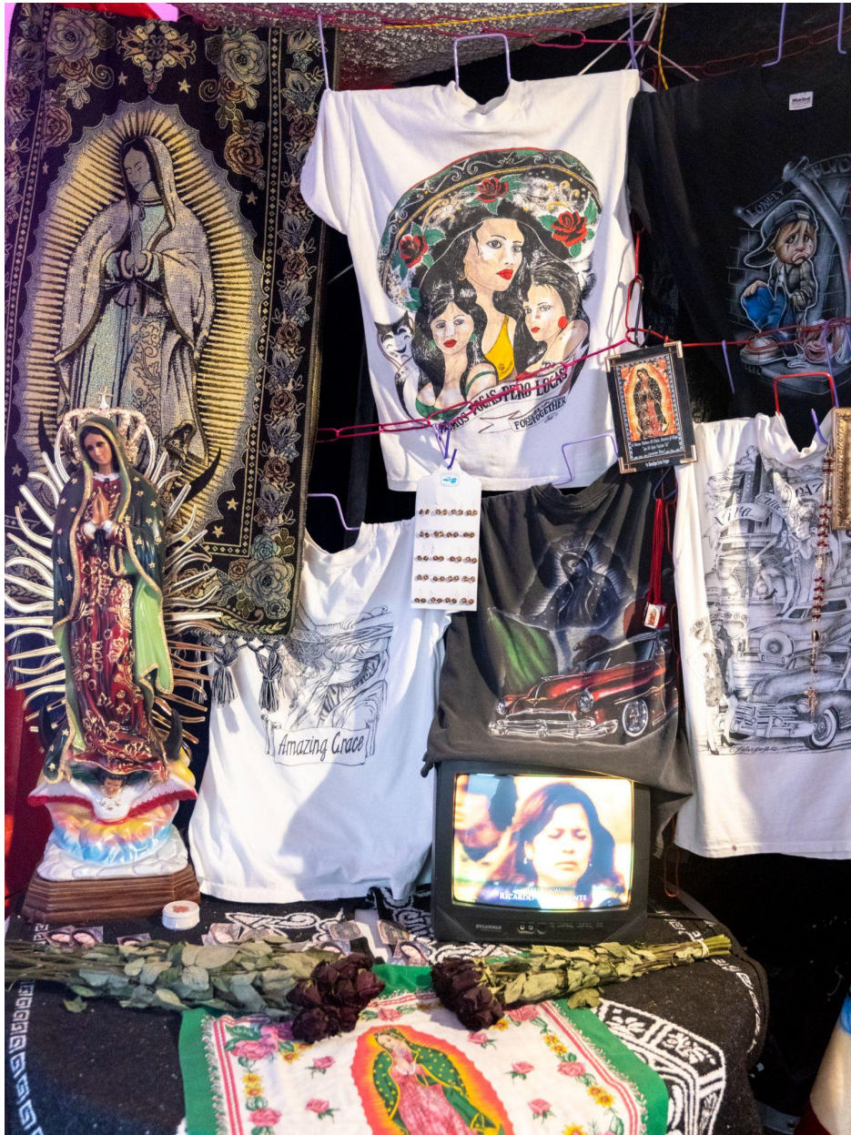
Taking Our Power Back Through the Red Rose (detail), 2021. Installation view.