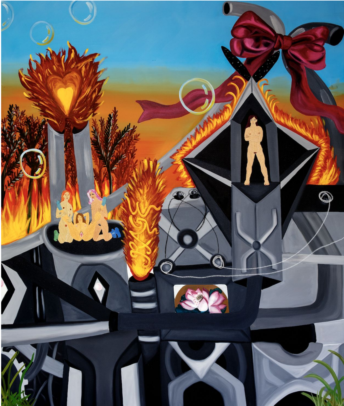
Times Come to an End (middle right panel), 2021.