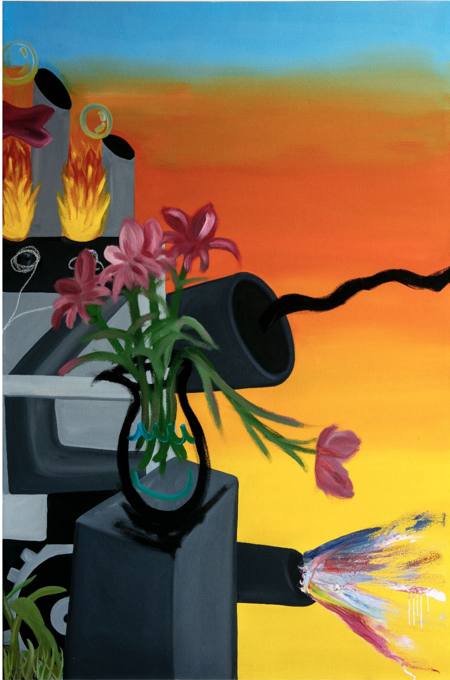
Times Come to an End (right panel), 2021.