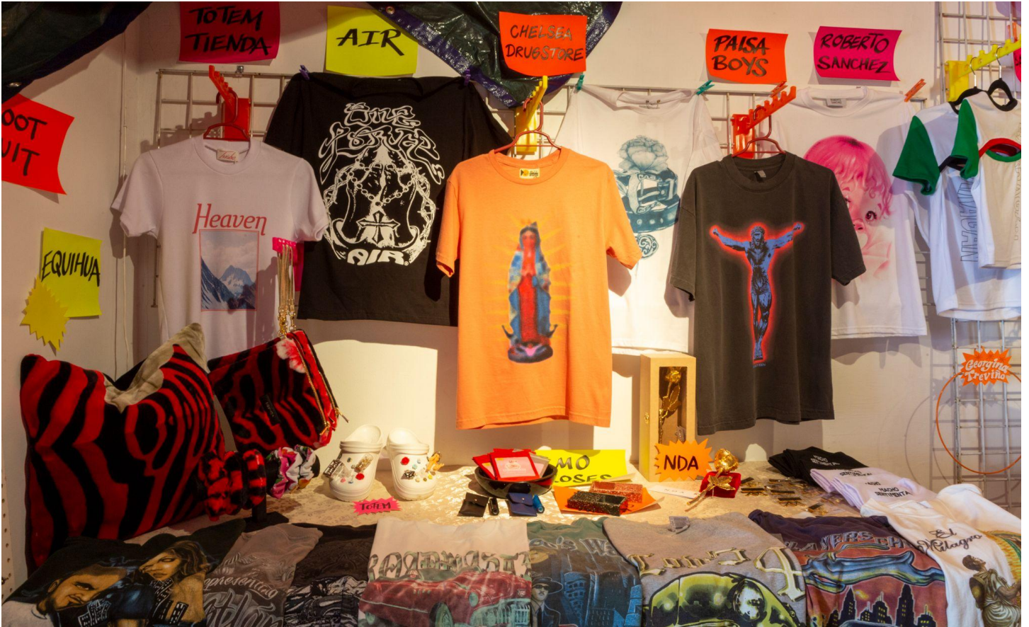
Sacred Rose Mercado 2021. Installation view.