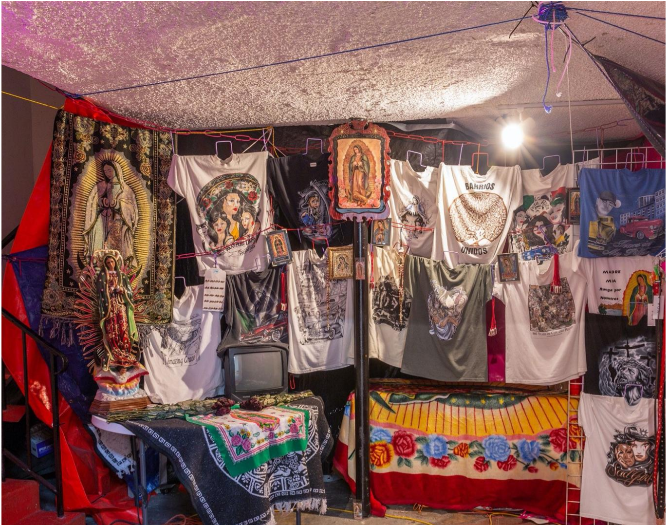
Taking our Power Back through the Red Rose Installation, 2021. Selections from the vintage Chicano t-shirt collection of Zoot Suit; memorabilia from the Basilica de Guadalupe, Mexico City. Dimensions variable.