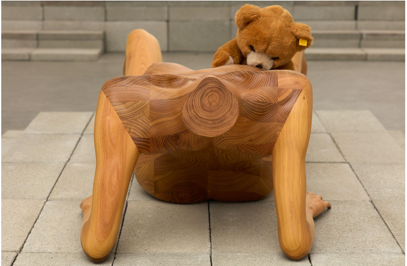
Orgy For Ten People In One Body: 7 (detail), 2021.