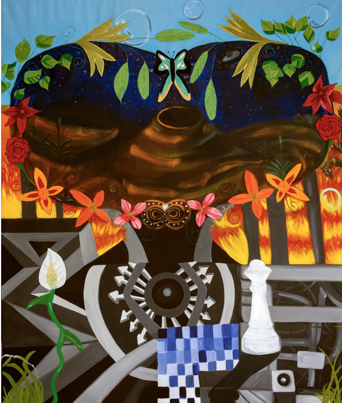
Times Come to an End (middle left panel), 2021.