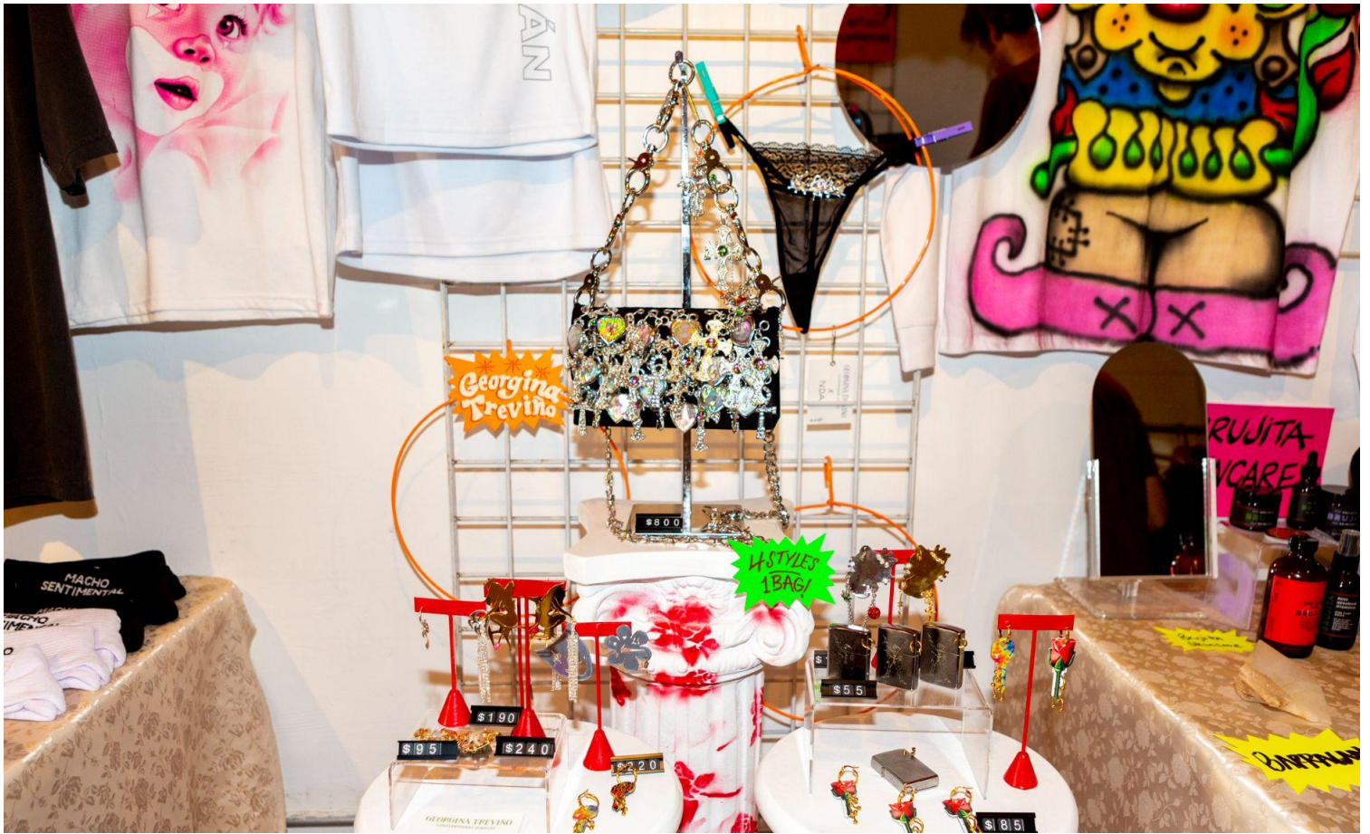
Sacred Rose Mercado, 2021. Installation view.