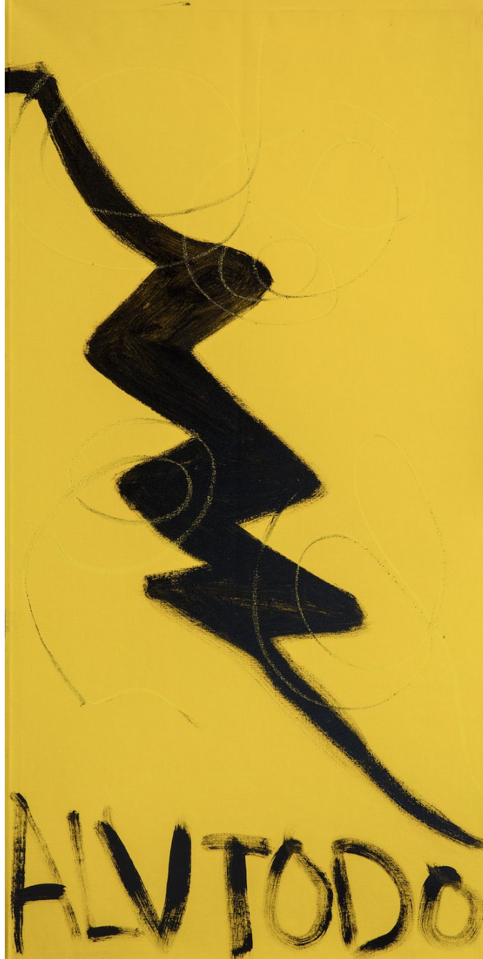
Times Come to an End (far right panel), 2021.