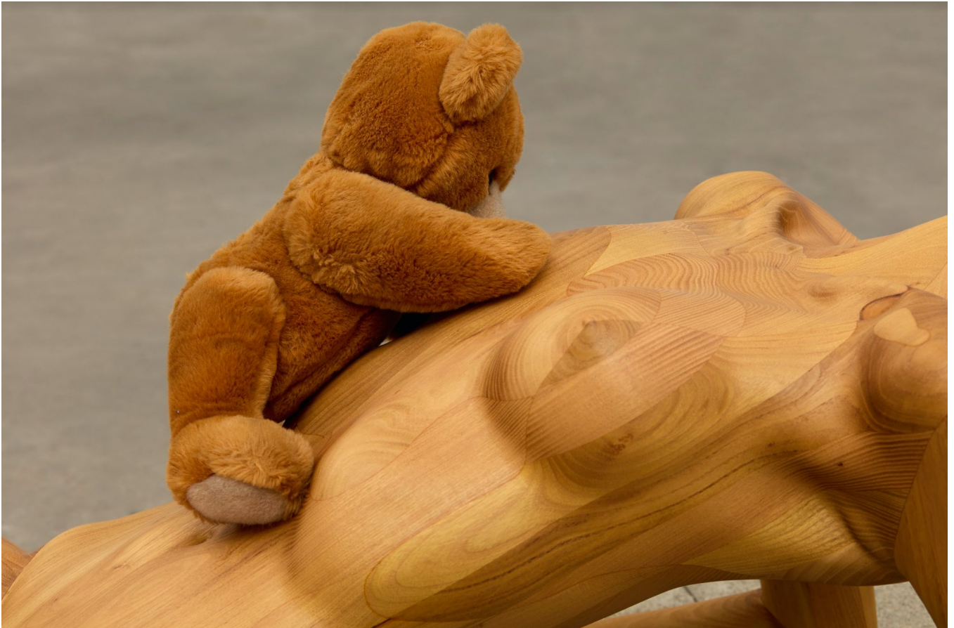
Orgy For Ten People In One Body: 7 (detail), 2021.