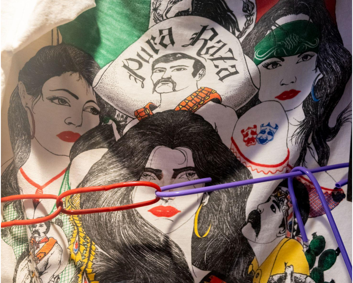
Taking Our Power Back Through the Red Rose (detail), 2021. Installation view.