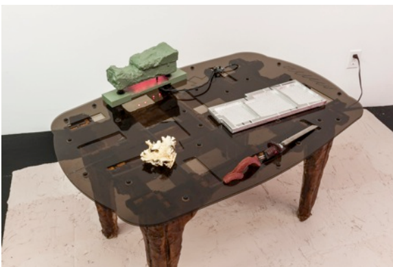
Colin Foster Travel Plaza, Four A.M. , 2015 Fiberglass, MDF, Cast Acrylic, Foam, Aluminum, Steel, Wax, Custom Electronics, Acrylic Paint, PVA, Mushroom, Hardware Dimensions Variable