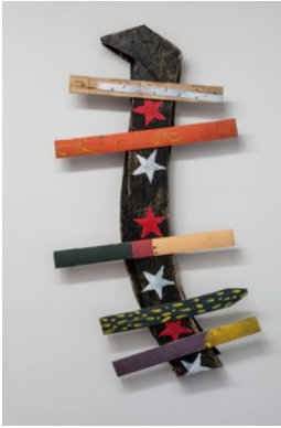
Torey Thornton Banned Dread , 2015 Acrylic and galvanized steel on wood 52 x 27 x 5 inches