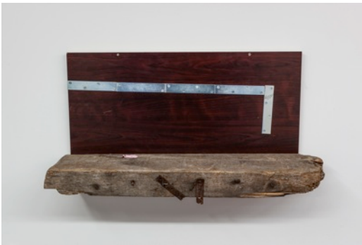
Torey Thornton Broke Top Ribbon (Disturbed Mono) , 2015 Wood, steel and acrylic on wood 15.5 x 28 3/8 x 8.5 inches