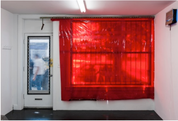
Colin Foster Thirty-Five Cents and a Scratch Implement , 2015 Vinyl, Aluminum, Steel, Rope, Webbing, Chopstick, Hardware Dimensions Variable