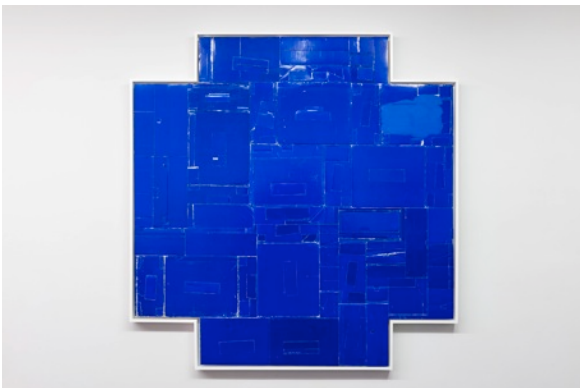
Torey Thornton Manta Mono , 2015 Collage and acrylic on cardboard 61 5/8 x 59 5/8 inches