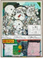
Zachary Armstrong First Steps Picasso Picabia , 2016 Oil and encaustic on canvas in artist's frame 84h x 60w in 213.36h x 152.40w cm Unique ZA16JUN.02