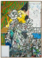
Zachary Armstrong Large Painting with Red and Green Curtain , 2016 Oil and encaustic on canvas in artist's frame 84h x 60w in 213.36h x 152.40w cm Unique ZA16JUN.04