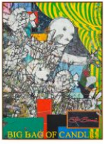
Zachary Armstrong Big Bag of Candles , 2016 Oil and encaustic on canvas in artist's frame 84h x 60w in 213.36h x 152.40w cm Unique ZA16JUN.01