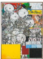
Zachary Armstrong Peppers , 2016 Oil and encaustic on canvas in artist's frame 84h x 60w in 213.36h x 152.40w cm Unique ZA16JUN.05