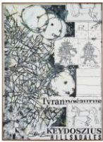
Zachary Armstrong Hills and Dales White , 2016 Oil and encaustic on canvas in artist's frame 84h x 60w in 213.36h x 152.40w cm Unique ZA16JUN.03