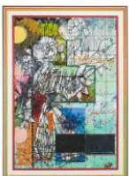
Zachary Armstrong Two Black Squares , 2016 Oil and encaustic on canvas in artist's frame 84h x 60w in 213.36h x 152.40w cm Unique ZA16JUN.06