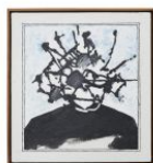
Zachary Armstrong Keith Painting #48 , 2016 Encaustic and oil on canvas in artist frame 25.38h x 23.25w x 2d in 64.45h x 59.06w x 5.08d cm Unique ZA17.02.48