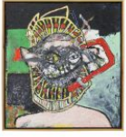
Zachary Armstrong Keith Painting #7 , 2016 Encaustic and oil on canvas in artist frame 25.38h x 23.25w x 2d in 64.45h x 59.06w x 5.08d cm Unique ZA17.02.07