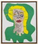
Zachary Armstrong Keith Painting #53 , 2016 Encaustic and oil on canvas in artist frame 25.38h x 21.38w x 2.13d in 64.45h x 54.29w x 5.40d cm Unique ZA17.02.53