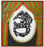
Zachary Armstrong Keith Painting #64, 2016 Encaustic and oil on canvas in artist frame 25.38h x 23.25w x 2d in 64.45h x 59.06w x 5.08d cm Unique ZA17.02.64