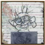
Zachary Armstrong Keith Painting #5 , 2016 Encaustic and oil on canvas in artist frame 25.25h x 25.25w x 1.88d in 64.14h x 64.14w x 4.76d cm Unique ZA17.02.05