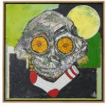
Zachary Armstrong Keith Painting #55 , 2016 Encaustic and oil on canvas in artist frame 25.25h x 25.25w x 1.88d in 64.14h x 64.14w x 4.76d cm Unique ZA17.02.55