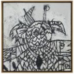
Zachary Armstrong Keith Painting #9 , 2016 Encaustic and oil on canvas in artist frame 25.25h x 25.25w x 1.88d in 64.14h x 64.14w x 4.76d cm Unique ZA17.02.09