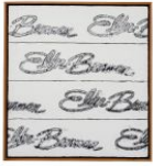
Zachary Armstrong Keith Painting #68, 2016 Encaustic and oil on canvas in artist frame 25.38h x 23.25w x 2d in 64.45h x 59.06w x 5.08d cm Unique ZA17.02.68