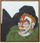
Zachary Armstrong Keith Painting #69, 2017 Encaustic and oil on canvas in artist frame 25.38h x 23.25w x 2d in 64.45h x 59.06w x 5.08d cm Unique ZA17.02.69