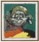
Zachary Armstrong Keith Painting #14, 2016 Encaustic and oil on canvas in artist frame 25.38h x 23.25w x 2d in 64.45h x 59.06w x 5.08d cm Unique ZA17.02.14