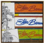
Zachary Armstrong Keith Painting #22, 2016 Encaustic and oil on canvas in artist frame 25.25h x 25.25w x 1.88d in 64.14h x 64.14w x 4.76d cm Unique ZA17.02.22