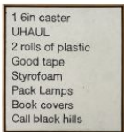
Zachary Armstrong Keith Painting #66, 2016 Encaustic and oil on canvas in artist frame 25.38h x 23.25w x 2d in 64.45h x 59.06w x 5.08d cm Unique ZA17.02.66