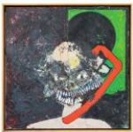
Zachary Armstrong Keith Painting #65, 2017 Encaustic and oil on canvas in artist frame 25.25h x 25.25w x 1.88d in 64.14h x 64.14w x 4.76d cm Unique ZA17.02.65