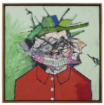
Zachary Armstrong Keith Painting #18, 2016 Encaustic and oil on canvas in artist frame 25.25h x 25.25w x 1.88d in 64.14h x 64.14w x 4.76d cm Unique ZA17.02.18