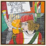
Zachary Armstrong Keith Painting #40, 2016 Encaustic and oil on canvas in artist frame 25.25h x 25.25w x 1.88d in 64.14h x 64.14w x 4.76d cm Unique ZA17.02.40