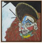
Zachary Armstrong Keith Painting #16, 2016 Encaustic and oil on canvas in artist frame 25.25h x 25.25w x 1.88d in 64.14h x 64.14w x 4.76d cm Unique ZA17.02.16