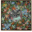
Zachary Armstrong Keith Painting #61, 2016 Encaustic and oil on canvas in artist frame 25.25h x 25.25w x 1.88d in 64.14h x 64.14w x 4.76d cm Unique ZA17.02.61