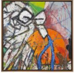
Zachary Armstrong Keith Painting #8 , 2016 Encaustic and oil on canvas in artist frame 25.25h x 25.25w x 1.88d in 64.14h x 64.14w x 4.76d cm Unique ZA17.02.08