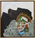
Zachary Armstrong Keith Painting #70, 2017 Encaustic and oil on canvas in artist frame 25.38h x 23.25w x 2d in 64.45h x 59.06w x 5.08d cm Unique ZA17.02.70