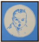
Zachary Armstrong Keith Painting #21, 2016 Encaustic and oil on canvas in artist frame 25.38h x 23.25w x 2d in 64.45h x 59.06w x 5.08d cm Unique ZA17.02.21