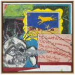
Zachary Armstrong Keith Painting #39, 2016 Encaustic and oil on canvas in artist frame 25.25h x 25.25w x 1.88d in 64.14h x 64.14w x 4.76d cm Unique ZA17.02.39