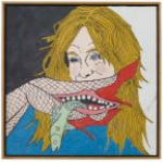
Zachary Armstrong Keith Painting #50 , 2016 Encaustic and oil on canvas in artist frame 25.25h x 25.25w x 1.88d in 64.14h x 64.14w x 4.76d cm Unique ZA17.02.50