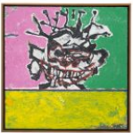
Zachary Armstrong Keith Painting #42, 2016 Encaustic and oil on canvas in artist frame 25.25h x 25.25w x 1.88d in 64.14h x 64.14w x 4.76d cm Unique ZA17.02.42