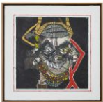
Zachary Armstrong Keith Painting #23, 2016 Encaustic and oil on canvas in artist frame 25.25h x 25.25w x 1.88d in 64.14h x 64.14w x 4.76d cm Unique ZA17.02.23