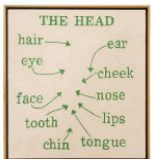
Zachary Armstrong Keith Painting #60 , 2016 Encaustic and oil on canvas in artist frame 25.38h x 23.25w x 2d in 64.45h x 59.06w x 5.08d cm Unique ZA17.02.60