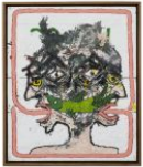
Zachary Armstrong Keith Painting #52 , 2017 Encaustic and oil on canvas in artist frame 25.38h x 21.38w x 2.13d in 64.45h x 54.29w x 5.40d cm Unique ZA17.02.52