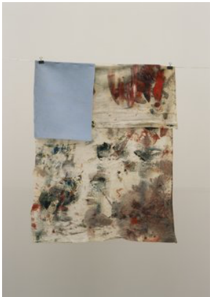
Richard Hawkins "Blanket Flag. Set 3, No. 1", 2004 paint, felt, cloth 39.2 x 26.9 cm RH/M 2004/33