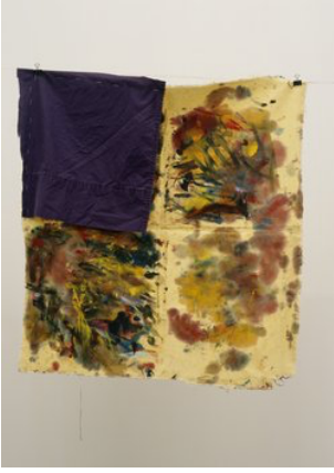
Richard Hawkins "Blanket Flag. Set 3, No. 6", 2004 paint, cloth 71 x 65 cm RH/M 2004/38