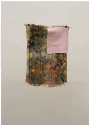
Richard Hawkins "Blanket Flag. Set 3, No. 3", 2004 paint, felt, towel 56.3 x 37.9 cm RH/M 2004/35