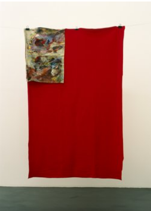
Richard Hawkins "Blanket Flag. Set 2, No. 3", 2004 paint, pillowcase, flannel 135.9 x 86.9 cm RH/M 2004/30