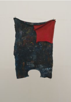
Richard Hawkins "Blanket Flag. Set 2, No. 1", 2004 paint, cloth, altered thermal underwear in plexi-case 56.3 x 39.2 cm RH/M 2004/28