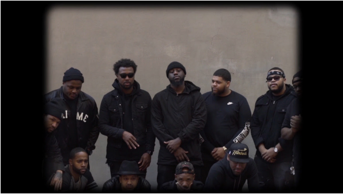
Cameron Granger; This Must Be the Place , 2018.; Digital video; 4:32 minutes; Courtesy of the artist.