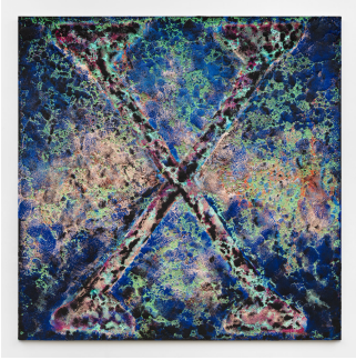
Vaughn Spann - Cosmic Symbiote (Marked Man) , 2019 - Polymer paint, mixed media on aluminum stretcher bars - 84 x 84 1/8 inches; 213.4 x 213.7 cm / © Vaughn Spann - Courtesy of the Artist and Almine Rech - Photo: Dan Bradica

Opening Reception Wednesday, January 15th 6 to 8 PM