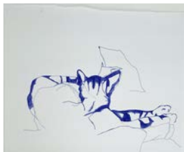
Prickly Position 2, 2020