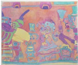
Artifact B, 2020 Colorpencil on paper 35.50 x 43.30 cm