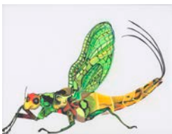
Mayfly 3 , 2021 Colorpencil on transparent paper 21.65 x 28 cm