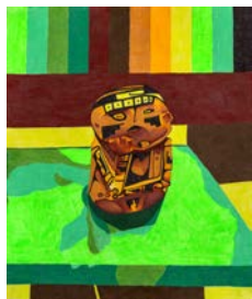
Artifact 2, 2020 Pencil on paper 43.30 x 35.50 cm