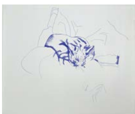
Prickly Position 1, 2020