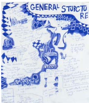
General Structure, 2020 Blue pen on paper 43.30 x 35.50 cm