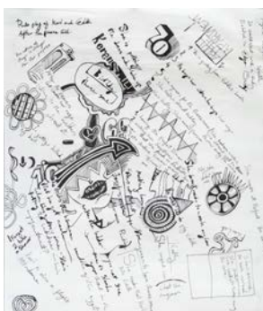
He buys her clothes He buys her wigs, 2020 Pen on Paper 35.50 x 43.30 cm