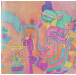
Artifact A, 2020 Colorpencil on paper 35.50 x 35.50 cm