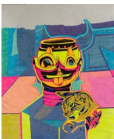
Prickly 2000, 2020 Colorpencil on paper 43.30 x 35.50 cm