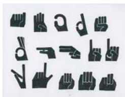
Sign language O-Z , 2020 Pencil on Paper 21.60 x 27.90 cm