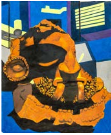
Artifact 1, 2020 Pencil on paper 43.30 x 35.50 cm