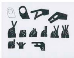
Sign language A-N , 2020 Pencil on paper 21.60 x 27.90 cm