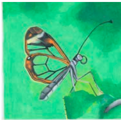
Mayfly, 2021 Colorpencil on paper 21.60 x 21.60 cm