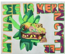
my name, 2020 Color pencil and marker pen on paper 43 x 35.50 cm