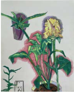
Outlet, 2021 Colorpencil on paper 43 x 35.50 cm