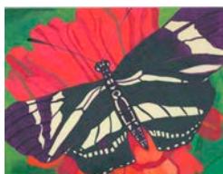
Butterfly , 2021 Colorpencil on paper 21.65 x 27.80 cm