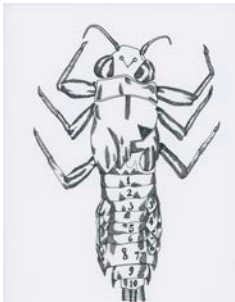
Mayfly body, 2021 Pencil on paper 28 x 21.50 cm