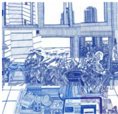
Blue Window, 2020