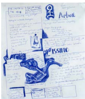
Arbeit, 2020 Blue pen on paper 43.30 x 35.50 cm