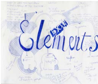
Elements, 2020 Blue pen on paper 35.50 x 43.30 cm