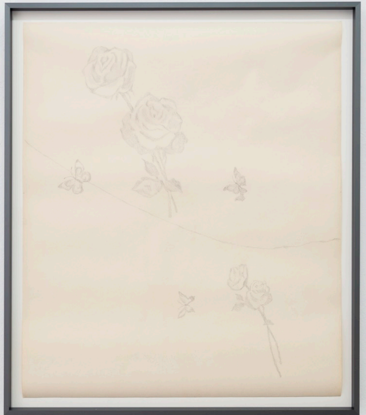
Frankfurter Strasse 56 (Roses I) , 2021 Pencil on found paper 59,5 x 51,5 cm