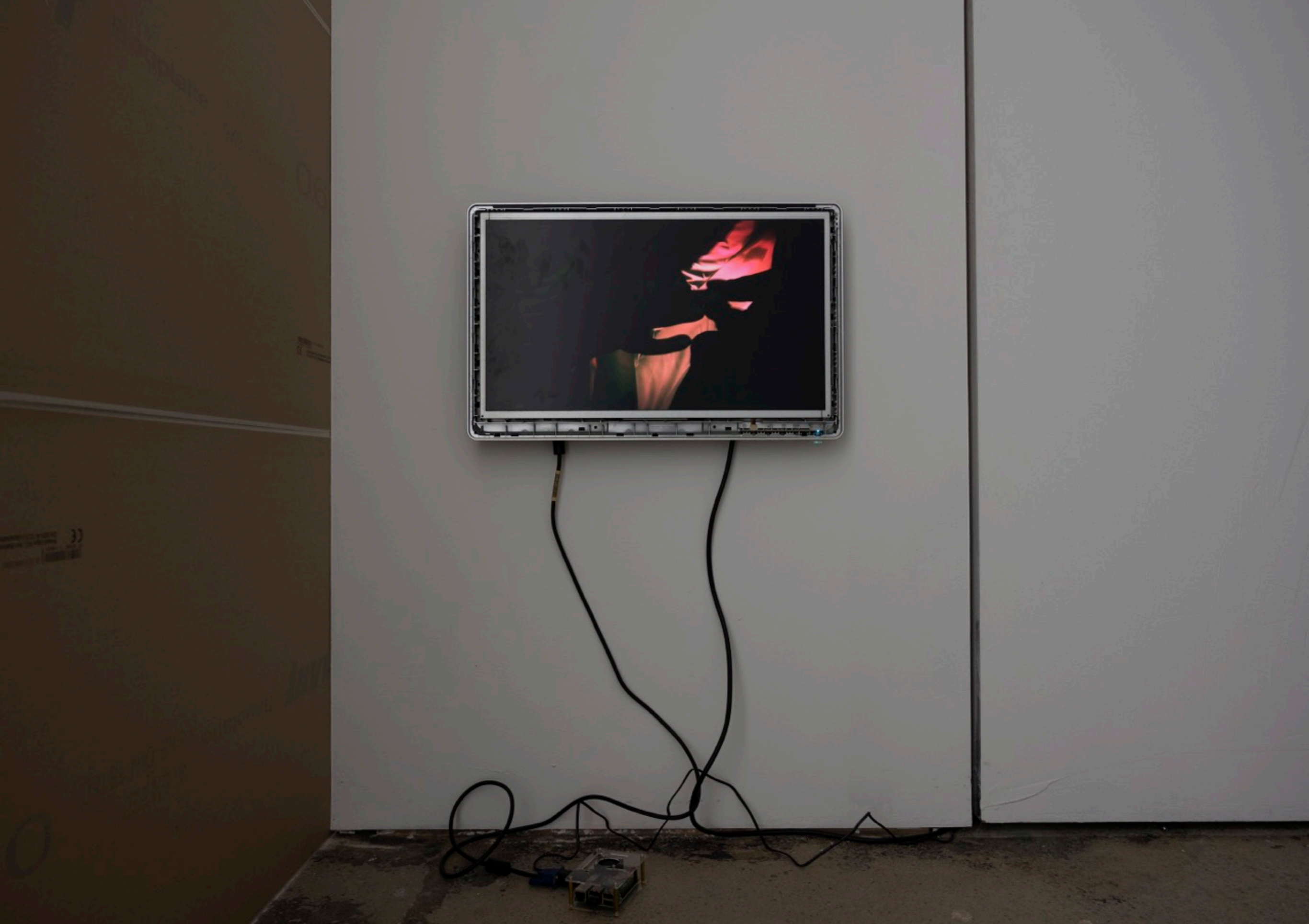
Sequenz 3, 2021 Liquid Crystal Display, Raspberry Pi Computer, Video in continuous loop Dimensions variable