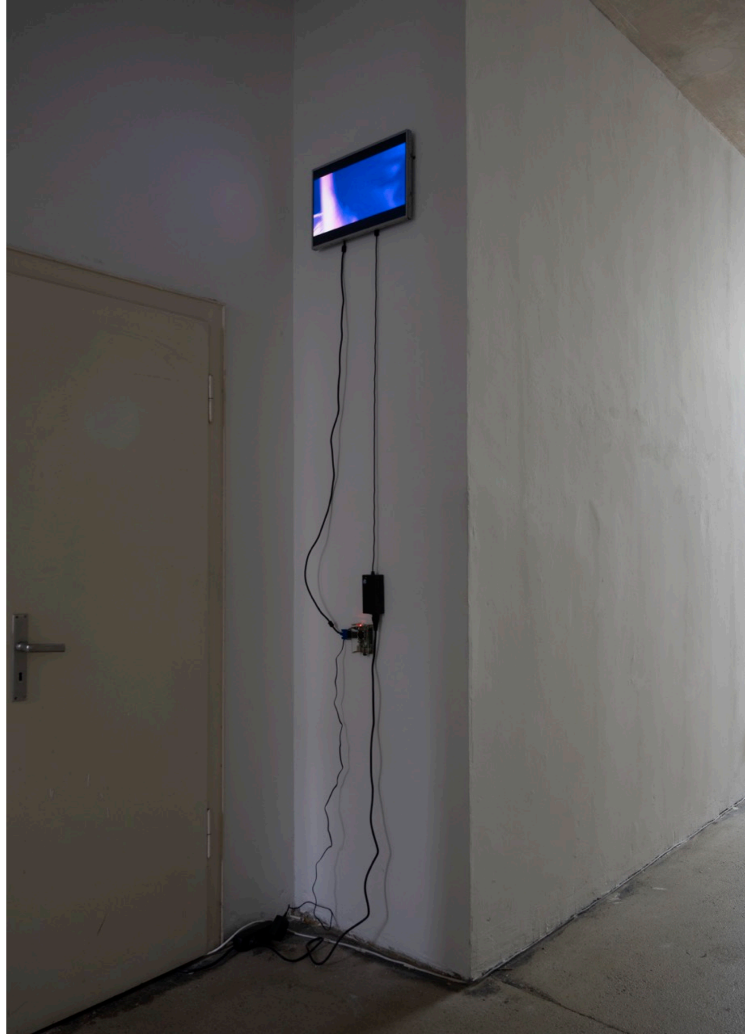
Sequenz 2, 2021 Liquid Crystal Display, Raspberry Pi Computer, Video in continuous loop Dimensions variable