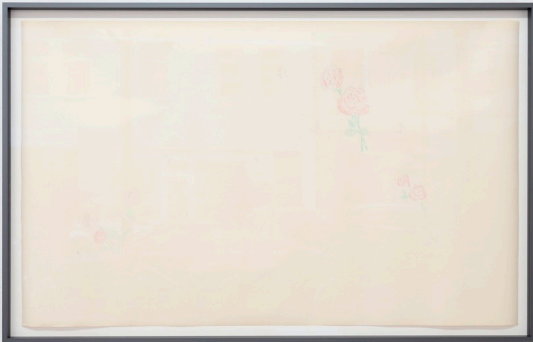
Frankfurter Strasse 56 (Roses II) , 2021 Colored pencil on found paper 51,5 x 81,5 cm