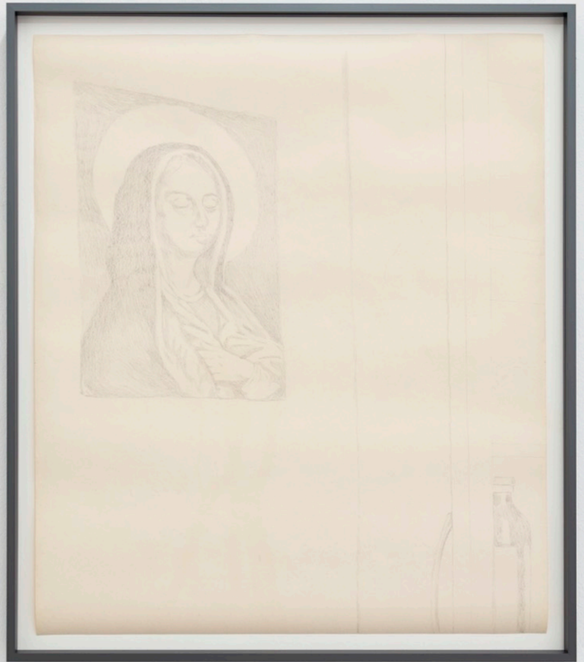
Frankfurter Strasse 56 (Madonna) , 2021 Pencil on found paper 59,5 x 51,5 cm