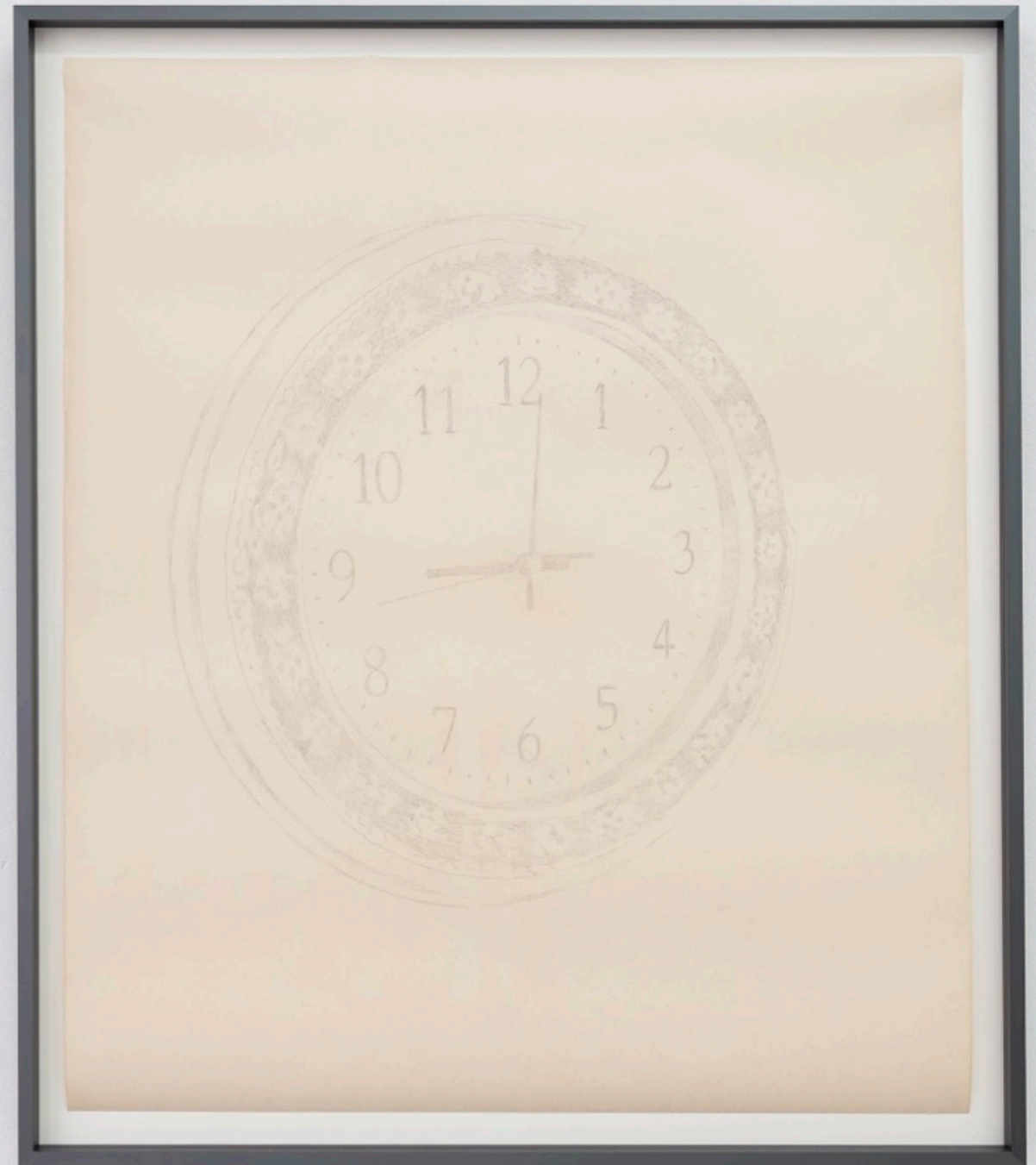
Frankfurter Strasse 56 (9:02), 2021 Pencil on found paper 59,5 x 51,5 cm