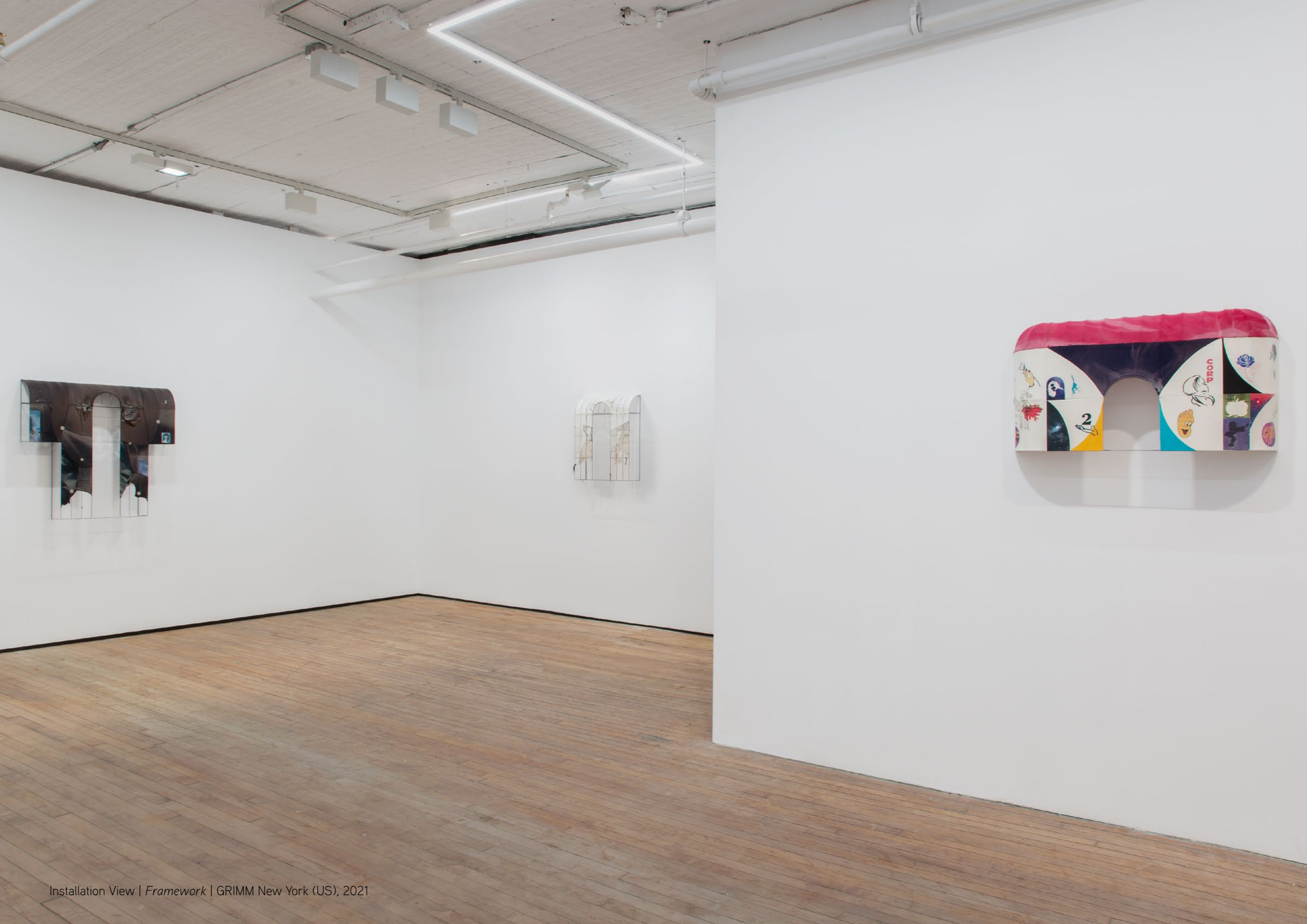
Installation View | Framework | GRIMM New York (US), 2021