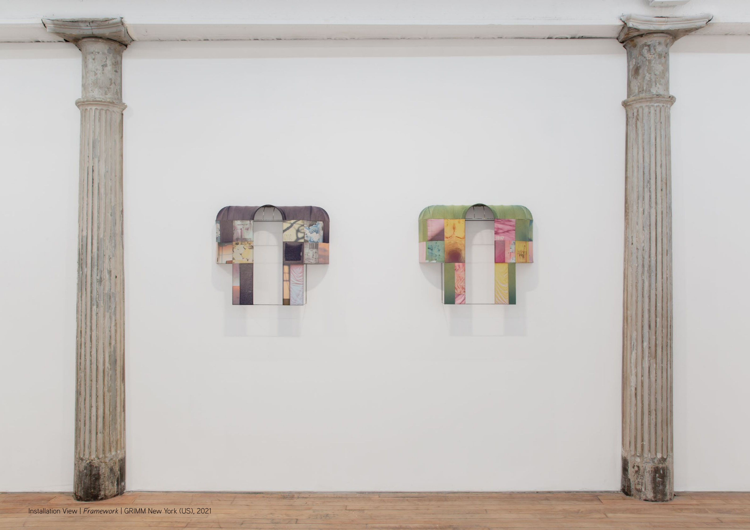
Installation View | Framework | GRIMM New York (US), 2021