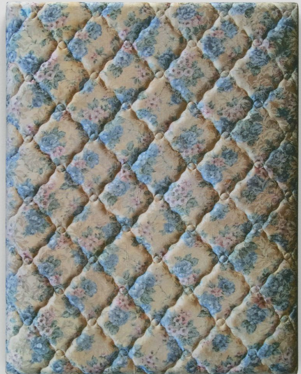
Something for Easter , 2021

Inkjet print on fabric, stretched over hand-shaped board 38.7 x 30.5 x 1.9 cm | 15 1/4 x 12 x 3/4 in