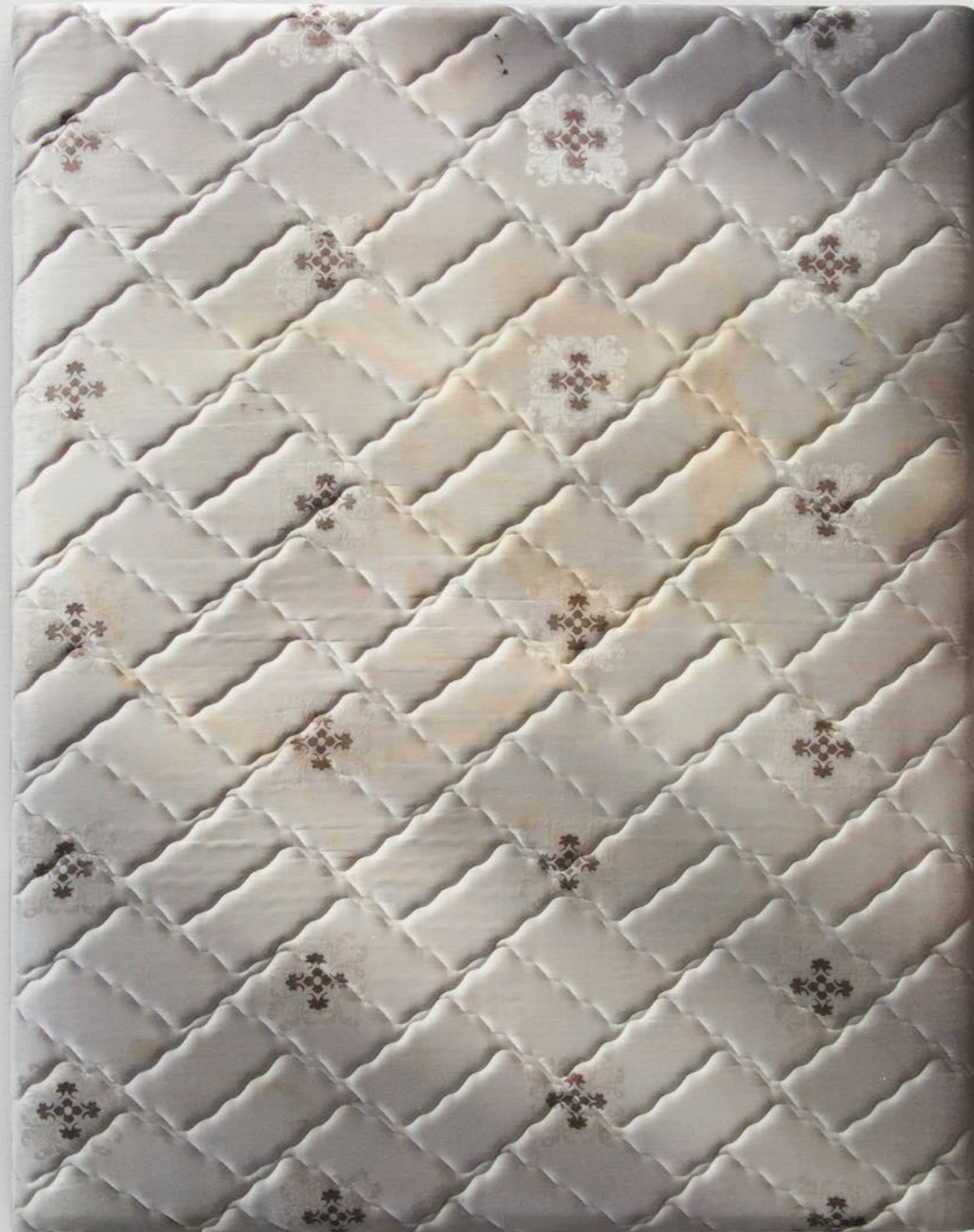
The Seasons , 2021 Inkjet print on fabric, stretched over hand-shaped board 38.7 x 30.5 x 1.9 cm | 15 1/4 x 12 x 3/4 in