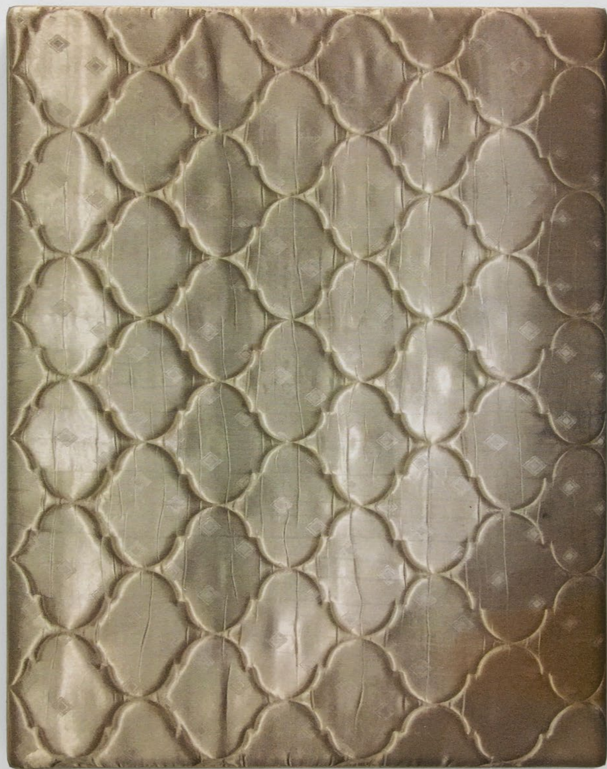
In Confidence , 2021 Inkjet print on fabric, stretched over hand-shaped board 38.7 x 30.5 x 1.9 cm | 15 1/4 x 12 x 3/4 in