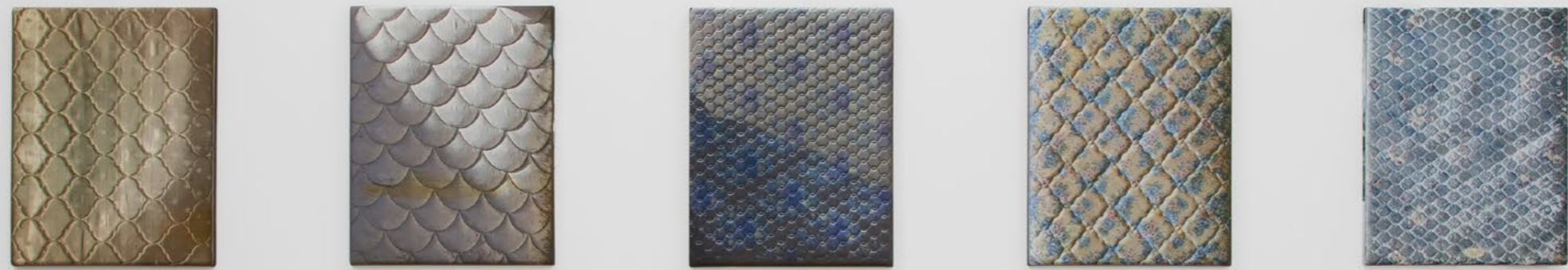
Installation View | Framework | GRIMM New York (US), 2021