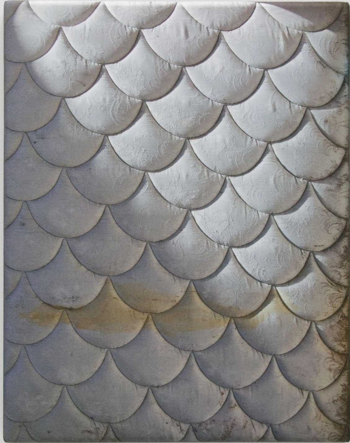
Consolatio , 2021

Inkjet print on fabric, stretched over hand-shaped board 38.7 x 30.5 x 1.9 cm | 15 1/4 x 12 x 3/4 in