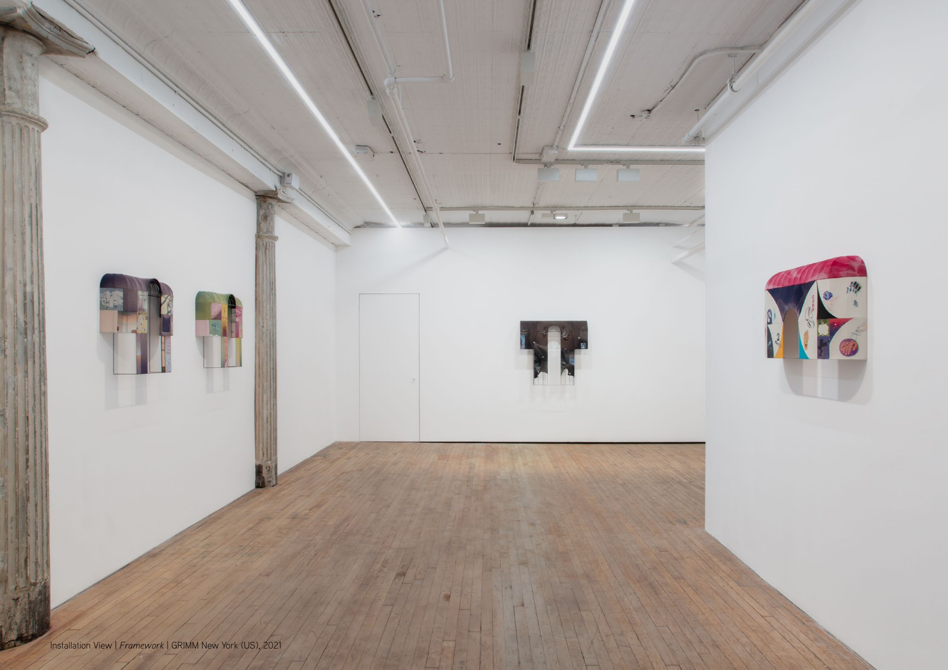
Installation View | Framework | GRIMM New York (US), 2021