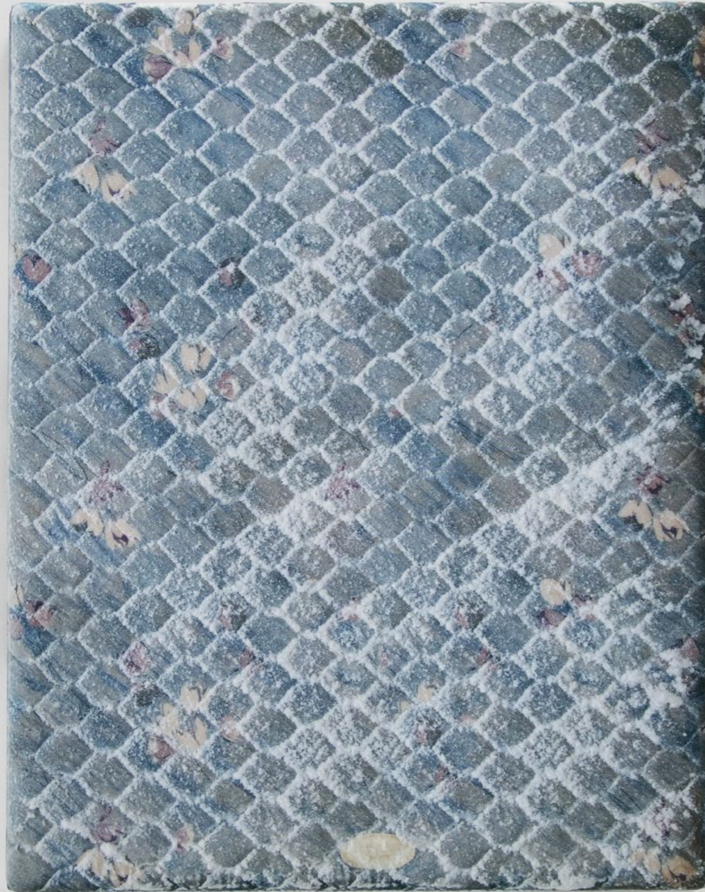
Love Comes Quietly , 2021

Inkjet print on fabric, stretched over hand-shaped board 38.7 x 30.5 x 1.9 cm | 15 1/4 x 12 x 3/4 in