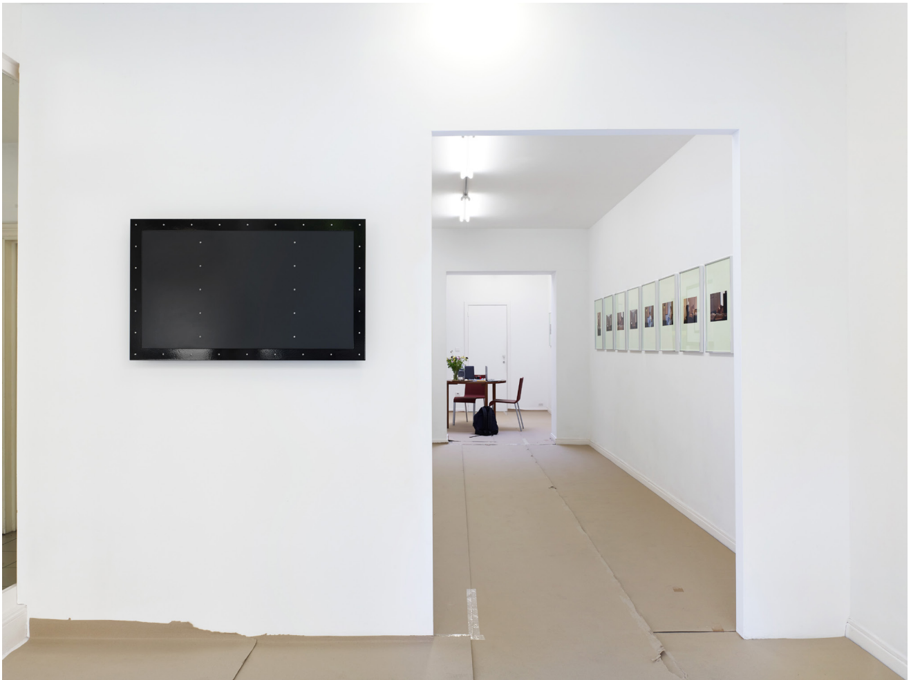
Emanuele Marcuccio SEP 21 Installation view 2021