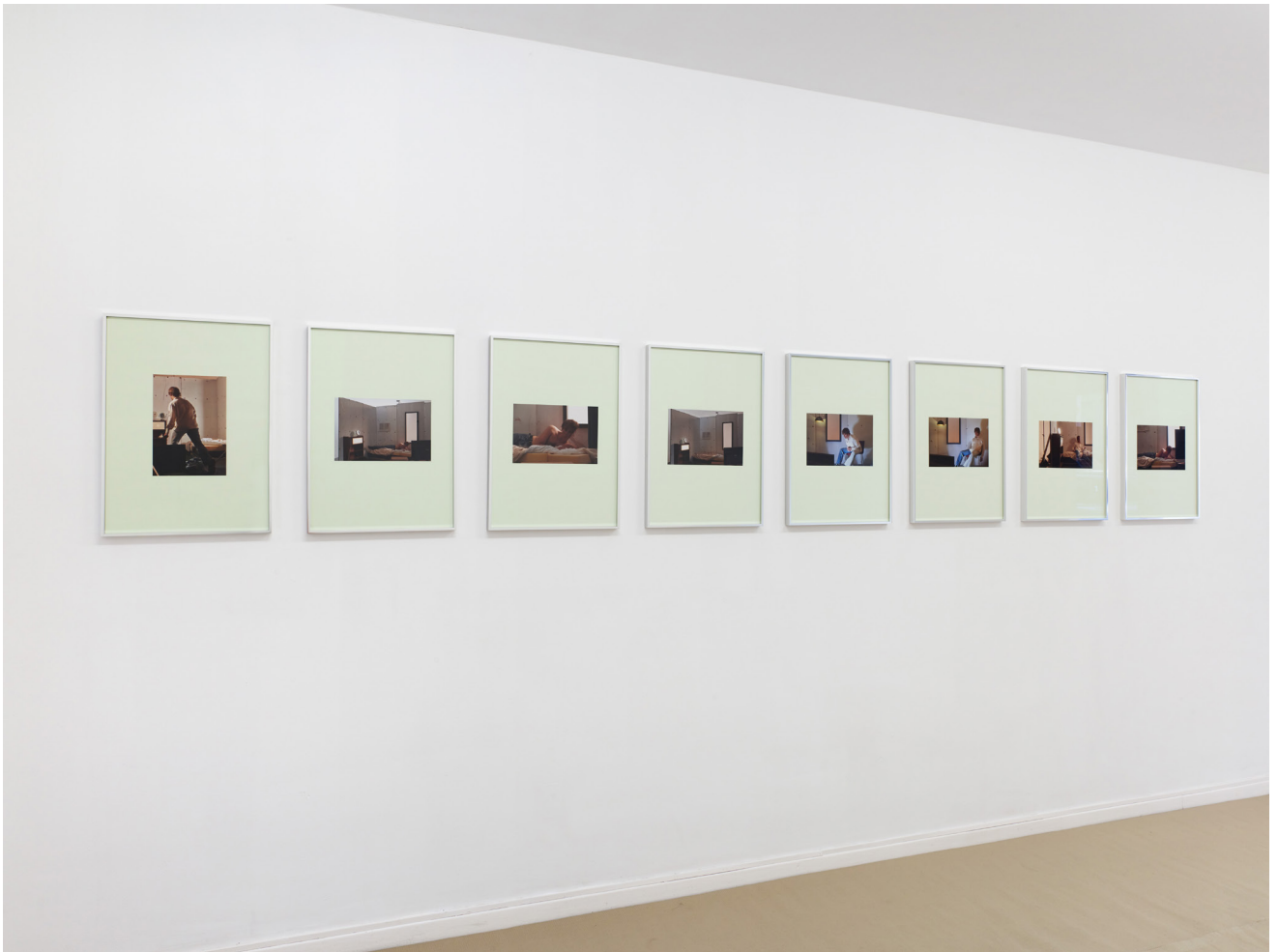
Emanuele Marcuccio SEP 21 Installation view 2021