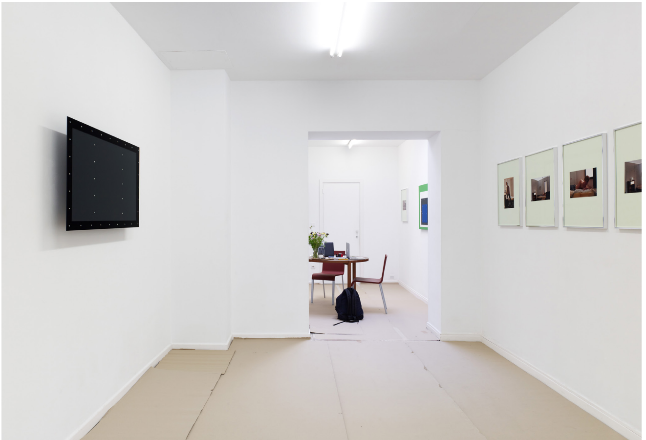
Emanuele Marcuccio SEP 21 Installation view 2021