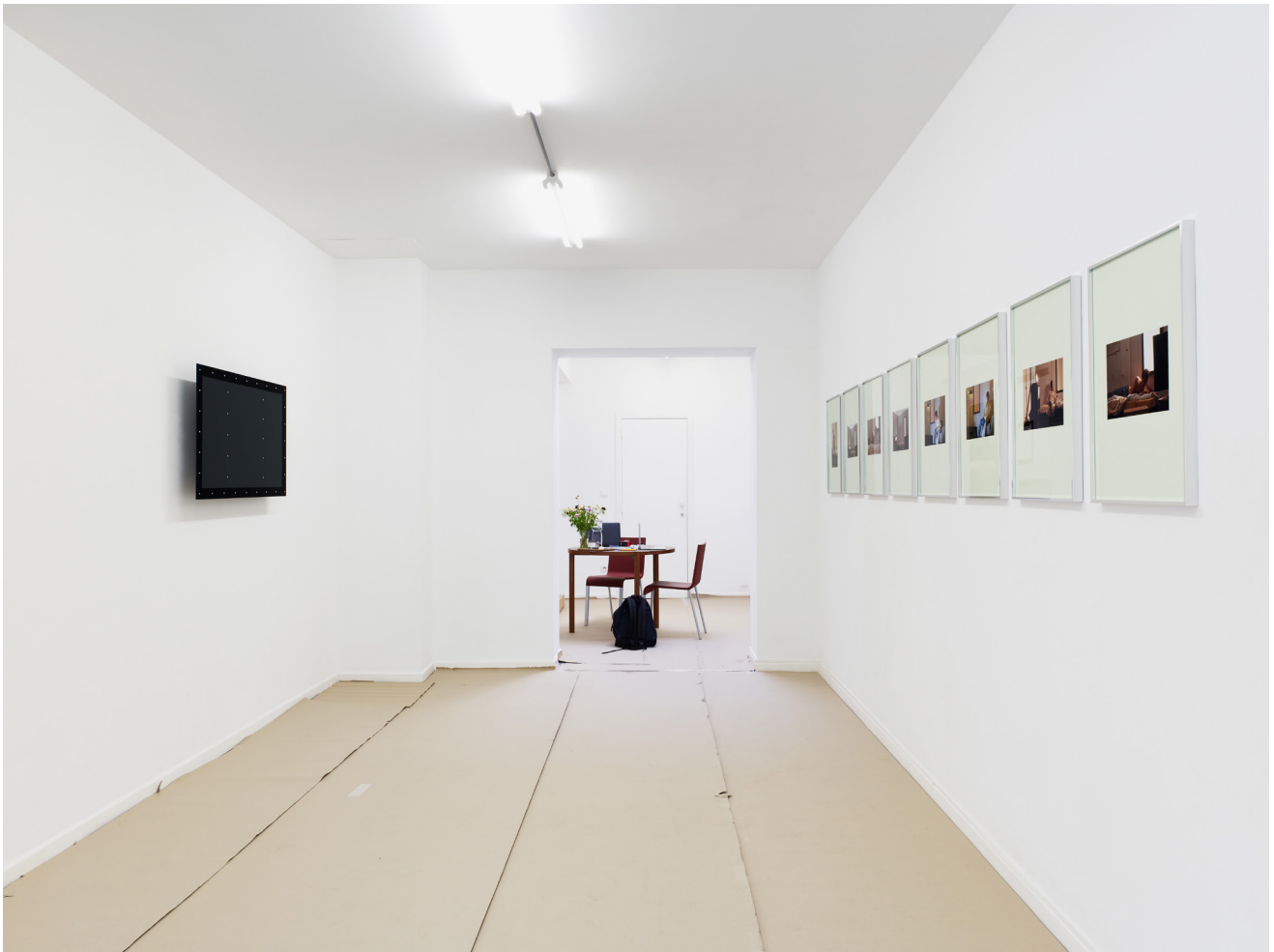
Emanuele Marcuccio SEP 21 Installation view 2021