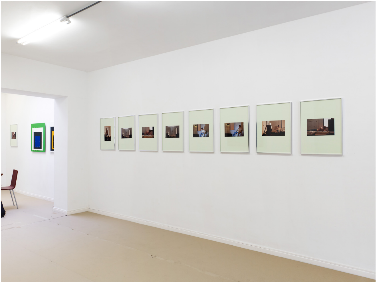
Emanuele Marcuccio SEP 21 Installation view 2021