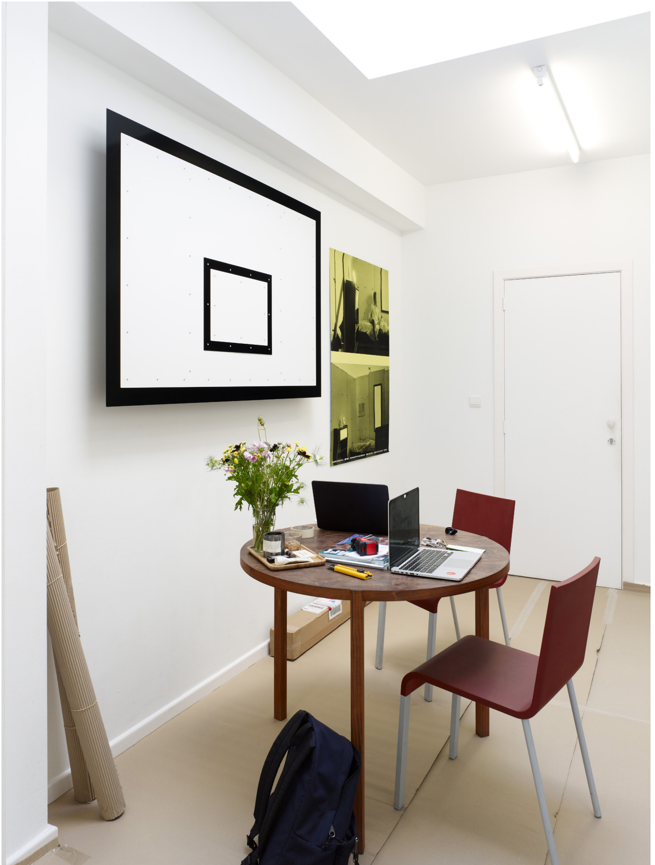
Emanuele Marcuccio SEP 21 Installation view 2021