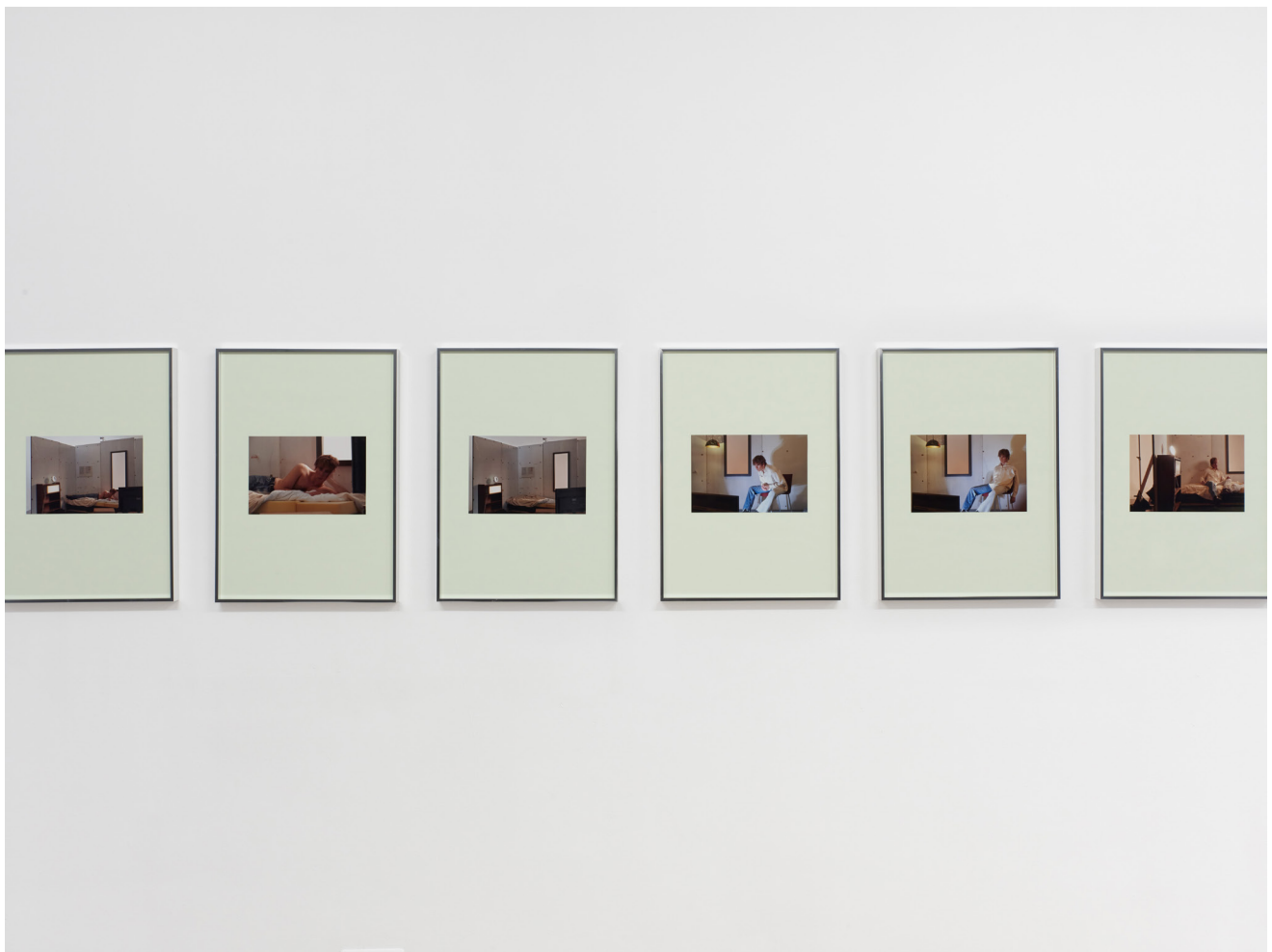
Emanuele Marcuccio SEP 21 Installation view 2021