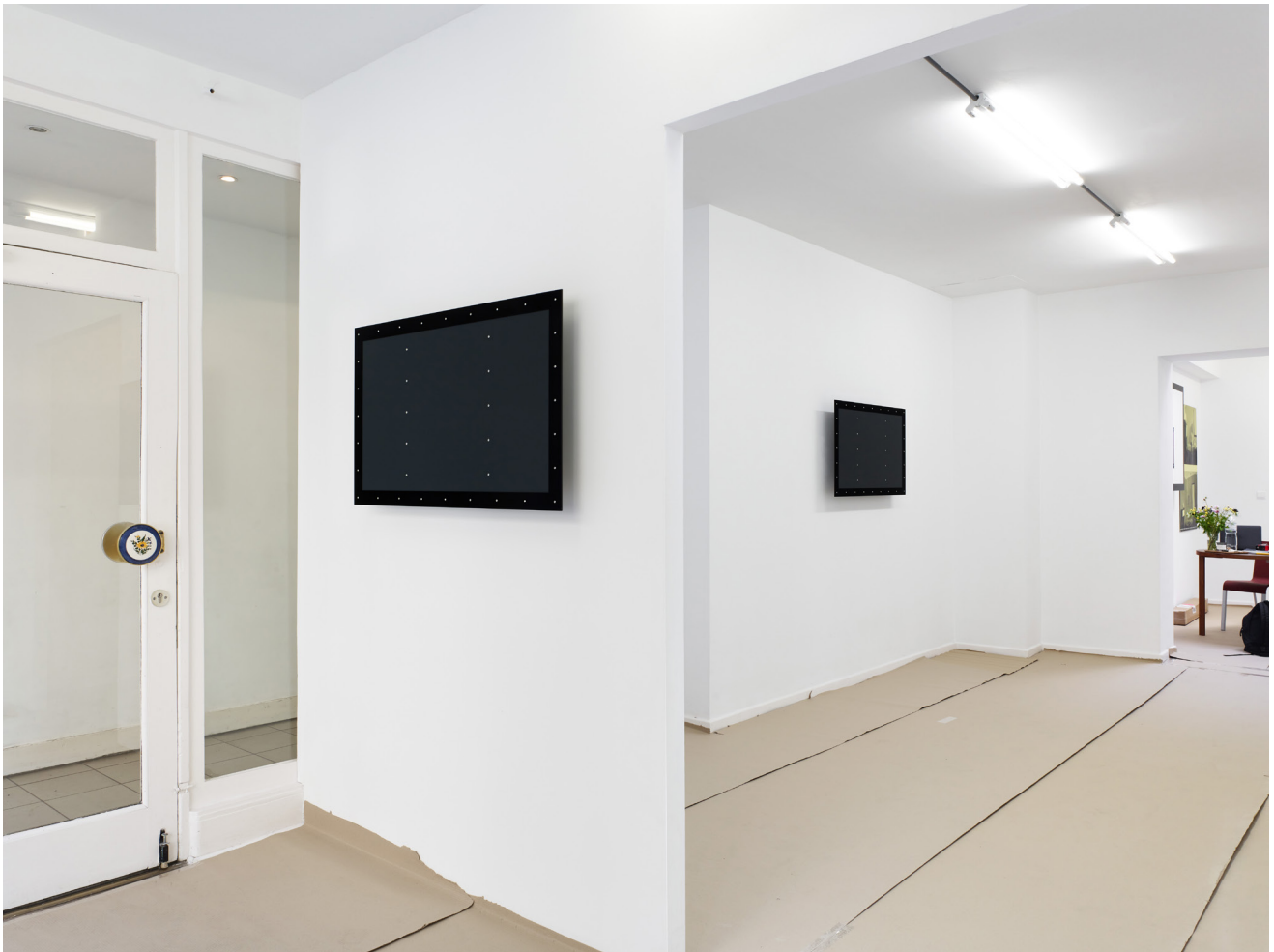
Emanuele Marcuccio SEP 21 Installation view 2021