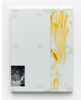
Win McCarthy "Untitled (My Own Head)" 2021 paper, laser prints, tape, c-print, construction adhesive, wood glue, and glass 24 x 18.1 in / 61 x 46 cm