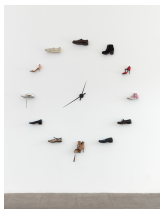
Morag Keil "Clock III" 2021 mixed media 93 diameter x 5 in / 210 x 160 cm