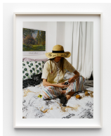
Bernadette Van-Huy "Do not Disturb" 2020 digital print, framed edition of 2, 1 AP 21.5 x 16.6 in / 54.6 x 42.2 cm