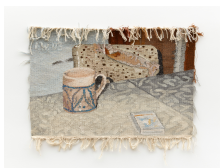
Ingrid Wiener "The Holy See of Whitehouse Cabins" 2003 wool, silk, and rayon tapestry 20.5 x 30.7 in / 52 x 78 cm