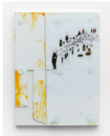
Win McCarthy "Collective Deadbolt" 2021 ink, paper, laser prints, tape, c-print, construction adhesive, wood glue, and glass 24 x 18.1 in / 61 x 46 cm