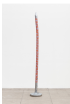
Matthew Langan-Peck "the dunkinesque" 2021 wood, epoxy, metal, enamel, acrylic, and vinyl paint 72 x 10 x 10 in / 182.88 x 25.4 x 25.4cm