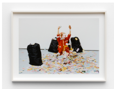
Bernadette Van-Huy "Monopoly Win" 2018 digital print, framed edition of 2, 1 AP 16.6 x 22.3 in / 42.2 x 56.8 cm