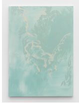
Genoveva Filipovic "parallel perspective" 2021 oil on canvas 55.1 x 39.4 in / 140 x 100 cm