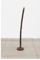
Matthew Langan-Peck "WTLA 1" 2021 wood, epoxy, metal, iron oxide, acrylic and vinyl paint 31 x 5 x 5 in / 78 x 12.7 x 12.7cm