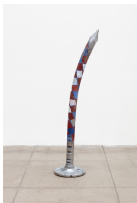
Matthew Langan-Peck "Clowneries 2" 2021 wood, epoxy, metal, enamel, acrylic and vinyl paint 40 x 9 x 9 in / 101.6 x 22.86 x 22.86 cm