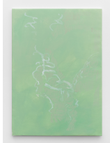
Genoveva Filipovic "parallel perspective" 2021 oil on canvas 55.1 x 39.4 in / 140 x 100 cm