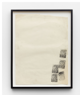
Andy Warhol "Tom Courtenay" 1962 silkscreen on paper 23.25 x 17.9 in / 60.3 x 45.4 cm