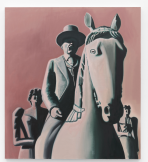
Lise Soskolne "Wooldridge Monuments" 2021 oil on canvas 60 x 54 in / 152.4 x 137.16 cm