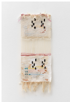
Ingrid Wiener "Buchstabe E" 2012 wool, silk, and rayon tapestry 23.62 x 12.6 in / 60 x 32 cm