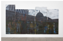
Richard Maxwell Untitled 2021 Oil, acrylic, and charcoal on canvas 4 panels: 118 x 37 in / 198.1 x 93.8 cm 100 x 78 in / 254 x 198.1 cm 110 x 46 in / 279.4 x 116.8 cm 102 x 46 in / 259.1 x 116.8 cm