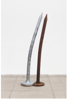
Matthew Langan-Peck "WTLA 2" 2021 wood, epoxy, metal, iron oxide, acrylic and vinyl paint 48 x 15.5 x 9 in / 105.8 x 34.2 x 19.8 cm