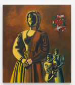
Lise Soskolne "Wooldridge Monuments, True To My Love" 2021 oil on canvas 64 x 56 in / 162.56 x 142.24 cm