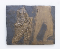
Sarah Peters The Giant , 2021 Glazed ceramic 13 x 11 inches (33 x 27.9 cm) SP005