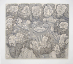
José Lerma Last Supper (Black) , 2016 Acrylic on canvas 68 x 78 inches (172.7 x 198.1 cm) JL004