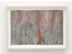
Robyn O'Neil The Occasional Witness , 2014 Graphite and oil pastel/paper 10.75 x 15.25 inches (27.3 x 38.7 cm) 001