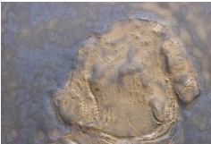
Sarah Peters Herm and Seated Torso , 2021 glazed ceramic 13 x 11 inches (33 x 27.9 cm) SP004