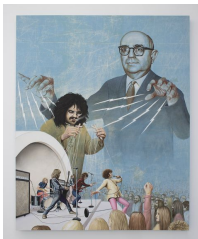
Jim Shaw Alt Right Myths #3, Frankfurt Schoolhouse Rocks! , 2020 acrylic on muslin 50 x 40 inches (127 x 101.6 cm) 001