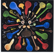
William Villalongo A Seed Is A Star , 2020 cut velour paper and pigment collage 19 x 19 inches (48.3 x 48.3 cm) WV004