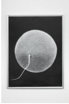
Juan Antonio Olivares Untitled (fertilization) , 2021 Graphite on paper 127.4 × 96.5 × 3 cm D 8723/U