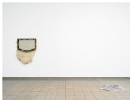
Bri_Williams_Kunsthhaus_Glarus_1 Bri_Williams_Kunsthhaus_Glarus_2 Bri_Williams_Kunsthhaus_Glarus_5 Bri_Williams_Kunsthhaus_Glarus_7 Bri_Williams_Kunsthhaus_Glarus_8

Bri Williams, Angel Abra , Ausstellungsansicht, Kunsthhaus Glarus, 2021. Bri Williams, Angel Abra , installation view, Kunsthhaus Glarus, 2021.