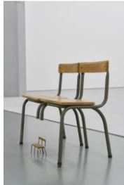
家庭 Family 2020 木, 铁, 天然橡胶, 聚丙烯, 合成树脂漆, 丙烯釉 wood, iron, natural rubber, PP, synthetic resin varnish, acrylic paint 72(H)×74×47 cm, 12(H)×13×7.3 cm