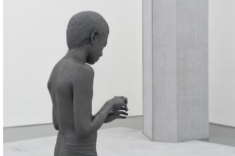
小男孩 Asian Boy 2019-2020 不锈钢 stainless steel 140(H)×40×45 cm, 55(H)×45×4 cm