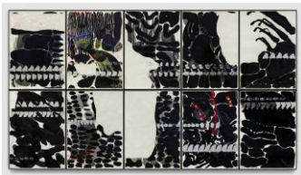
口腔计划 - 我们所创造的一切都不是我们自己 19-10-1 Everything We Create Is Not Ourselves 19-10-1 2019 炭笔, 铅笔, 彩铅, 油彩棒, 日本墨, C-Print, 无酸油性笔, 无 酸胶, 纸本 charcoal, pencil, colored pencil, oil stick, Japanese ink, C-Print, acid-free oil-based marker, acid-free glue on paper 140×100 cm ×10 装裱尺寸 framed dimensions: 144.6×104.6 cm ×10