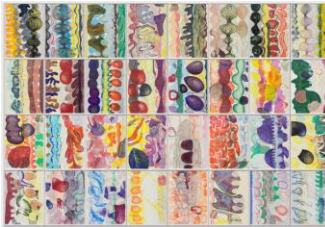
硬腭 32-1 Hard Palate 32-1

装裱尺寸 framed dimensions: 144.6×104.6 cm ×18