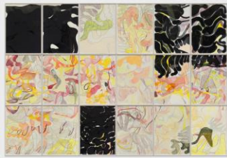
软腭 18-1 Soft Palate 18-1

装裱尺寸 framed dimensions: 157.2×109.7 cm ×20