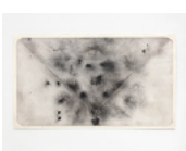
TSCOTO_15 2009 Acrylic on paper mounted on paper 3.125 x 5.125 x .0625 inches