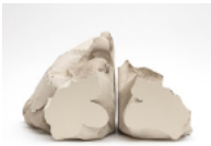
TSCOTO_02 2016 -2021 Acrylic on expansion foam 14.5 x 11.5 x 8 inches