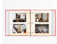
TSCOTO_17 2011- 2021 Photographs, found photo albums 11.5 x 22.5 x 1.75 inches