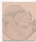
Fulcrum 2021 Acrylic on panel 18 x 16 x .5 inches