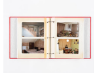
TSCOTO_17 2011- 2021 Photographs, found photo albums 11.5 x 22.5 x 1.75 inches