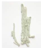
TSCOTO_12 2021 Acrylic 8.25 x 4.25 x .5 inches