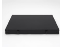
TSCOTO_04 2021 Acrylic on wood, hardware 18 x 26 x 3 inches