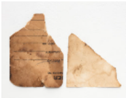
TSCOTO_16 2001 - 2021 Found paper 3 x 4.25 inches overall