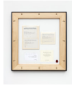
TSCOTO_06 2021 Wood, coroplast, acrylic, labels, screws 18 x 16 x 1.25 inches