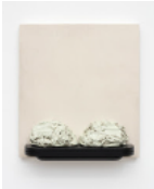
TSCOTO_23 2016 - 2021 Acrylic, epoxy clay, wood, MDF 18 x 16 x 4.5 inches