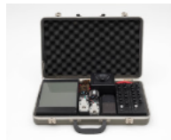
TSCOTO_07 2015 - 2021 Briefcase, foam, 3.5mm aux cables, plexiglass, potentiometer knobs, GE Pocket phone, Piezo tweeter 20 x 17 x 14 inches overall