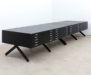
TSCOTO_24 2021 Acrylic on wood and MDF, drawer pulls, hardware 192 x 58 x 32 inches