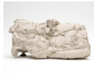
TSCOTO_13 2016 - 2021 Acrylic on expansion foam, wood, hydrocal 16.5 x 9 x 8 inches