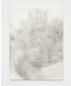
TSCOTO_14 2014 - 2021 Acrylic on rag board 9.75 x 7 x .0625 inches