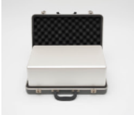
TSCOTO_25 2015 - 2021 Acrylic on wood, briefcase, foam 20 x 17 x 14 inches overall