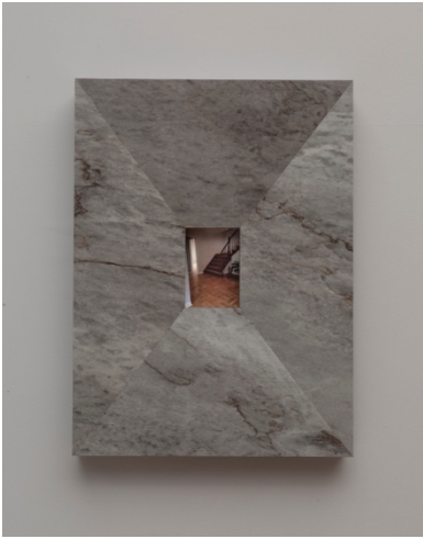
Libby Rothfeld , The Stairs , 2020.

Laminate, digital print, wood, 23 7/8 x 17 5/8 x 3 in. (60.64 x 44.77 x 7.62 cm)