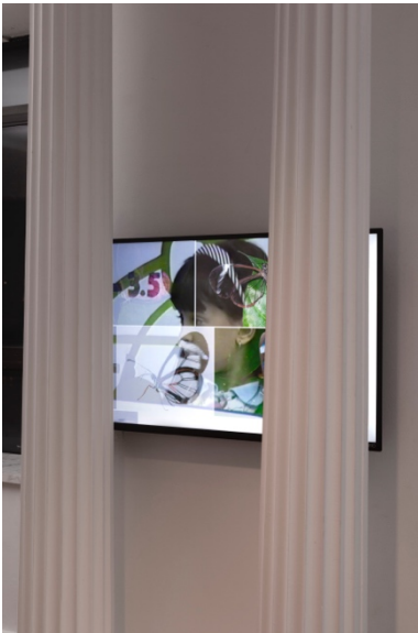
Alli Melanson , Ultimate Escape Artist , 2021.

Laminate, digital print, wood, 23 7/8 x 17 5/8 x 3 in. (60.64 x 44.77 x 7.62 cm)