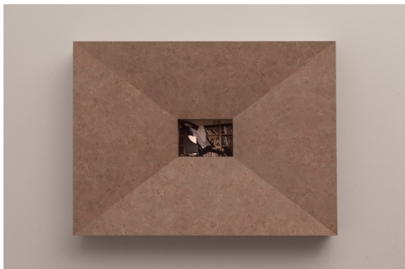
Libby Rothfeld , Word Search on the Elliptical (The Scoreboard) , 2020.

Laminate, digital print, wood. 17 5/8 x 23 7/8 x 3 in. (44.77 x 60.64 x 7.62 cm)