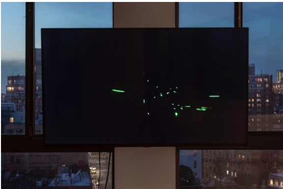
Vijay Masharani , Command / Plea , 2020. Single channel video, r/t, 4 min.