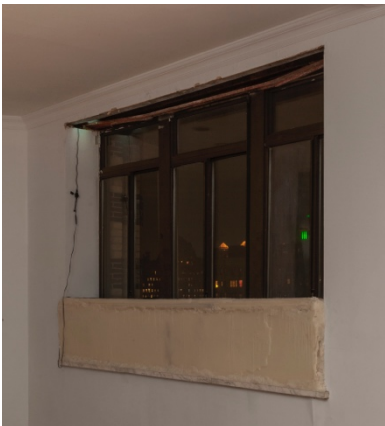
sgp , princex blank or: how I learned to love, 1.8 milliseconds at a time , 2021. Found wax, solar charging panel, hardware, software, wetware, borrowed iPad, video. Dimensions variable.