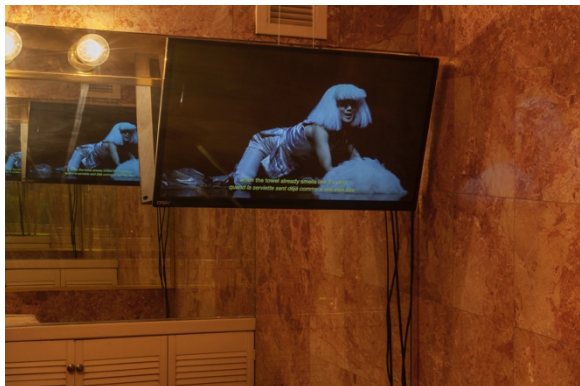
Ivan Cheng , Changing Room 4: EX-CURSES [Ouija DM] , 2020.