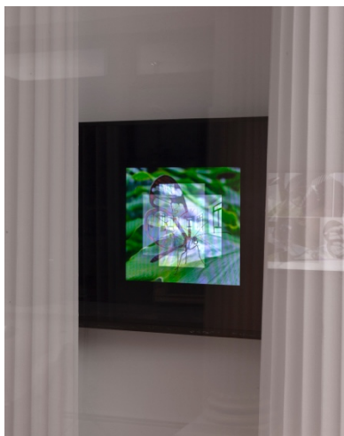
Alli Melanson , The Real Trick (ft. Lode, ft. Alyssa Davis Gallery) , 2021.

Laminate, digital print, wood. 17 5/8 x 23 7/8 x 3 in. (44.77 x 60.64 x 7.62 cm)