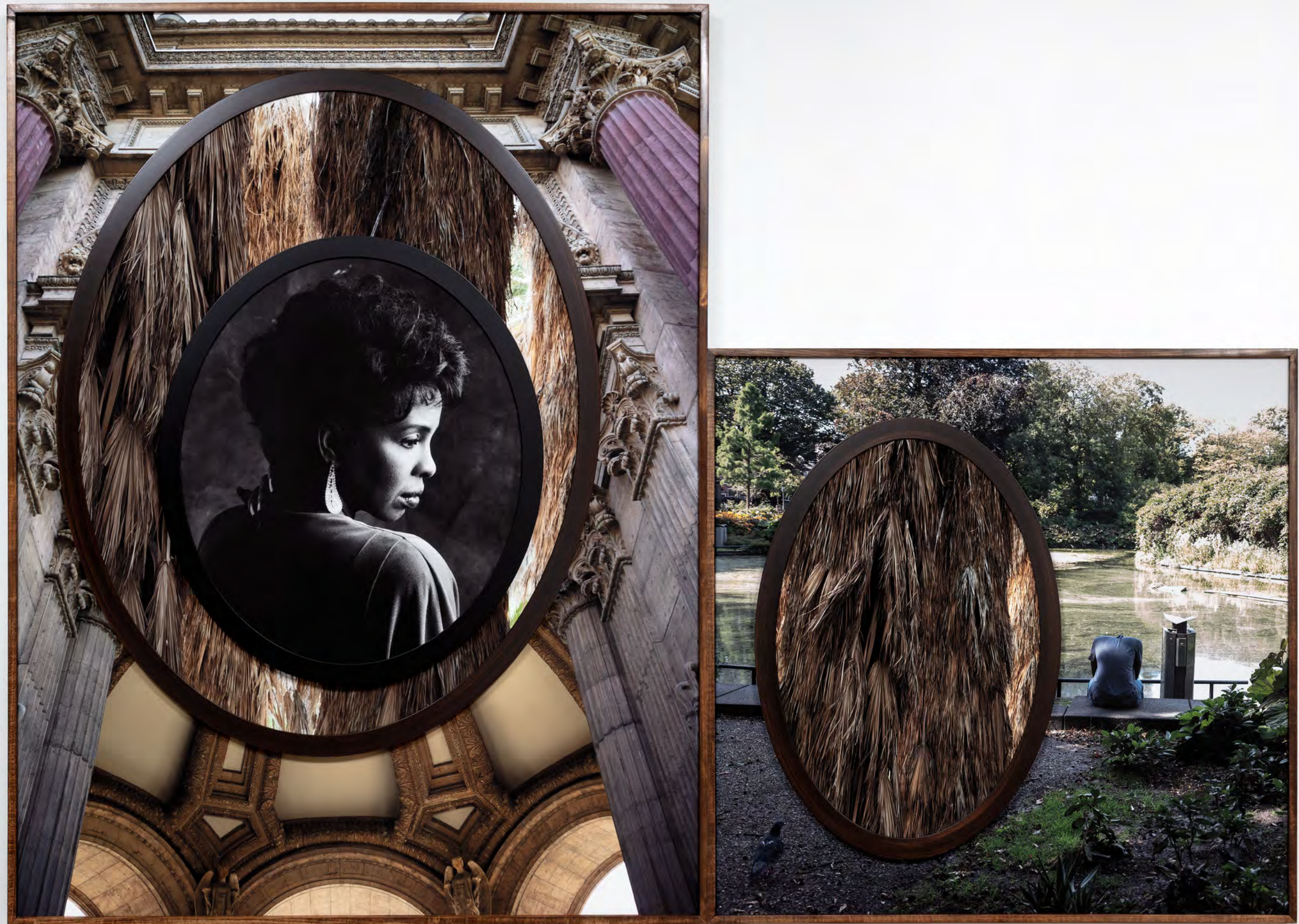
Todd Gray the hidden order of the whole , 2021 Five archival pigment prints in artist's frames, UV laminate 80 1/2 x 113 1/8 x 2 3/4 inches 204.5 x 287.3 x 7 cm GRATO219