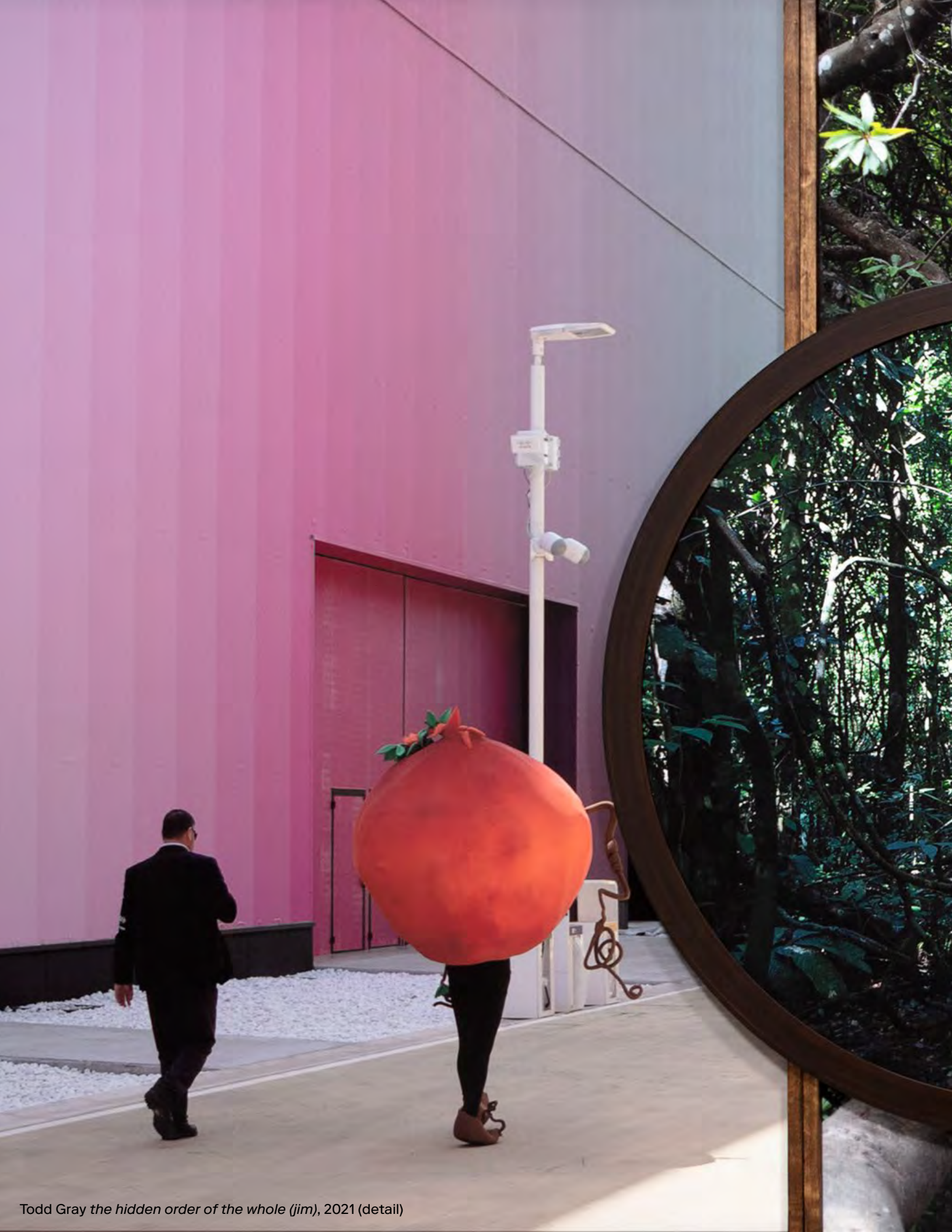
Todd Gray the hidden order of the whole (jim) , 2021 (detail)