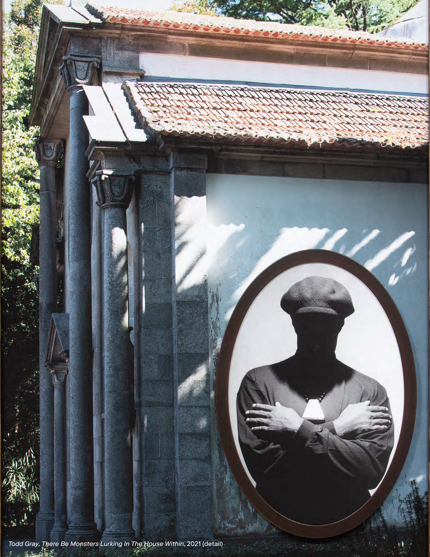
Todd Gray, There Be Monsters Lurking In The House Within , 2021 (detail)