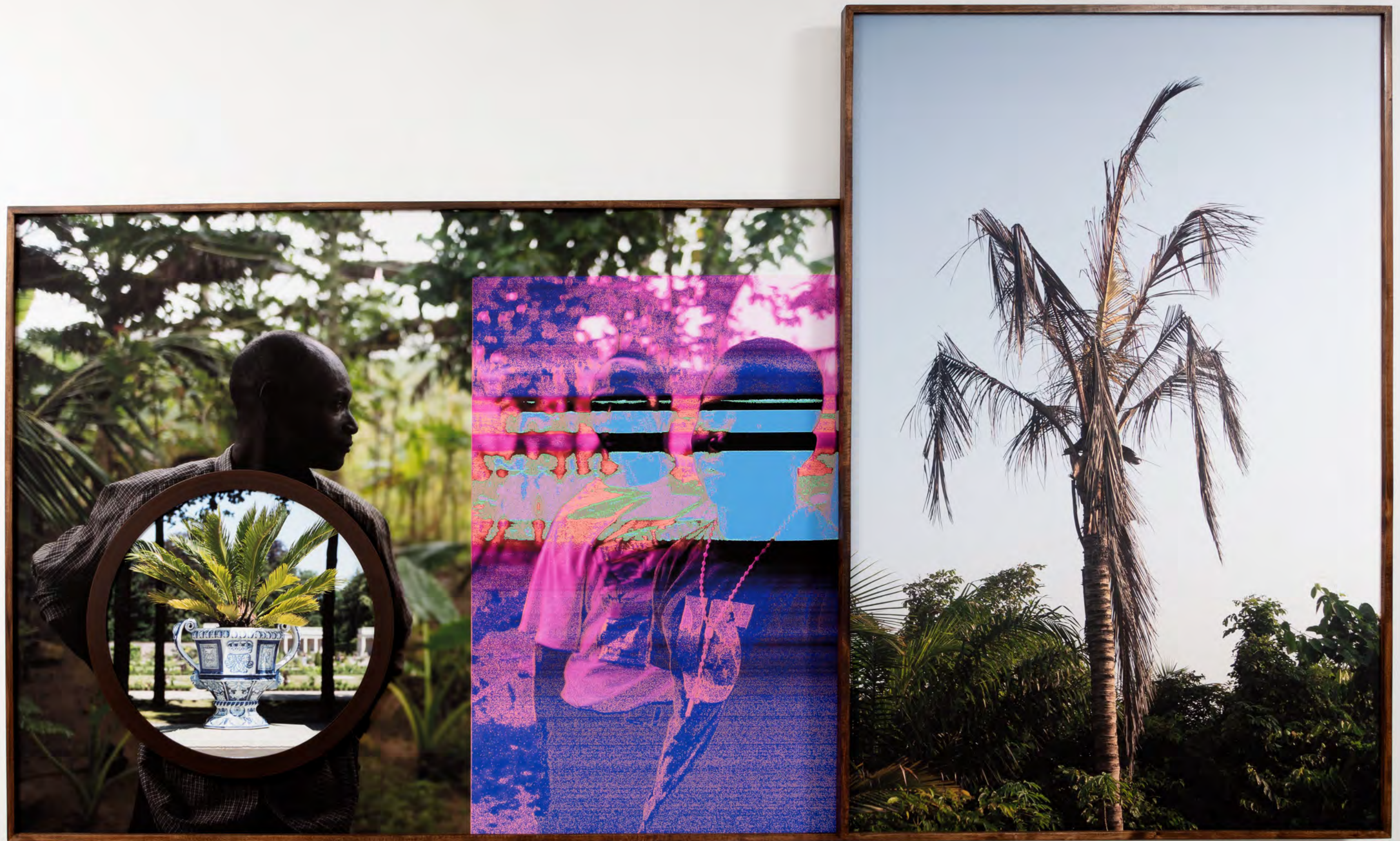
Todd Gray the hidden order of the whole (carpenter john) , 2021 Three archival pigment prints in artist's frames, UV laminate 60 3/4 x 132 x 4 inches 154.3 x 335.3 x 10.2 cm GRATO224