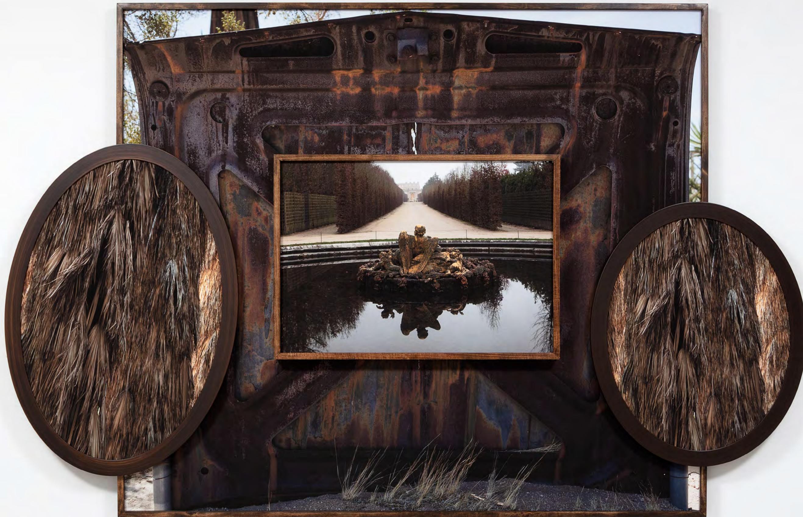
Todd Gray the hidden order of the whole (purifoy) , 2021 Four archival pigment prints in artist's frames, UV laminate 60 3/4 x 93 1/4 x 3 1/4 inches 154.3 x 236.9 x 8.3 cm GRATO220