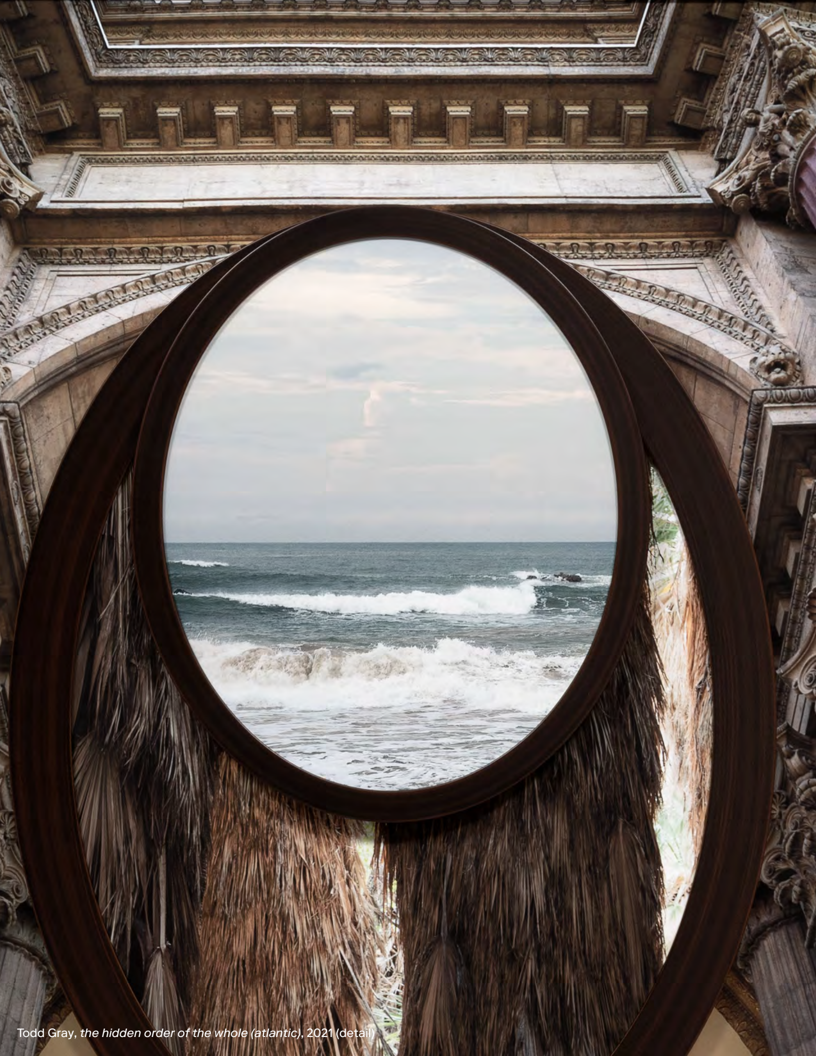
Todd Gray, the hidden order of the whole (atlantic) , 2021 (detail)