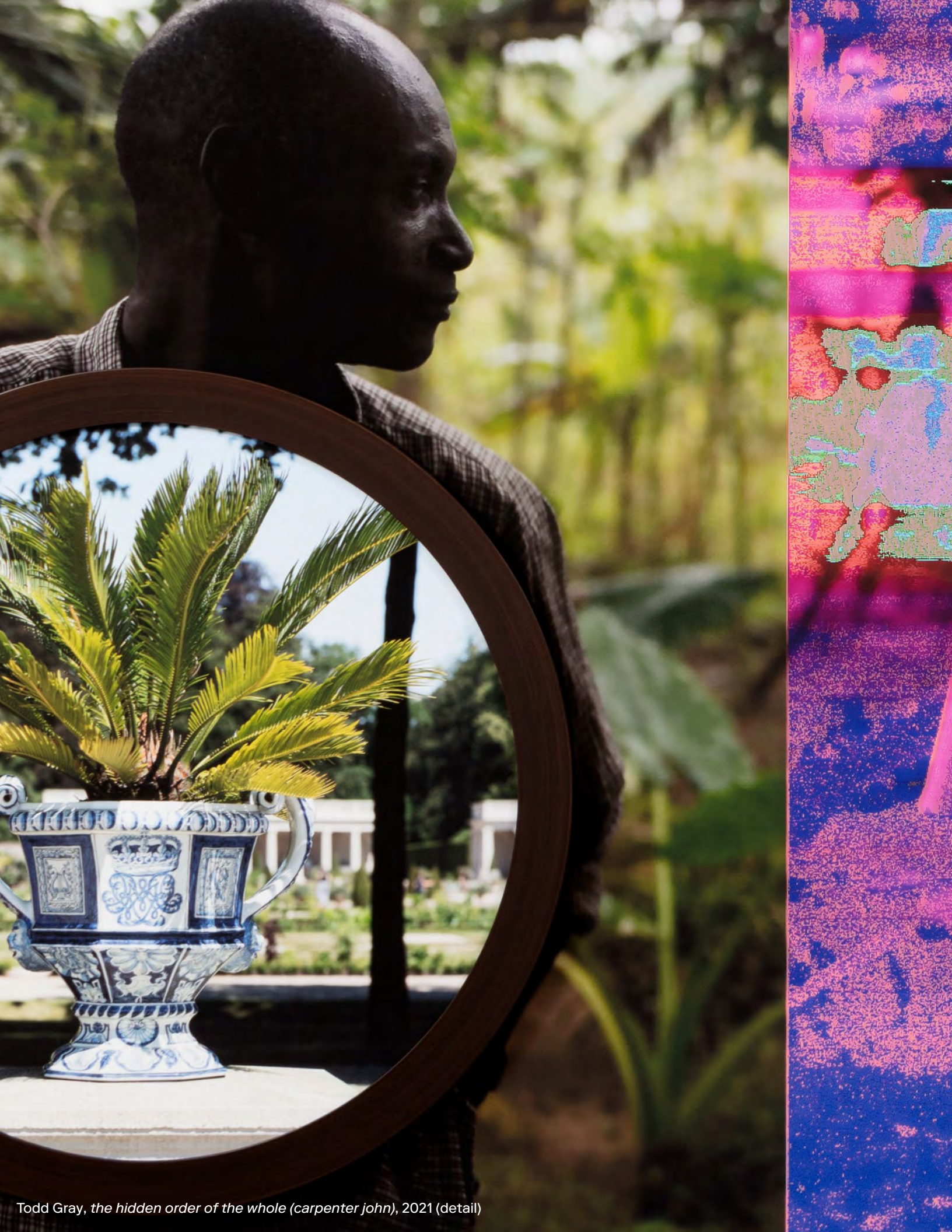
Todd Gray, the hidden order of the whole (carpenter john) , 2021 (detail)