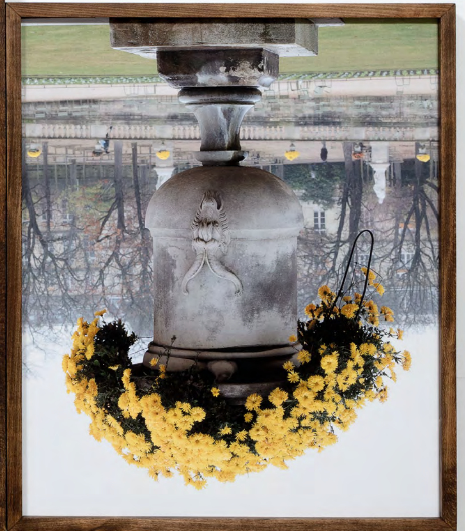
Todd Gray the hidden order of the whole (flowers : sails), 2021 Three archival pigment prints in artist's frames, UV laminate 51 x 58 1/8 x 2 1/8 inches 129.5 x 147.6 x 5.4 cm GRATO218