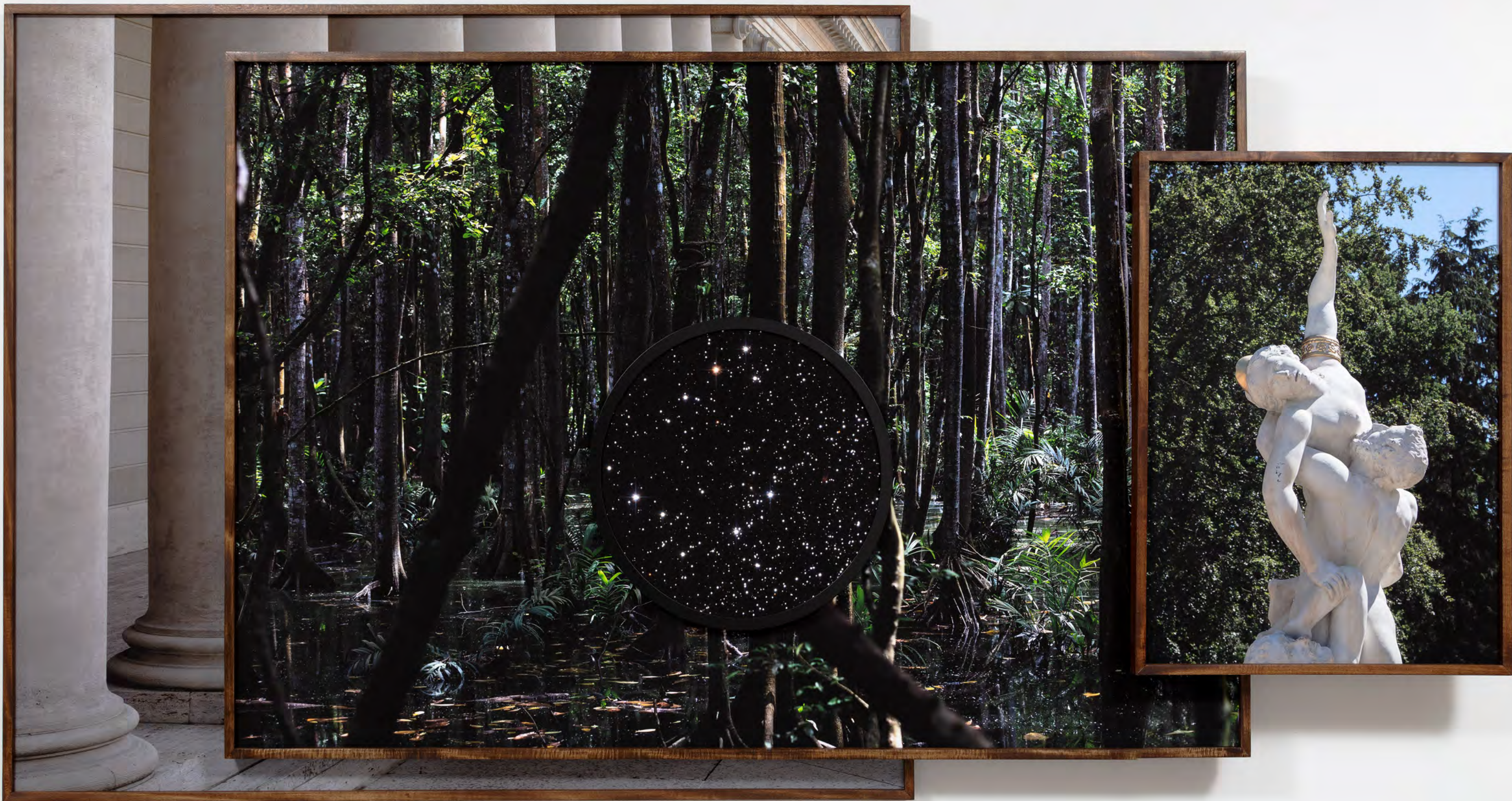
Todd Gray the hidden order of the whole (sabine), 2021 Four archival pigment prints in artist's frames, UV laminate 60 1/8 x 114 5/8 x 6 inches 152.7 x 291.1 x 15.2 cm GRATO221