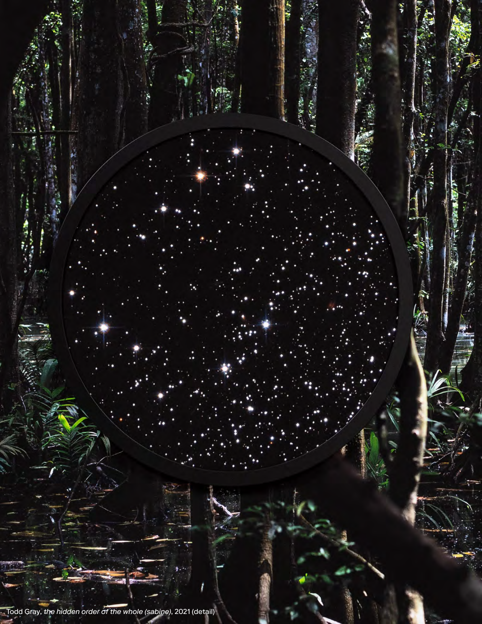
Todd Gray, the hidden order of the whole (sabine) , 2021 (detail)