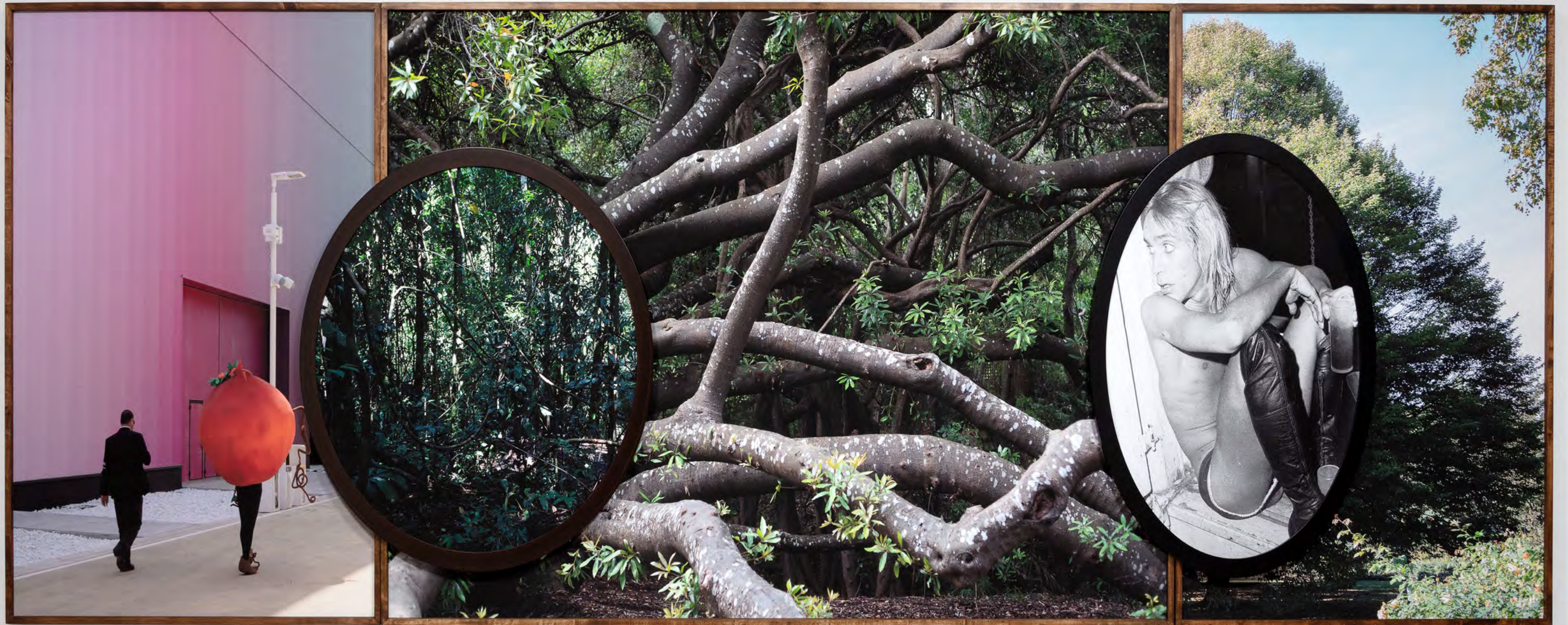
Todd Gray the hidden order of the whole (jim) , 2021 Five archival pigment prints in artist's frames, UV laminate 60 3/4 x 181 1/8 x 2 3/4 inches 154.3 x 460.1 x 7 cm GRATO225