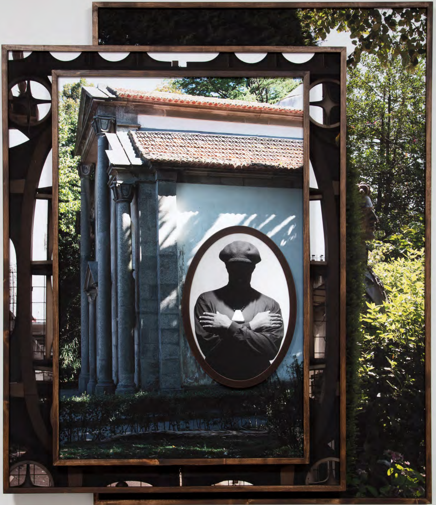
Todd Gray There Be Monsters Lurking In The House Within, 2021 Four archival pigment prints in artist's frames, UV laminate 66 1/2 x 56 1/4 x 6 1/2 inches 168.9 x 142.9 x 16.5 cm GRATO215