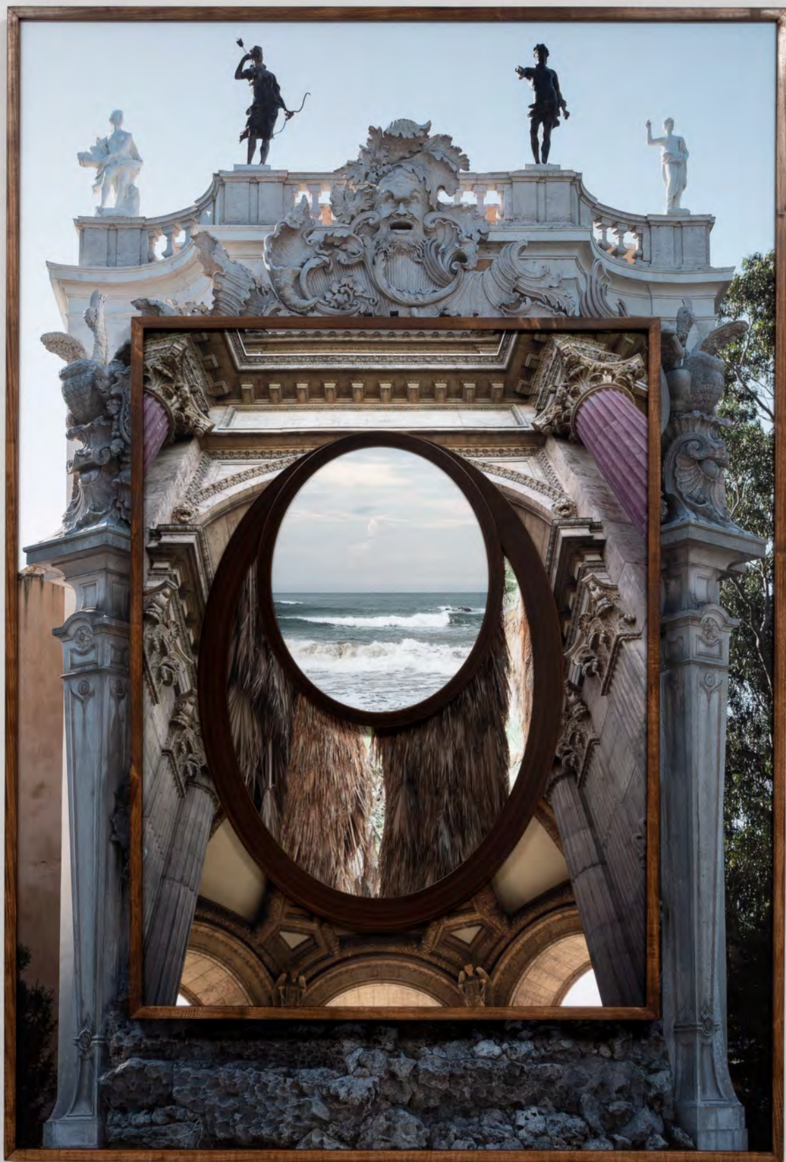
Todd Gray the hidden order of the whole (atlantic) , 2021 Four archival pigment prints in artist's frames, UV laminate 72 1/2 x 49 1/8 x 4 1/2 inches 184.2 x 124.8 x 11.4 cm GRATO223