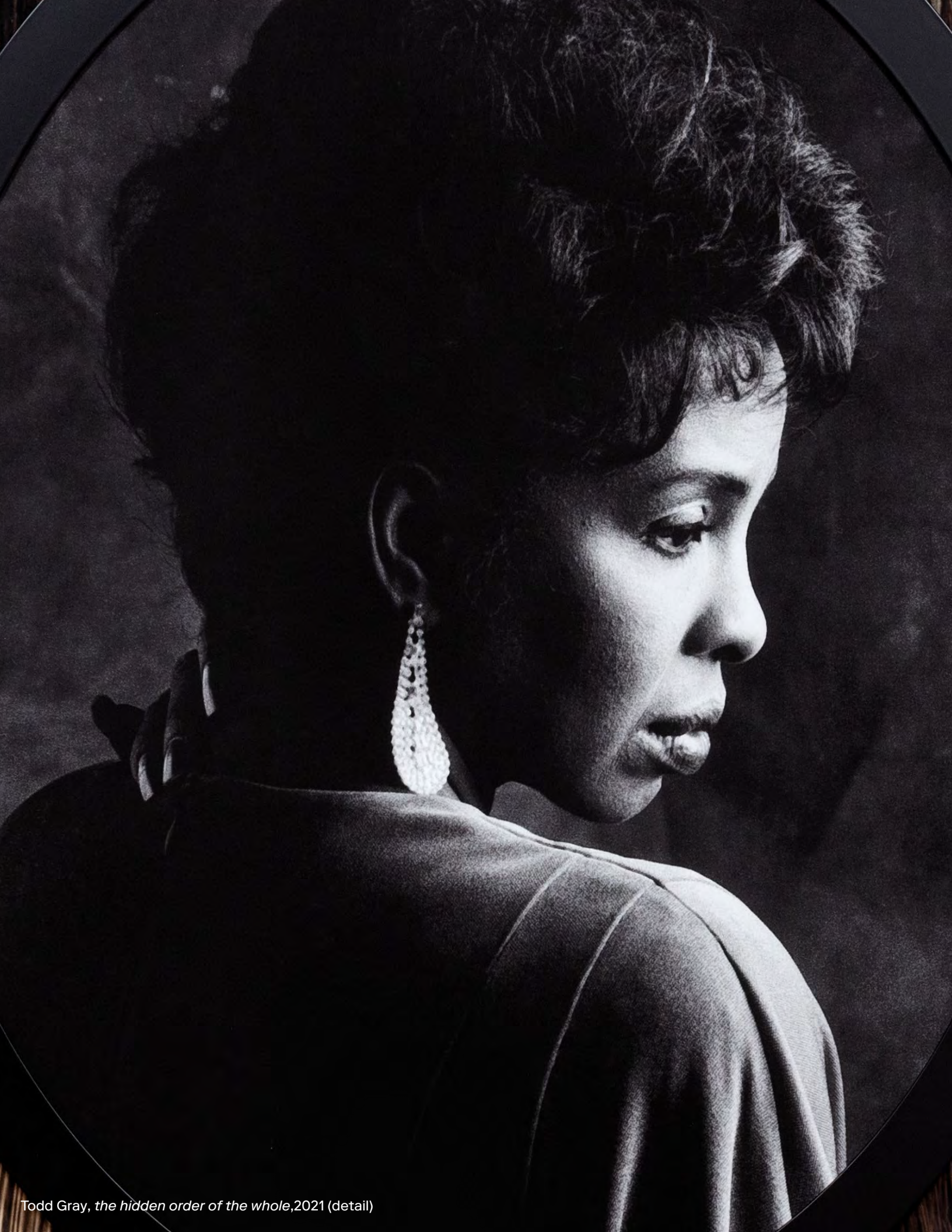
Todd Gray, the hidden order of the whole , 2021 (detail)