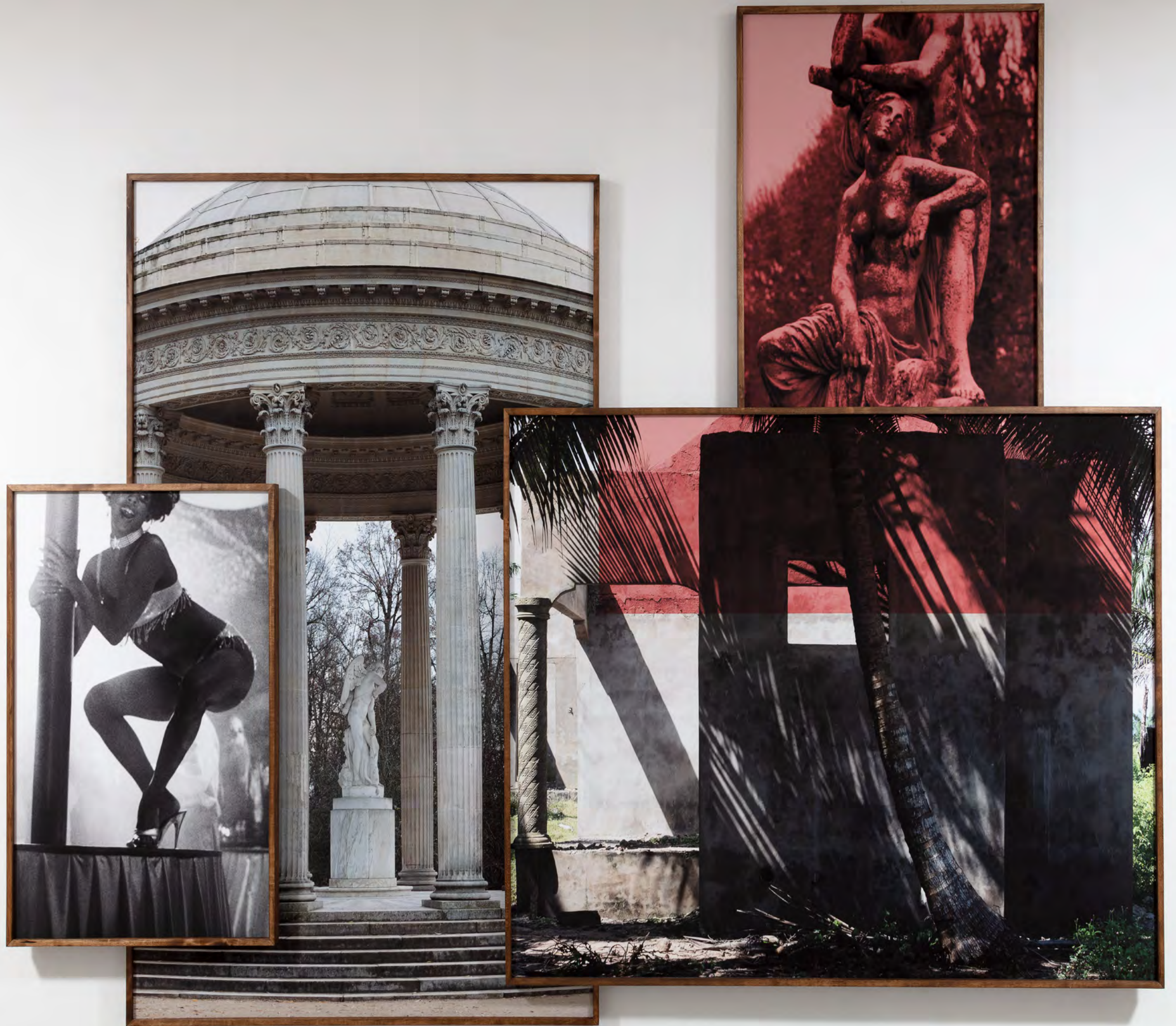
Todd Gray the hidden order of the whole (venus) , 2021 Four archival pigment prints in artist's frames, UV laminate 109 5/8 x 146 1/8 x 4 1/2 inches 278.4 x 371.2 x 11.4 cm GRATO226