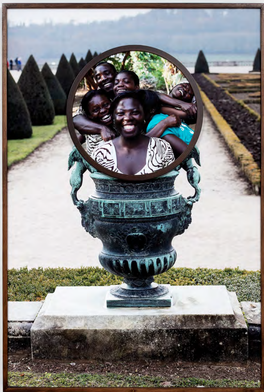
Todd Gray Akwidaa/Versailles , 2021 Two archival pigment prints in artist's frames, UV laminate 61 1/8 x 41 1/8 x 2 1/4 inches 155.3 x 104.5 x 5.7 cm GRATO197