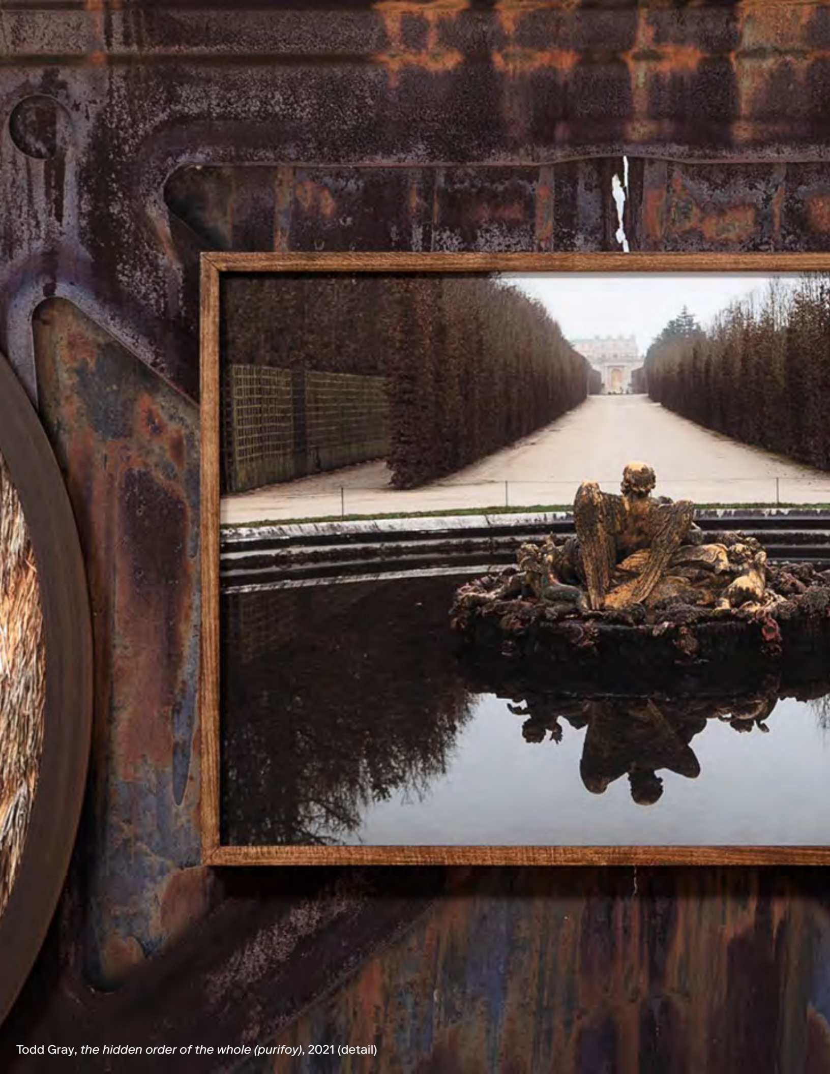
Todd Gray, the hidden order of the whole (purifoy) , 2021 (detail)