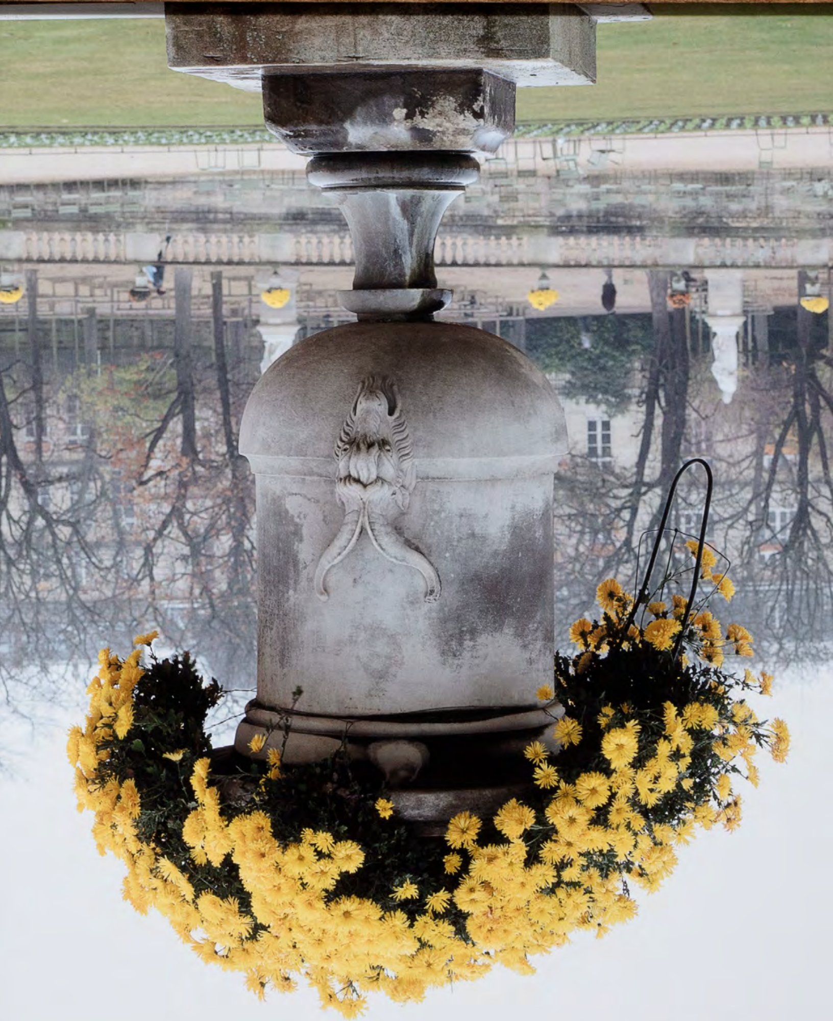
Todd Gray, the hidden order of the whole (flowers : sails) , 2021 (detail)