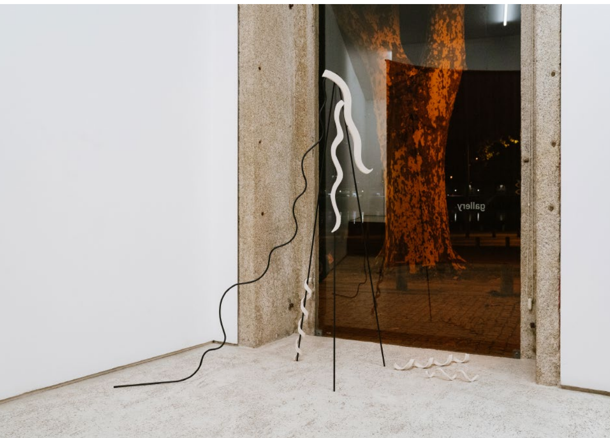
Prêt-à-porter #1, 2021 Aço e Cerâmica [Steel and Ceramics] 148 x 132 x 50 cm