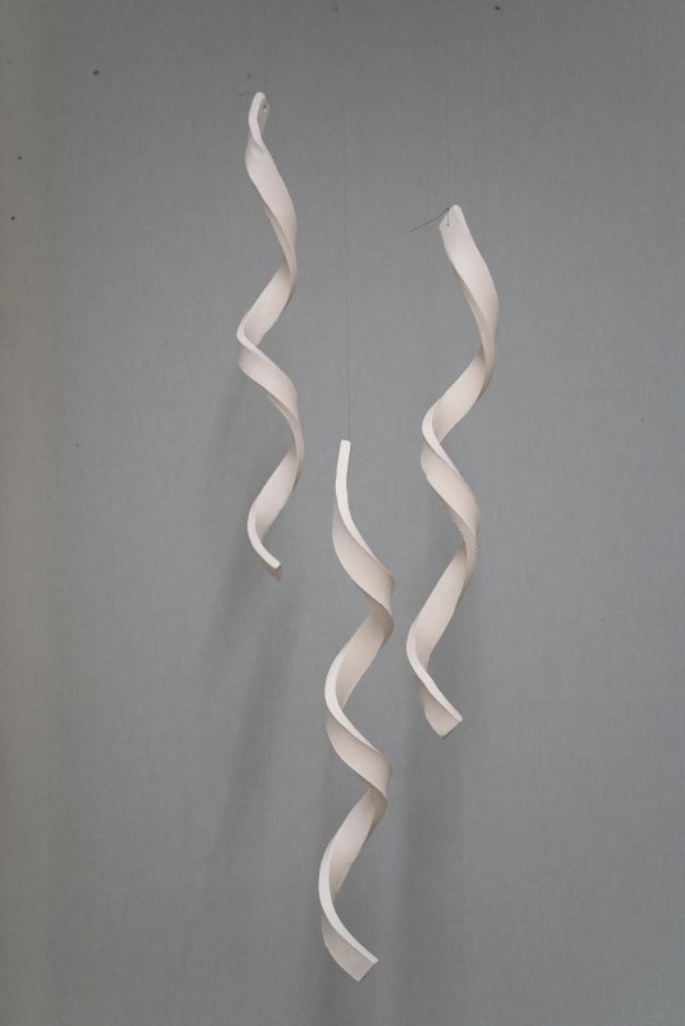
Babyliss sculpture, 2021 Cerâmica [Ceramics] 86 x 28 cm