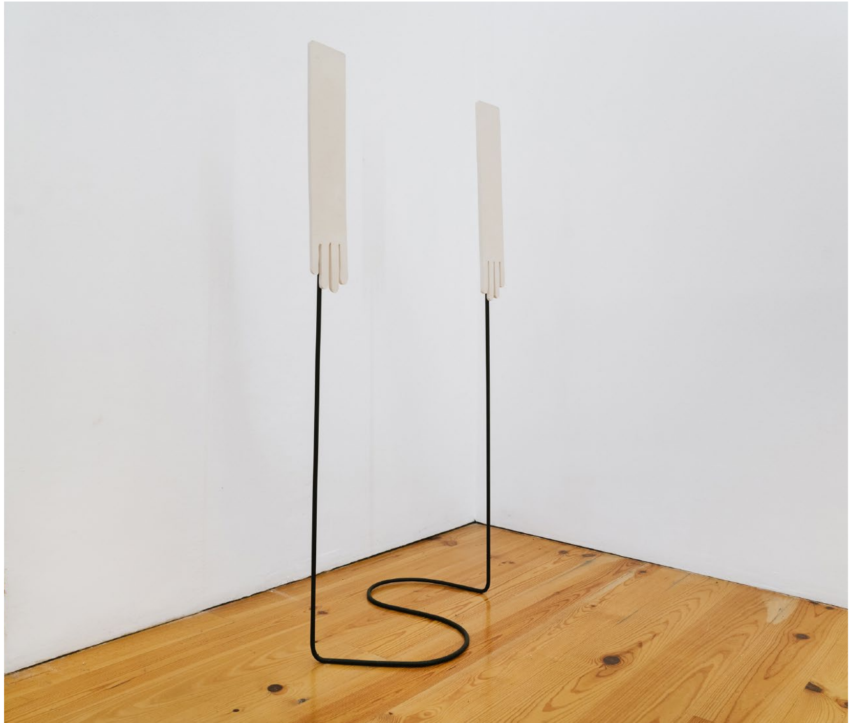
Prêt-à-porter #4, 2021 Aço e Cerâmica [Steel and Ceramics] 104,5 x 48 x 35 cm