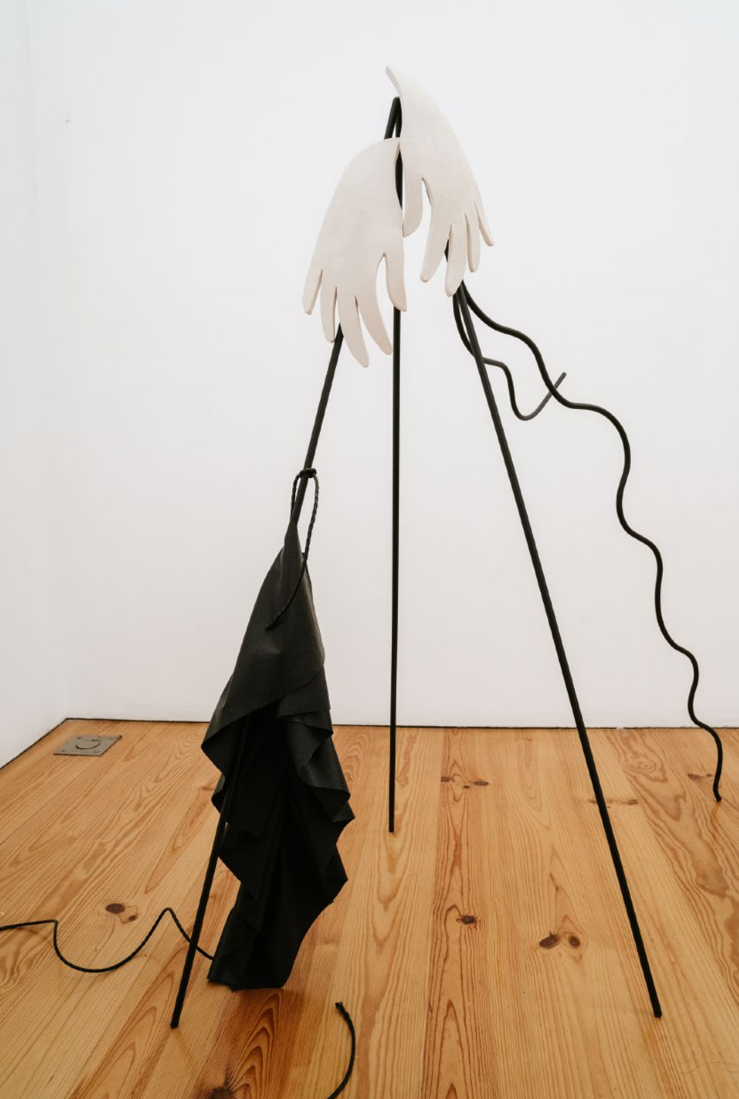
Prêt-à-porter #3, 2021 Aço, Cerâmica e Couro Sintético [Steel, Ceramics and synthetic leather] 97 x 85 x 31 cm