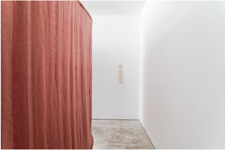
Curly, 2021 Cerâmica [Ceramics] 53 x 12 x 1,5 cm