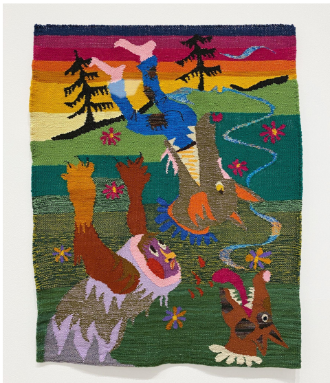
Christina Forrer, Untitled (Wolves) , 2020 48 x 36 inches