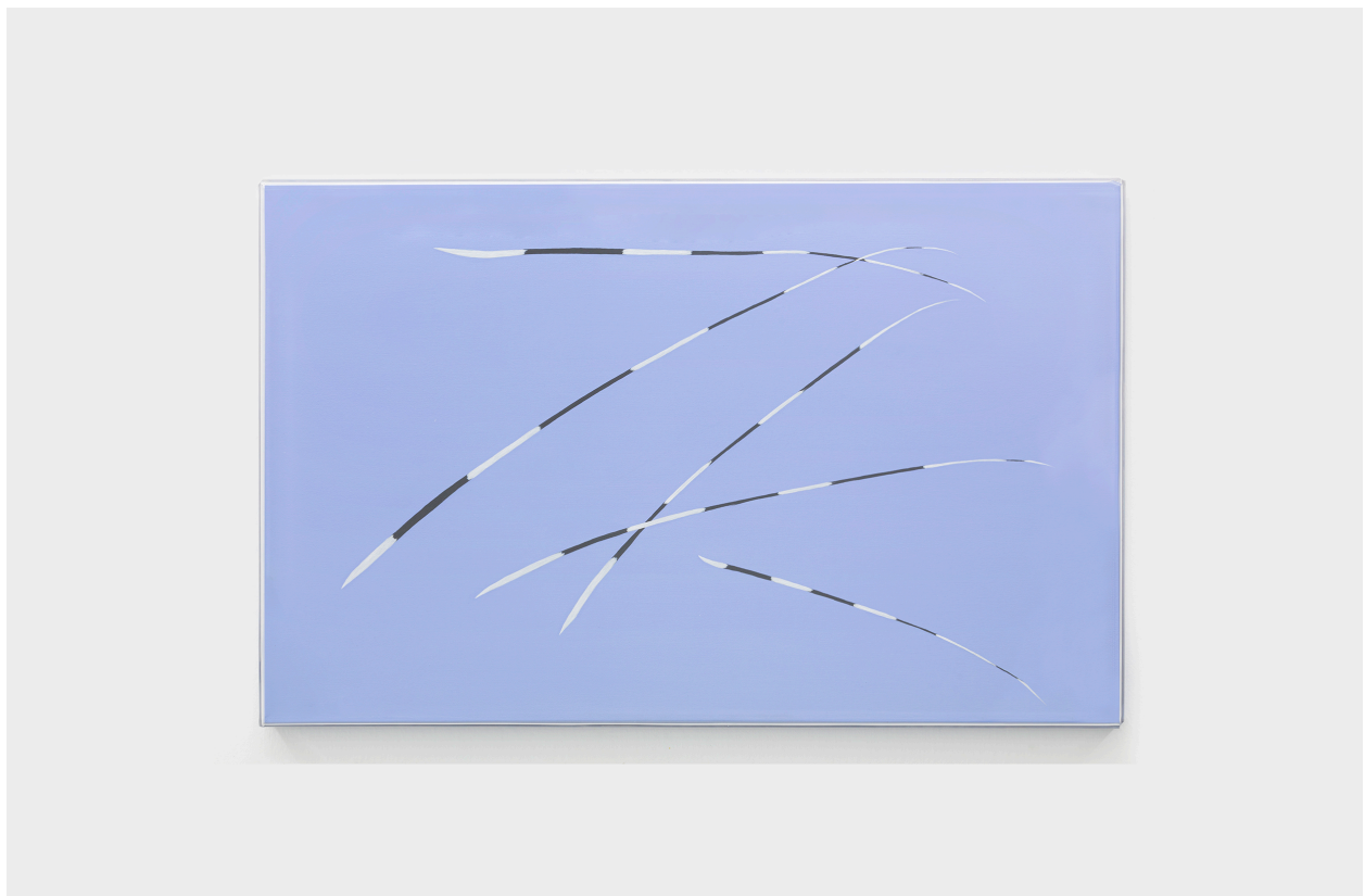
Giacomo Montanelli, Cinque Aculei, 2021, Acrylic on Canvas, 50x80 cm