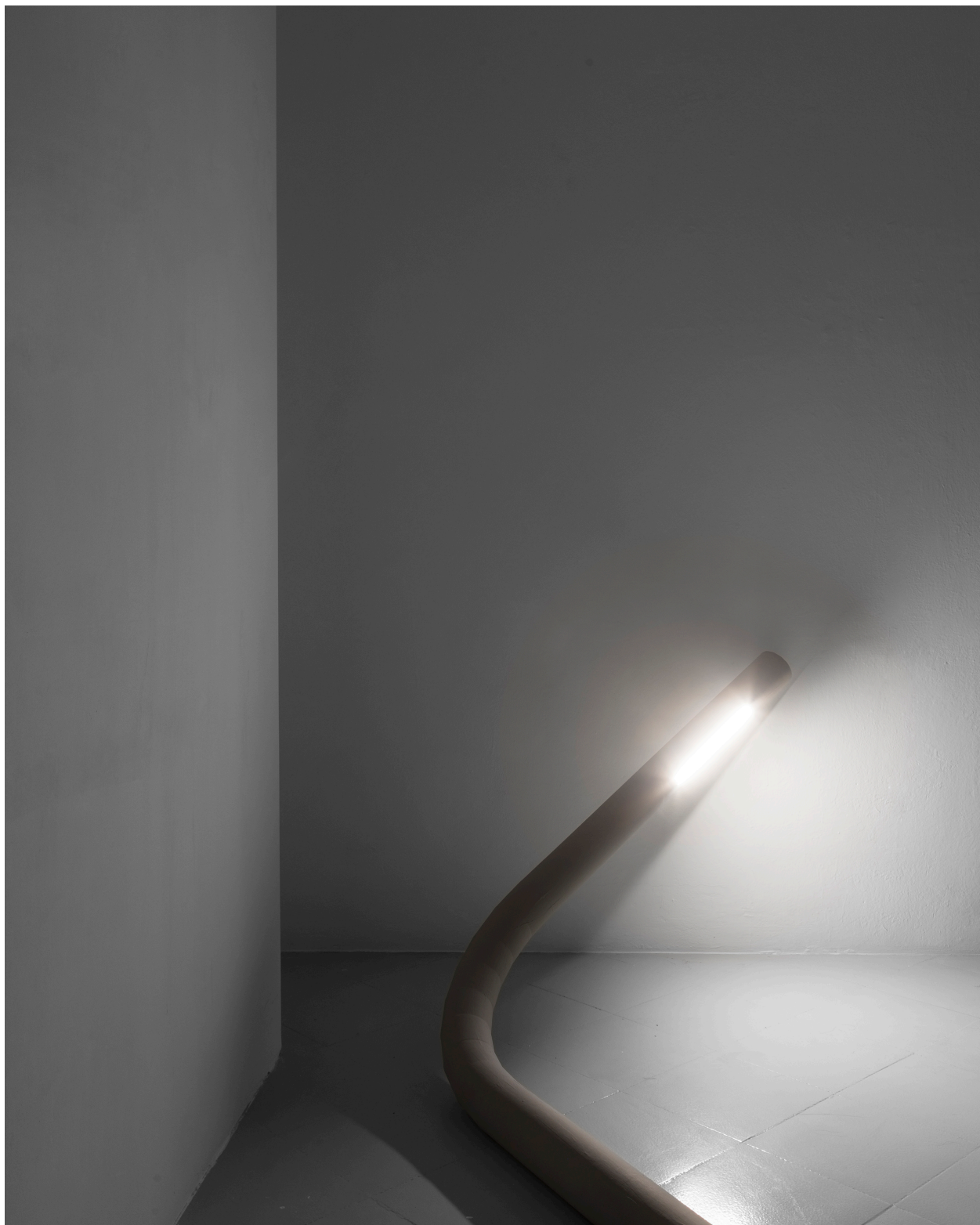
Lampione (detail), 2021, Cardboard, Acrylic, Vinavil, Electric Cable, LED, 850x10x10 cm