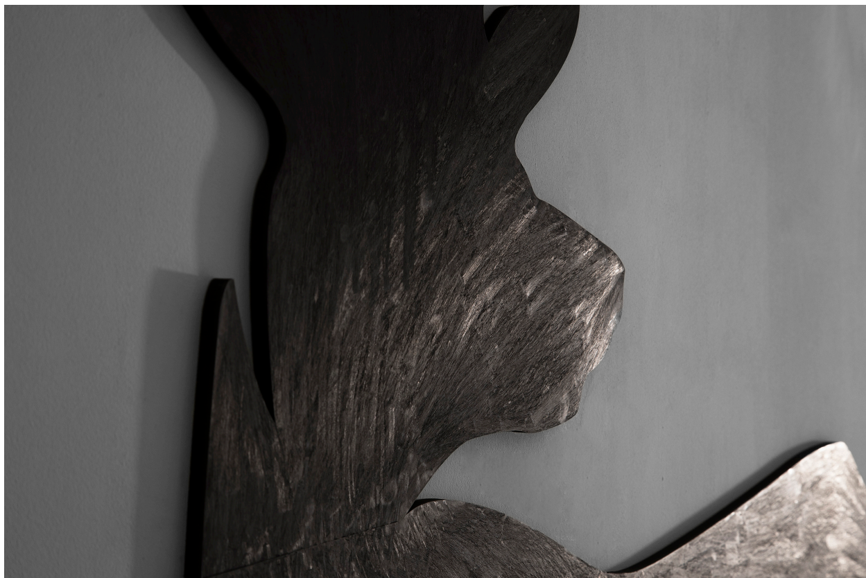
Cervo, 2021, mdf and charcoal, 200x180 cm