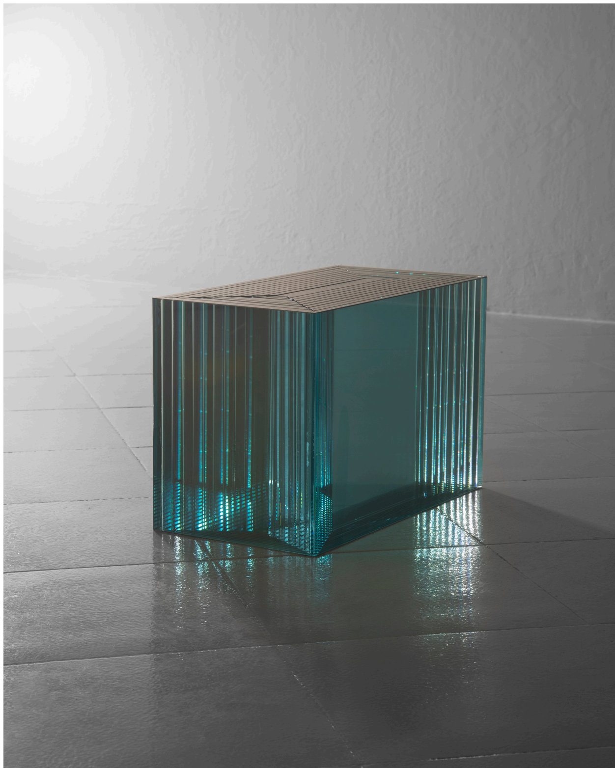
Guarda come sono telegenico mentre mi schianto, 2021, Glass, 40x21x26 cm