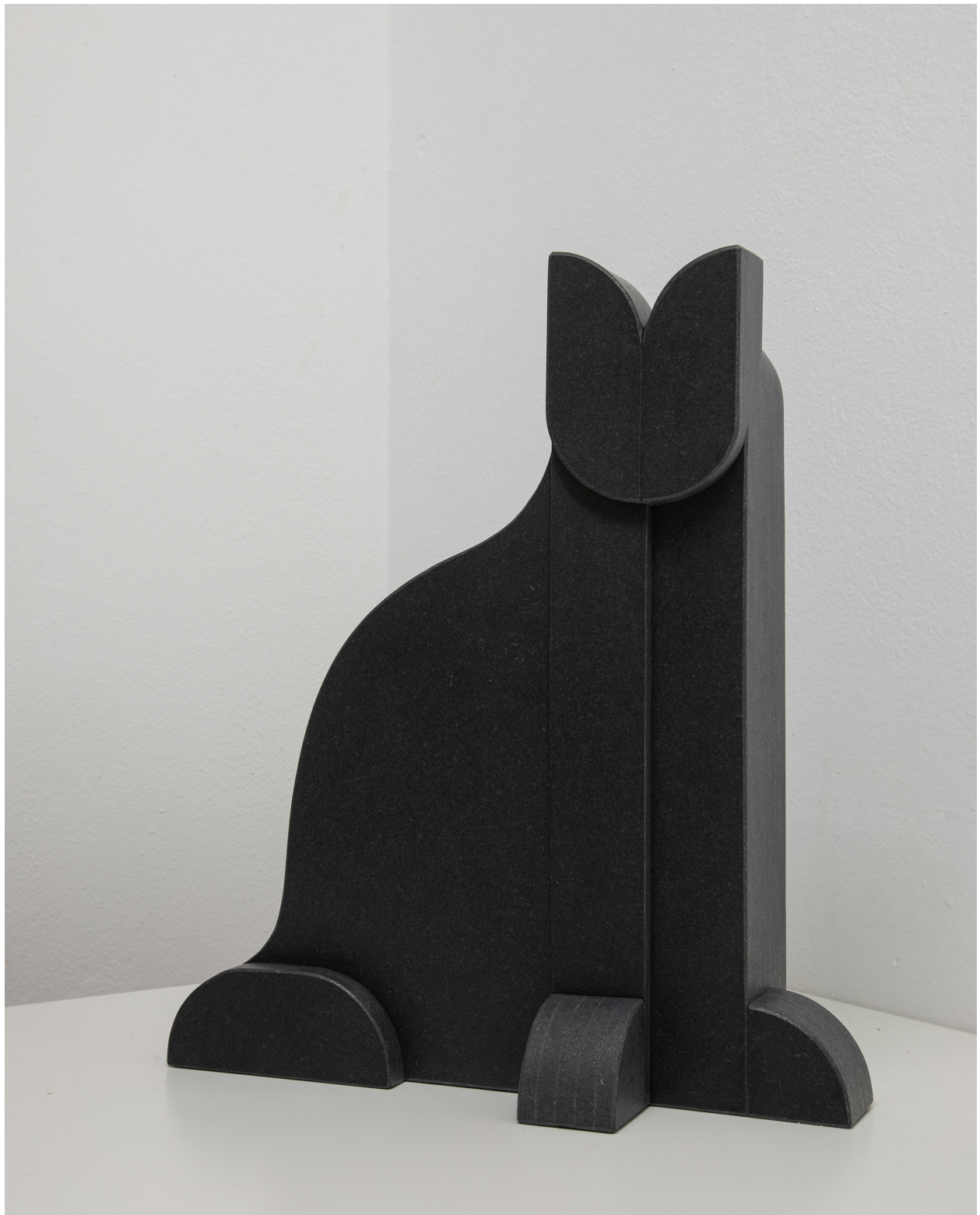
Federico Cantale, Felina, 2021, Granite Fantastic Black, 45x38x12 cm