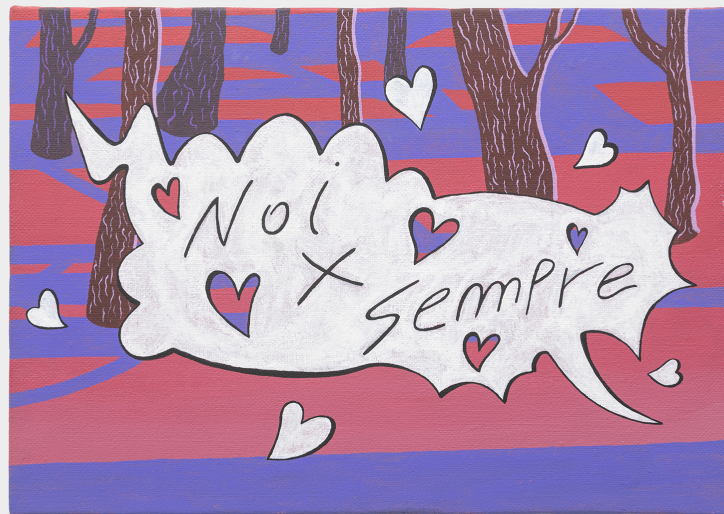
Jimmy Milani, Untitled (Nei Fantaboschi di Zona), 2021, Acrylic on Canvas, 30x40 cm