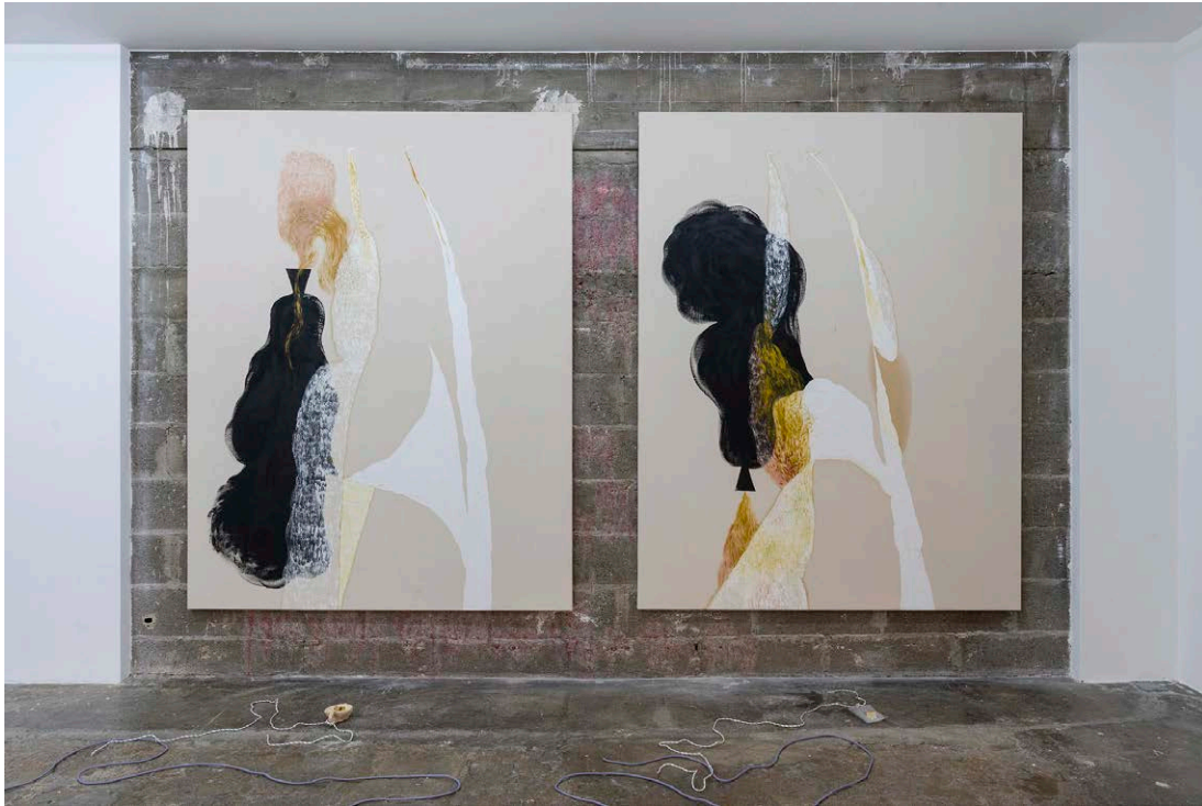
One foot is in the water, and one foot is on the land 2021 - gesso, marble dust, acrylic, pigments, linen oil on canvas 195 x 150 cm