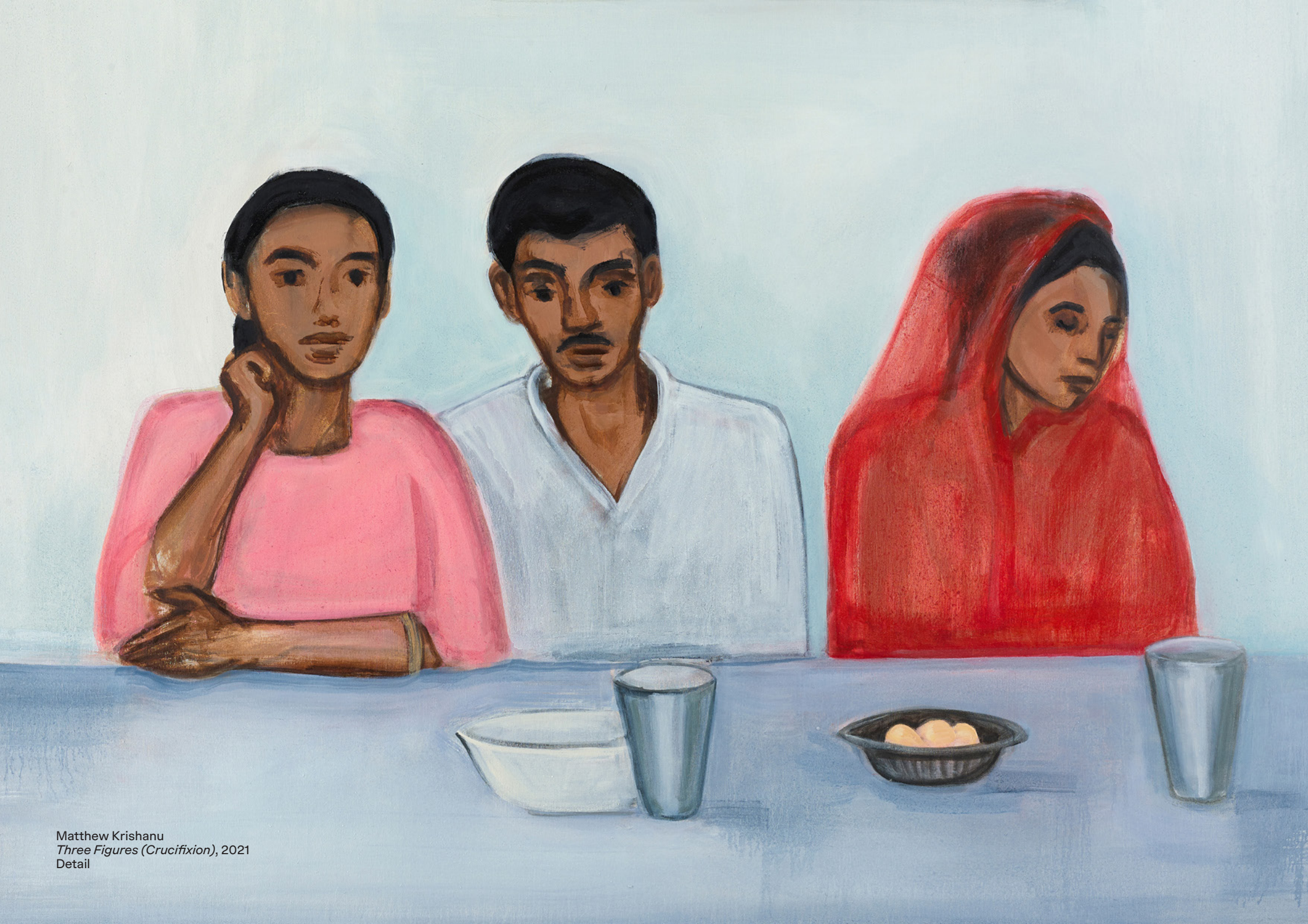
Matthew Krishanu Three Figures (Crucifixion) , 2021 Detail