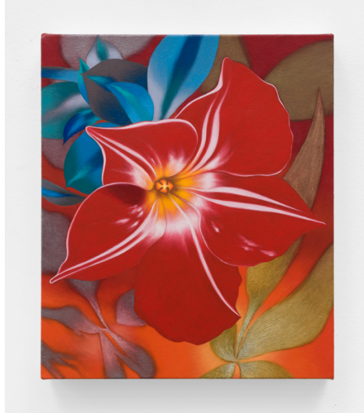
Tom Allen, Yellow Cross , 2019, Oil on Canvas, X Museum Collection