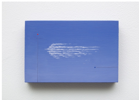
Alexandra Noel, Go Around Cloud , 2021, Oil and Enamel on Panel, Courtesy the artist and Bodega, New York