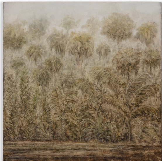
Lucas Arruda, Untitled (from the Deserto – Modelo series) , 2019, Oil on Canvas, X Museum Collection

'Particularities' is a group exhibition about contemporary, small-scale painting. At a time of increasing scale, expansion and general hypertrophy, this exhibition trains its gaze on painting practices that do the exact opposite. Inevitably considering small-scale painting as an ethical and ecological position, it responds to and builds upon the work of approximately twenty international artists working in the medium of painting today. Subject matter and modes of painting may vary, one thing all of these artists definitely have in common is a tendency toward economy of scale. And although formal modesty is the filament that binds them together, they otherwise remain wholly themselves, radiating like so many irreducible parts of a provisional constellation of contemporary painting.