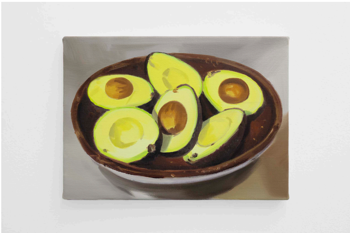
Avocados , 2021. Oil on canvas 9 1/2 x 13 1/8 x 3/4 in 24.2 x 33.3 x 2 cm