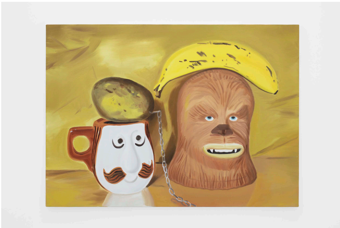
Strangers , 2021. Oil on canvas 25 5/8 x 35 7/8 in 65.2 x 91 cm