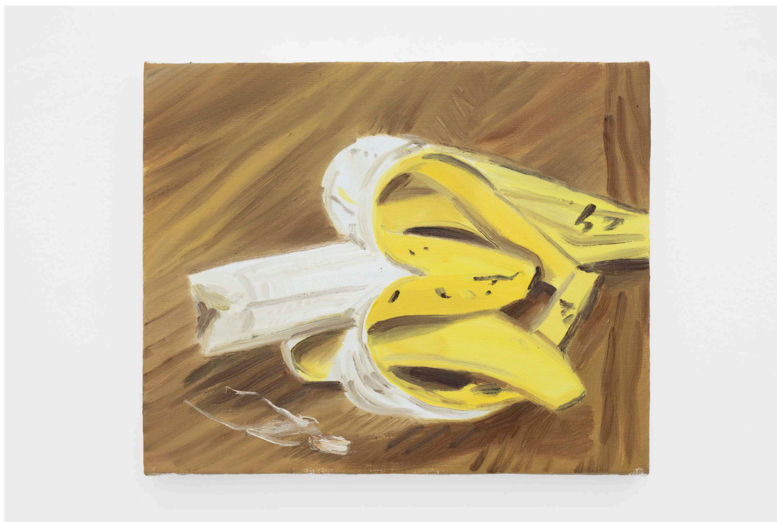
Banana , 2021. Oil on canvas 10 3/4 x 8 5/8 in 27.3 x 22 cm