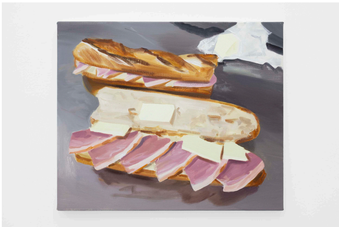
Sandwich , 2021. Oil on canvas 15 x 17 7/8 in 38 x 45.5 cm