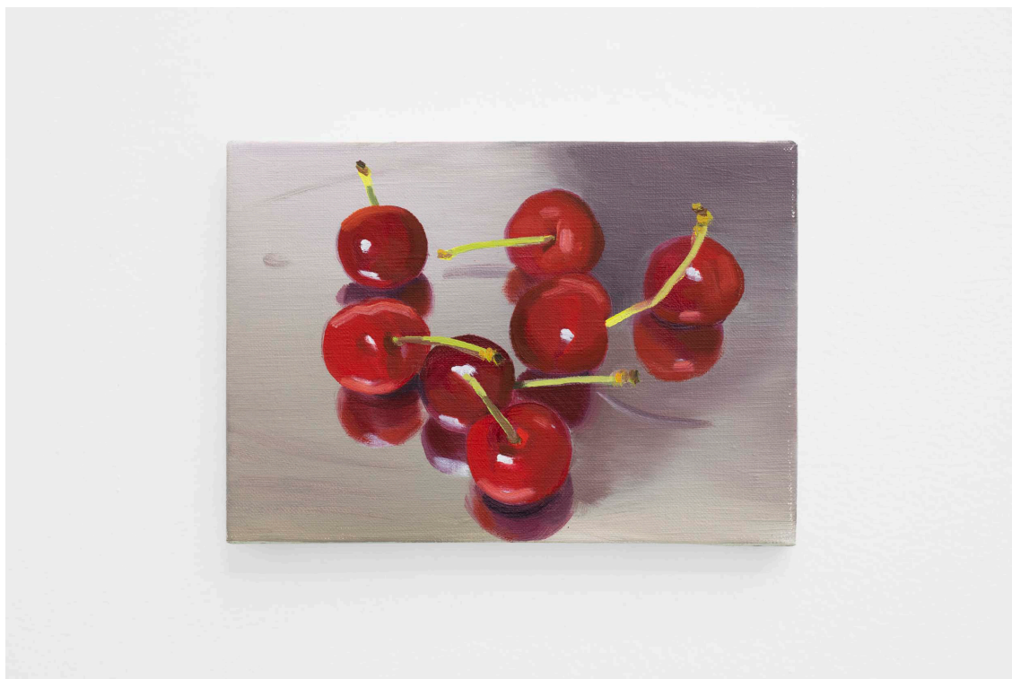
Cherries , 2021. Oil on canvas 6 1/4 x 9 x 3/4 in 15.8 x 22.7 x 2 cm