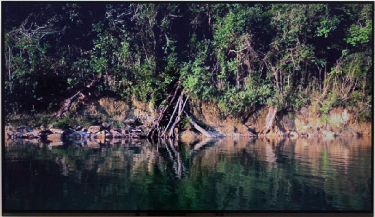
Julien Bismuth „somos apenas corpos (we are barely bodies)“, 2019 Single-channel video no sound 22.03 min 1/3 + 2 A.P.