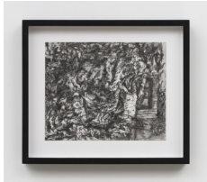
Dan Herschlein In the Fire , 2021 Graphite and butcher block conditioner on paper 8 x 10 in 20.3 x 25.4 cm 11 5/8 x 13 5/8 in Framed 29.5 x 34.6 cm Framed (MBLA DH061)