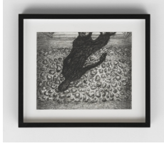
Dan Herschlein My Shadow , 2021 Graphite and butcher block conditioner on paper 8 x 10 in 20.3 x 25.4 cm 11 5/8 x 13 5/8 in Framed 29.5 x 34.6 cm Framed (MBLA DH060)