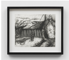
Dan Herschlein The Pulley System , 2021 Graphite and butcher block conditioner on paper 10 x 8 in 25.4 x 20.3 cm 11 5/8 x 13 5/8 in Framed 29.5 x 34.6 cm Framed (MBLA DH063)