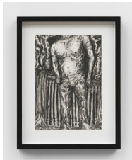
Dan Herschlein There Was Nothing Behind Him , 2021 Graphite and butcher block conditioner on paper 9.5 x 7 in 24.1 x 17.8 cm 13 1/2 x 10 1/2 in Framed 34.3 x 26.7 cm Framed (MBLA DH064)