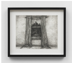
Dan Herschlein Untitled, 2021 Graphite and butcher block conditioner on paper 8 x 10 in 20.3 x 25.4 cm 11 5/8 x 13 5/8 in Framed 29.5 x 34.6 cm Framed (MBLA DH062)