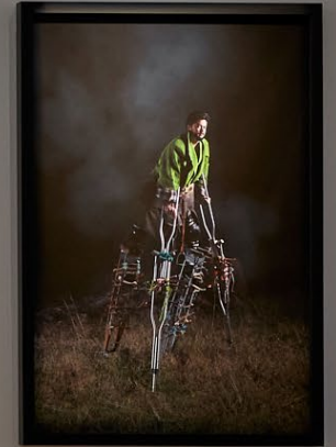
Shan Turner-Carroll, Edge Of The Garden , 2020, installation view, Murray Art Museum Albury, NSW