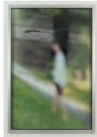
Rose Marcus Imagine (Field II) , 2017 Inkjet print on plexiglass with no white ink, aluminum frame 72 x 48 in (182.9 x 121.9 cm) RM009