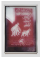
Rose Marcus Shadow , 2018 Glass, inkjet print without white ink, aluminum frame 49 x 33.5 in (124.5 x 85.1 cm) RM010