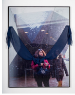
Rose Marcus Tony (Tory) , 2017 Inkjet print on adhesive vinyl, PVC, plexi-glass, silk chiffon, iron frame 65.5 x 49.5 in (166.4 x 125.7 cm) RM008