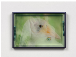
Rose Marcus 2021 , 2021 Edition 1 of 3 + 2 AP Print on vinyl with no white ink adhered to architectural glass, metal frame 8 x 12 in (20.3 x 30.5 cm) or 12 x 8 in (30.5 x 20.3 cm) RM011-1