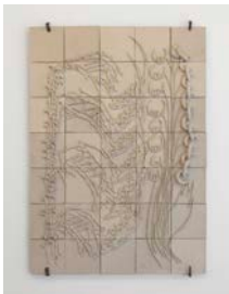
Tomás Díaz Cedeño Bosque , 2020 High temperature glazed ceramics and aluminum 79 x 59 cm 31 1/10 x 23 23/100 in