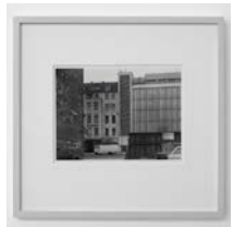
Michael Schmidt Untitled (from Berlin Wedding), 1976-78 Gelatin silver bromide print toned gold framed by the artist Framed: 44.8 x 47.2 cm Unique vintage print