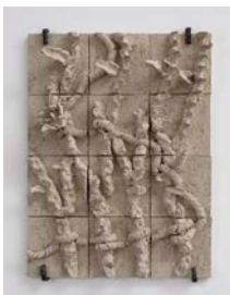
Tomás Díaz Cedeño Background foreground , 2020 High temperature glazed ceramics and aluminum 48 x 35 cm 18 9/10 x 13 39/50 in