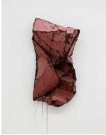
Tomás Díaz Cedeño Untitled , 2021 Pressed vel mix with plastic mesh, iron oxide and screen printing paint 100 x 50 x 20 cm 39 3/8 x 19 3/4 x 7 7/8 in