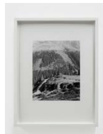
Michael Schmidt Untitled (from NATUR) , 1987/2014 Gelatin silver bromide print toned gold framed by the artist Framed: 26.5 x 20.5 cm 2/4 + 2 AP