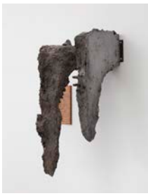
Tomás Díaz Cedeño Usando este cuerpo , 2019 Concrete and copper 110 x 80 x 50 cm 43 31/100 x 31 1/2 x 19 69/100 in