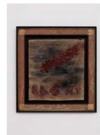
Antoni Tàpies Sin Título, 1970 Paint, pencil and grattage on crumpled cardboard 60.5 x 55.3 cm 23 41/50 x 21 77/100 in