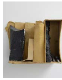
Tomás Díaz Cedeño Say the words , 2018 Oggun ladder, concrete nails, seeds, pigment, hemp, blanket, plaster 40 x 50 x 30 cm 15 3/4 x 19 69/100 x 11 81/100 in