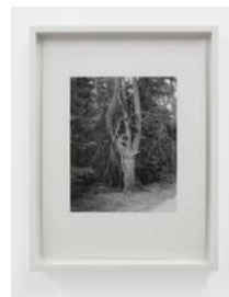
Michael Schmidt Untitled (from NATUR) , 1989/2014 Gelatin silver bromide print toned gold framed by the artist Framed: 26.5 x 20.5 cm 2/4 + 2 AP