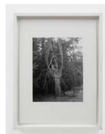
Michael Schmidt Untitled (from NATUR) , 1989/2014 Gelatin silver bromide print toned gold framed by the artist Framed: 26.5 x 20.5 cm 2/4 + 2 AP