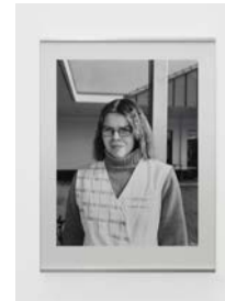
Michael Schmidt Irgendwo, 2001-2004 Gelatin silver bromide print toned gold framed by the artist Framed: 41 x 30.5 cm Ed. 5/6 + 1 AP