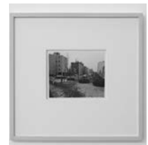
Michael Schmidt Untitled (Berlin, Schöneberg), 1981 Gelatin silver bromide print toned gold framed by the artist Framed: 44.8 x 47.2 cm Unique vintage print