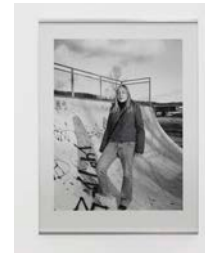
Michael Schmidt Irgendwo, 2001-2004 Gelatin silver bromide print toned gold framed by the artist Framed: 41 x 30.5 cm Ed. 5/6 + 1 AP