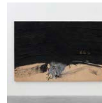
Antoni Tàpies Cap-666, 1990 Mix media on wood 200 x 300 x 5 cm 78 3/4 x 118 1/8 x 2 in